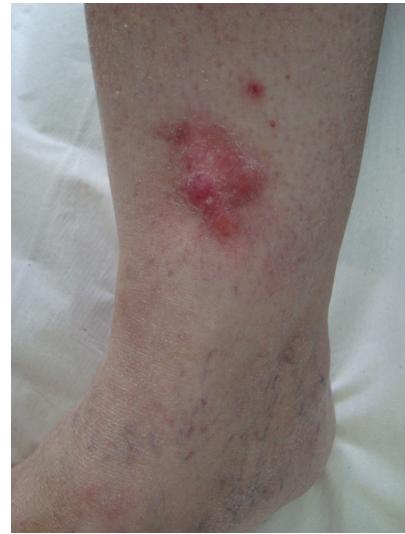
FIGURE 1: Clinical appearance of desmoplastic melanoma (patient n°4): red plaque of 5 × 3 cm on left leg. The diagnoses that are suspected clinically range from basal cell carcinoma to dermatofibrosarcoma protuberans or amelanotic melanoma.

The incidence of desmoplastic melanoma cases in our population was 0.3% (5/1770). Of the 5 patients evaluated, 2 (40%) were males and 3 (60%) female. This female predominance in sex distribution is not in accordance with previous case series [3]. The median age at diagnosis of DM is approximately 10 years higher than the one for conventional melanoma [4]. In our case the average age was 62.4 years ranging from 56 to 68 years. Head and neck is the preferred site for DM; in the series from the Massachusetts General Hospital, 75% of the tumors occurred in this anatomic site [5]. None of our 5 cases had a primary melanoma in the head and neck. The clinical presentation of desmoplastic melanoma is often challenging. Usually it has an innocuous clinical appearance and it is described as an indurated discoid papule, plaque, or nodule. Pigmentation is frequently absent (Figure 1), although a lentigo or lentigo maligna-like discoloration adjacent to the nodule is not uncommon [6]. The diagnoses that are suspected clinically range from benign (scar, dermatofibroma, melanocytic nevus) to malignant (basal cell or squamous cell carcinoma, sarcoma, or amelanotic melanoma) lesions. In a series of 113 cases of desmoplastic melanoma melanoma was the initial clinical diagnosis in only 27% of the cases [3].