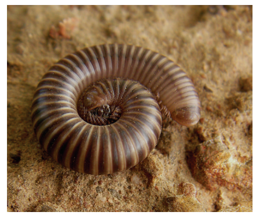
FIGURE 3: Spirostreptid millipede from Kou. S. Tchibozo phot., 2012.

of millipede is small, they will constitute a poor source of protein. Their guts mainly contain soil and litter remains [24], but their calcified exoskeleton might constitute a considerable source of calcium, which may constitute 13–17% of the dry weight [29–31] or 9% of the fresh weight [32], In fact, millipedes are considered an essential source of calcium for egg production in certain birds [30, 33, 34]. In this work we present data based on Tymbodesmus falcatus , one of the species eaten by the Bobo people.