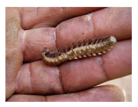
\begin{tabular}{ll} Figure 2: gomphodesmid millipede from Kou after boiling. S. Tchibozo phot., 2012. \end{tabular}