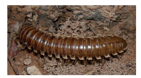
FIGURE 1: Live gomphodesmid millipede ( Tymbodesmus falcatus ) from Kou. S. Tchibozo phot., 2011.

Until this study, the nutritional value of millipedes has never been assessed. Considering that the muscle volume