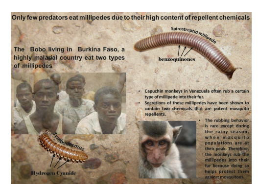
FIGURE 5: Scheme of the exceptional use of toxic millipedes: as demonstrated for capuchin monkeys, that during the rainy season use millipedes' secretions against mosquitoes, Bobo people in Burkina Faso may consume millipedes for their antiparasite effect.

Considering that malaria represents the main cause of mortality in the adult sub-Saharan population and that Burkina Faso is endemic for several Plasmodium species [67, 68], biocultural adaptations aimed at controlling this pathogen are strongly expected. Natural benzoquinones are known to exert an antiplasmodic activity in vitro [69], and their metabolites might act as systemic repellents against mosquitoes or as antimalarial prophylaxis in the Bobos. Moreover, studies on West African populations have demonstrated strong links between malaria, sub-lethal cyanide intake from bitter cassava, and