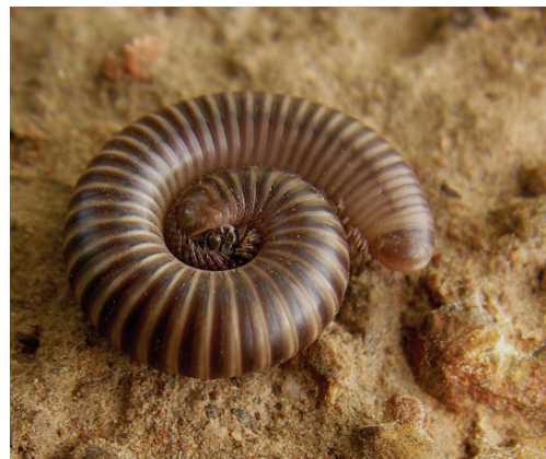
FIGURE 3: Spirostreptid millipede from Kou. 2012.

of millipede is small, they will constitute a poor source of protein. Their guts mainly contain soil and litter remains [24], but their calcified exoskeleton might constitute a considerable source of calcium, which may constitute 13–17% of the dry weight [29–31] or 9% of the fresh weight [32]. In fact, millipedes are considered an essential source of calcium for egg production in certain birds [30, 33, 34]. In this work we present data based on Tymbodesmus falcatus , one of the species eaten by the Bobo people.