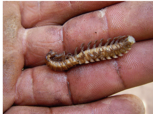
FIGURE 2: gomphodesmid millipede from Kou after boiling. S. Tchiboza phot., 2012.