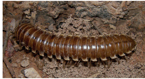
FIGURE 1: Live gomphodesmid millipede ( Tymbodesmus falcatus ) from Kou.

Until this study, the nutritional value of millipedes has never been assessed. Considering that the muscle volume