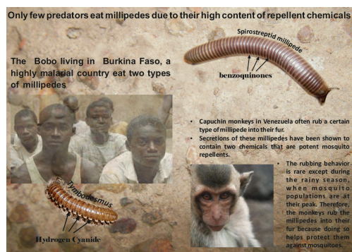
FIGURE 5: Scheme of the exceptional use of toxic millipedes: as demonstrated for capuchin monkeys, that during the rainy season use millipedes' secretions against mosquitoes, Bobo people in Burkina Faso may consume millipedes for their antiparasite effect.

Considering that malaria represents the main cause of mortality in the adult sub-Saharan population and that Burkina Faso is endemic for several Plasmodium species [67, 68], biocultural adaptations aimed at controlling this pathogen are strongly expected. Natural benzoquinones are known to exert an antiplasmodic activity in vitro [69], and their metabolites might act as systemic repellents against mosquitoes or as anti-malarial prophylaxis in the Bobos. Moreover, studies on West African populations have demonstrated strong links between malaria, sub-lethal cyanide intake from bitter cassava, and