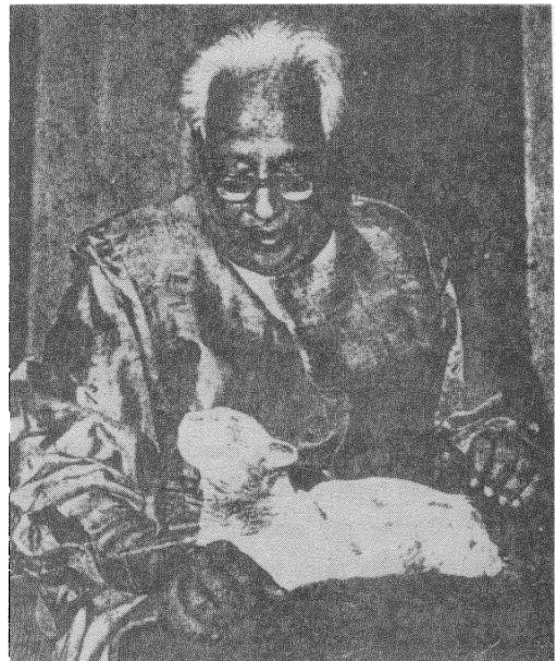
S.N. Bose with his house cat