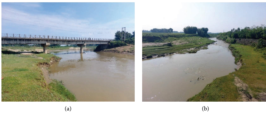
FIGURE 4: Continued.