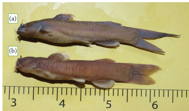
FIGURE 3: Photographic comparison of (a) A. waikhomi and (b) A. mangois .