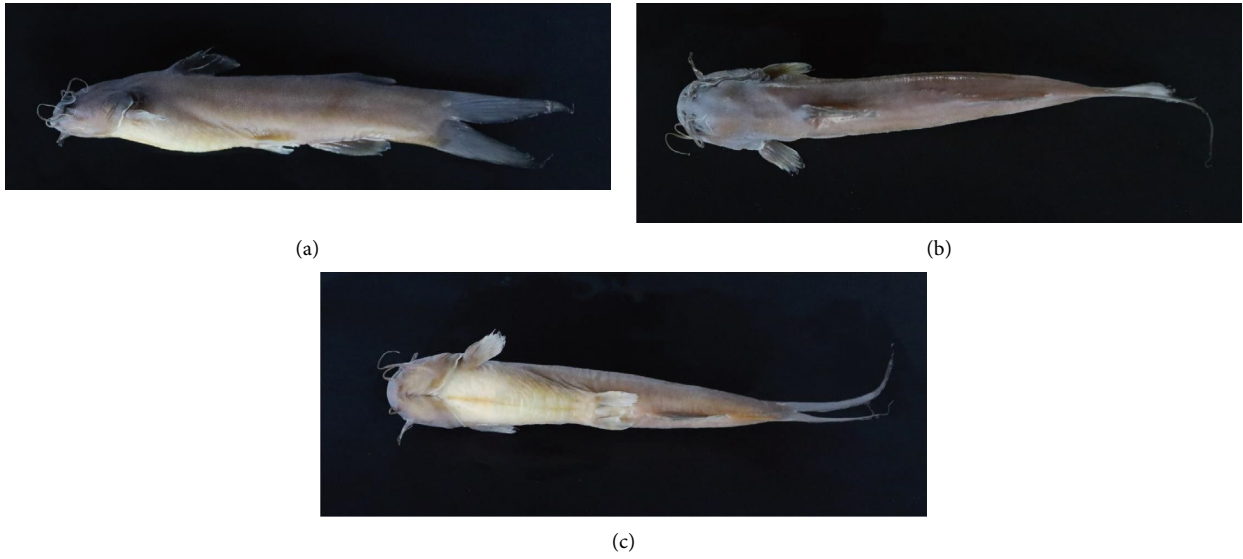
FIGURE 2: (a): Lateral view, (b) dorsal view, and (c) ventral view of A. waikhomi .