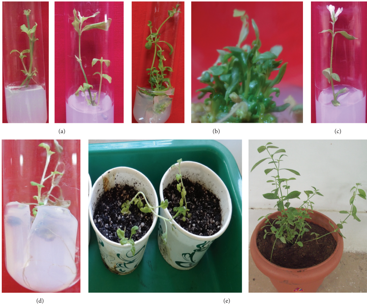
FIGURE 1: (a) Induction of shoots from the nodal meristems of the explants. (b) Multiplication of shoots of R. pectinata . (c) In vitro flowering in R. pectinata . (d) Induction of roots from the in vitro regenerated shoots in half strength MS medium with IBA. (e) Stages in hardening of plantlets in the greenhouse.

studied for flower induction in vitro , 12/12 hr light/dark photoperiod with 30 \mu\text{mol m}^{-2} \text{s}^{-1} SFPD light intensity was found best. The in vitro induced flowers were morphologically similar to those of the plants in the field. Similar reports were published in Vitex negundo [33] and Ipomoea sepiaria [18]. The effect of photoperiod on in vitro flowering has also been studied in Psychomorhis pusilla [12]. About 80% shoots were responded in in vitro flowering in the present study (Table 3). The in vitro shoots end with the single inflorescence as in the naturally grown plants (Figure 1(c)).