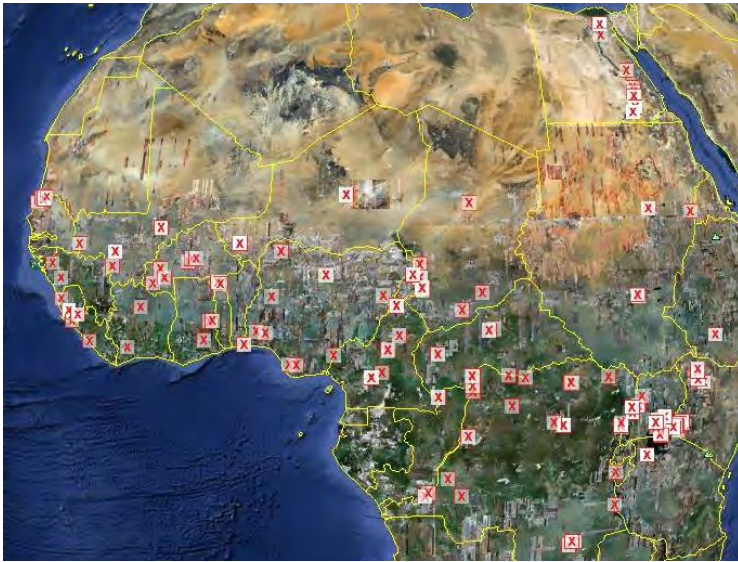
Figure 1. Global distribution of L. niloticus from Froese and Pauly (2010). Map from Google Earth (2011).