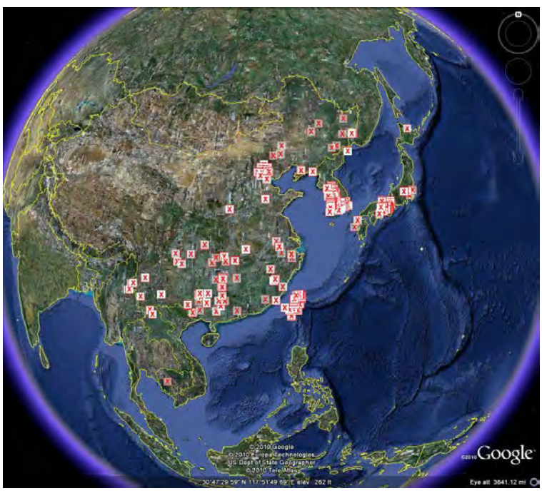
Figure 1. Some of the global distribution of P. parva from Froese and Pauly (2010). Map from Google Earth (2011).