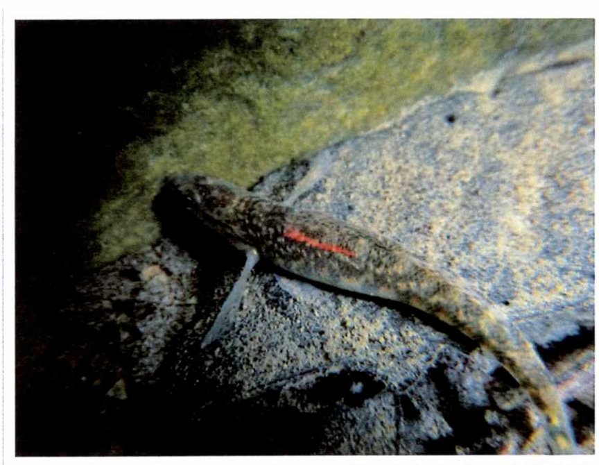
Figure 3. Juvenile Kentucky Arrow Darter marked with a Visible Implant Elastomer (VIE) tag (red, left dorso-lateral side) to prior to stocking in Long Fork, P. L. Rakes photo.