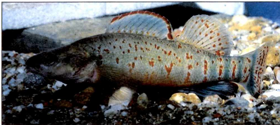
Long Fork, Clay Co., Kentucky (above); adult male Kentucky Arrow Darter used for captive spawning at CFI (below), J. R. Shute photo.