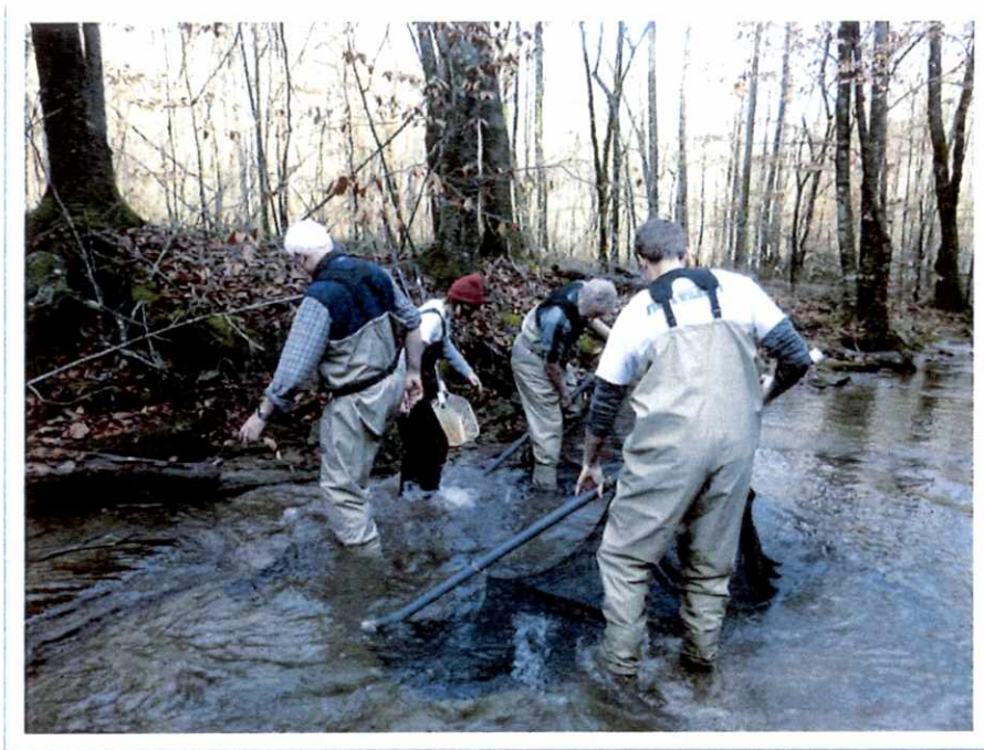
Figure 2. CFI and KDFWR staff conducting mark-recapture surveys in Long Fork, Clay Co., KY.