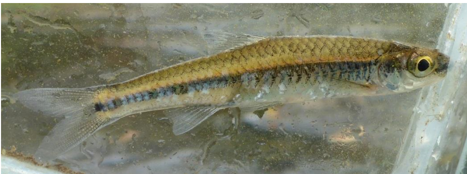
Figure 21. One Cahaba Shiner collected at Site 5.