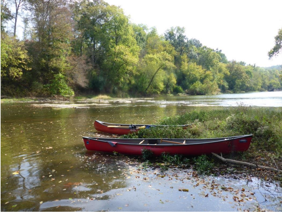
Figure 17. Second riffle downstream of mouth of Crooked Creek in Locust Fork (Site 4).