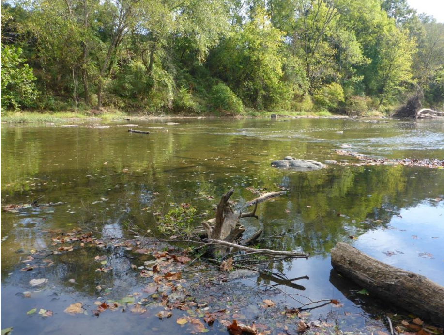
Figure 19. Third riffle downstream of mouth of Crooked Creek in Locust Fork (Site 5).