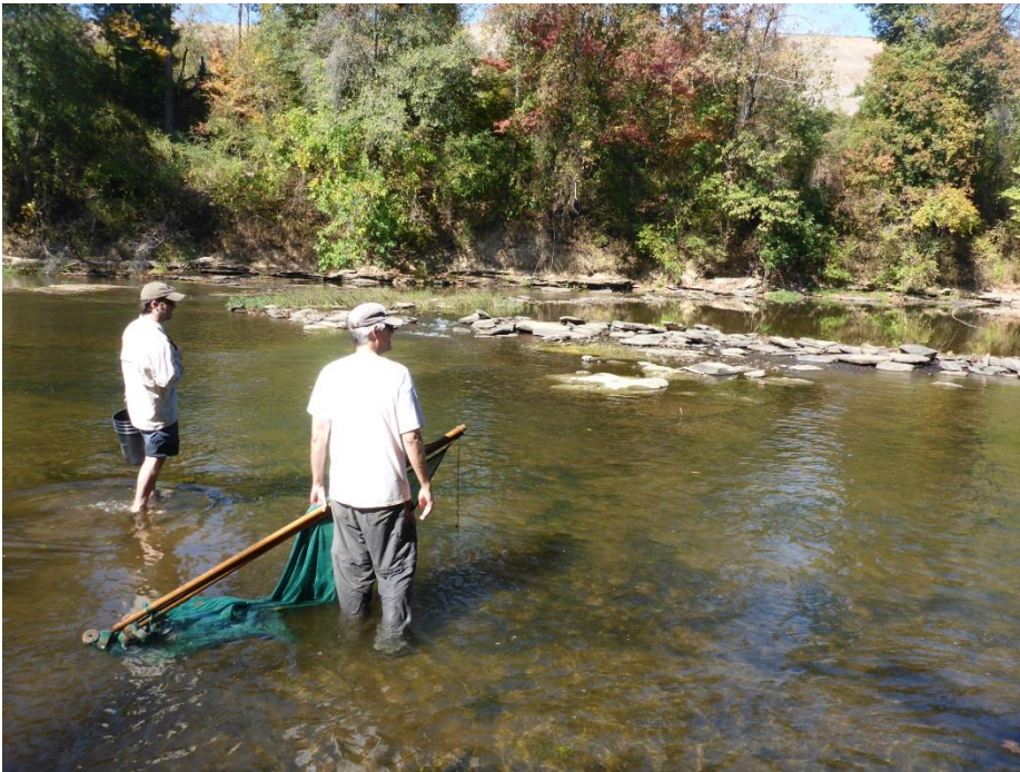
Figure 4. First riffle upstream of mouth of Crooked Creek in Locust Fork (Site 2).