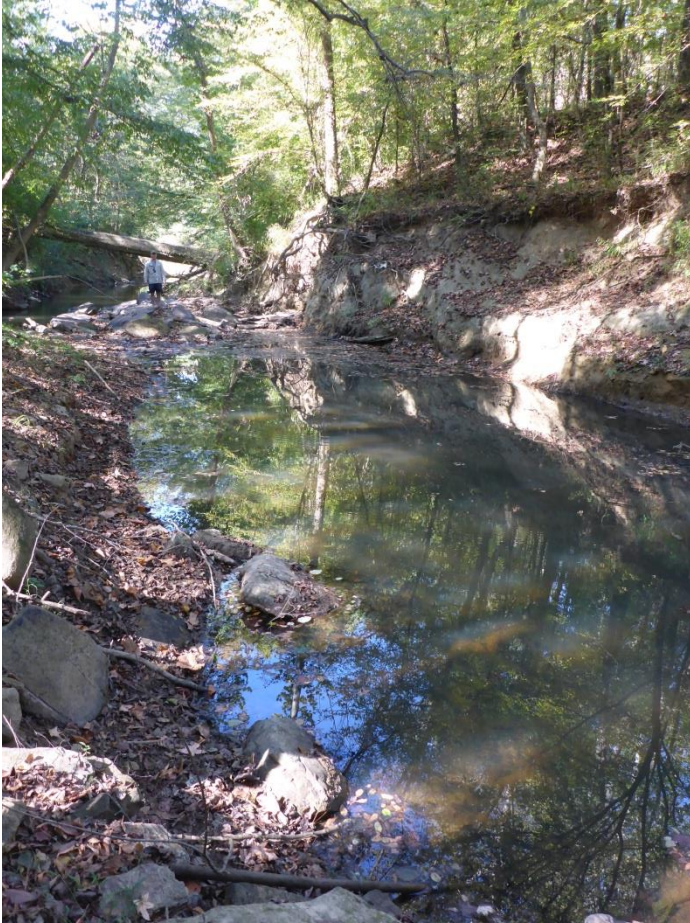
Figure 3. First shallow area upstream of mouth in Crooked Creek (Site 1).