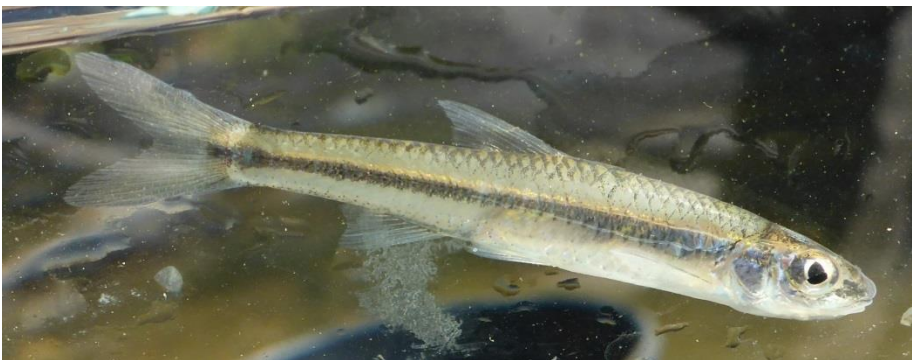
Figure 10. One Cahaba Shiner collected at Site 2.