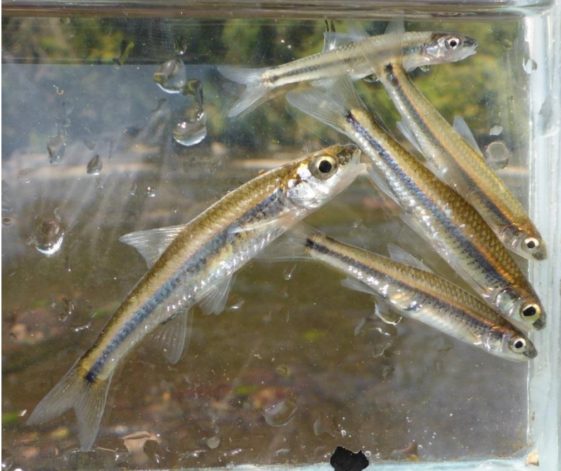
Figure 14. Four Cahaba Shiners (bottom) and one Mimic Shiner (top) collected at Site 3.