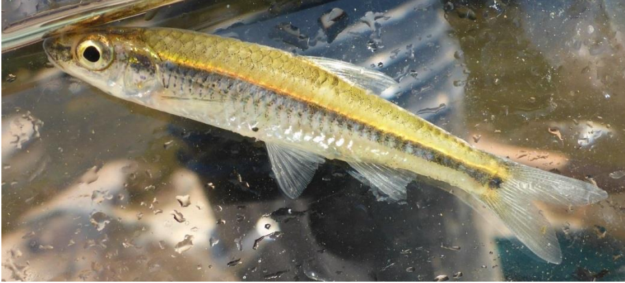
Figure 11. One Cahaba Shiner collected at Site 2.