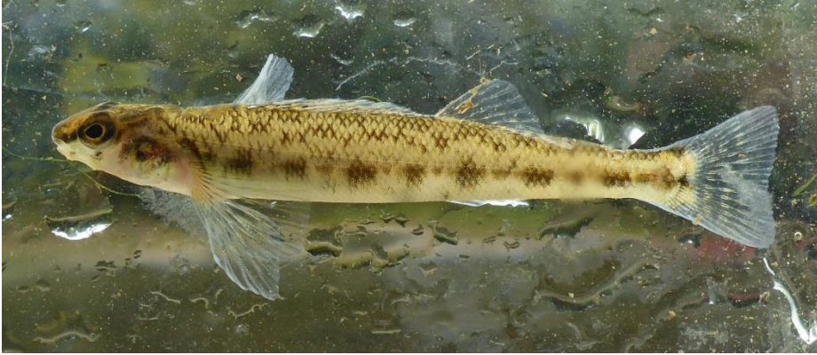
Figure 22. One Coal Darter collected at Site 5.