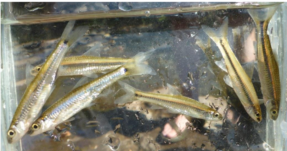
Figure 9. Six Cahaba Shiners collected at Site 2.