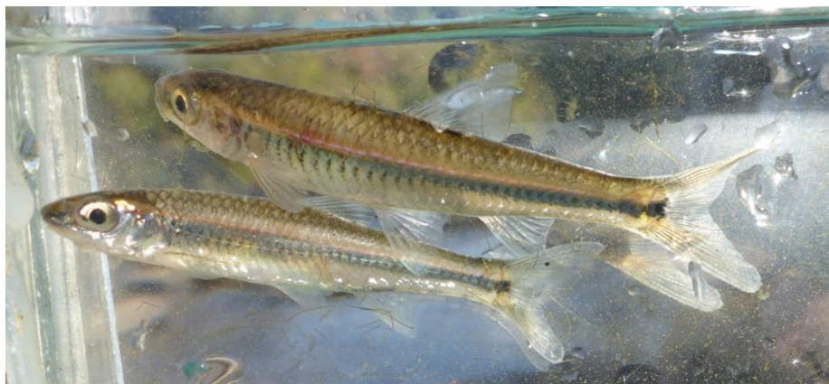
Figure 5. Two Cahaba Shiners collected at Site 2.