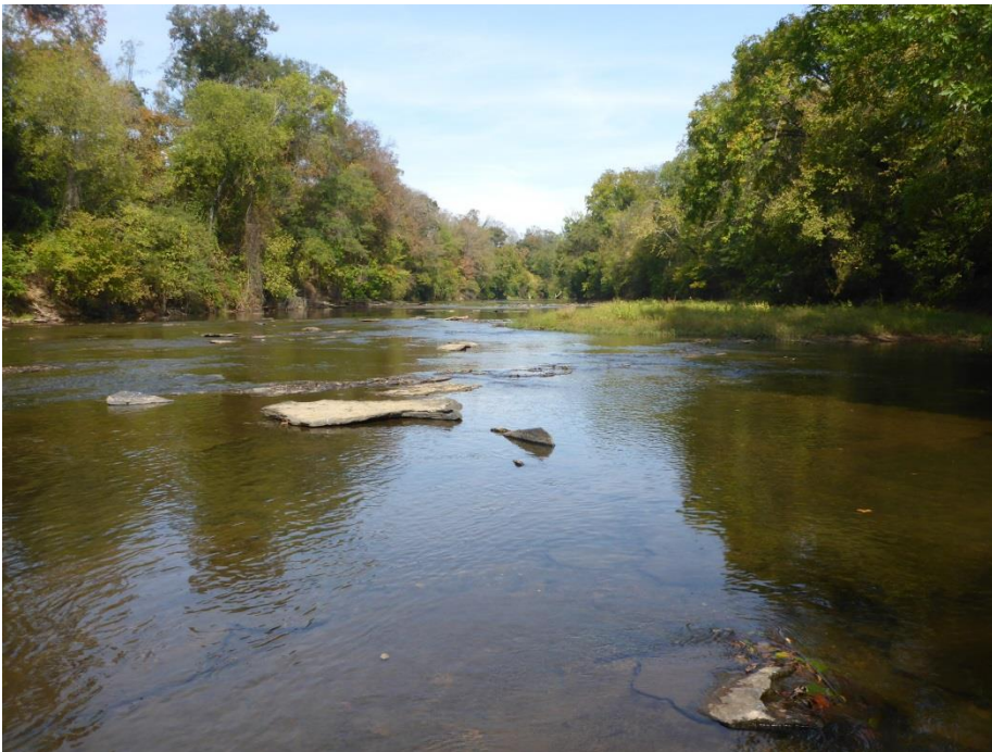
Figure 13. First riffle downstream of mouth of Crooked Creek in Locust Fork (Site 3).