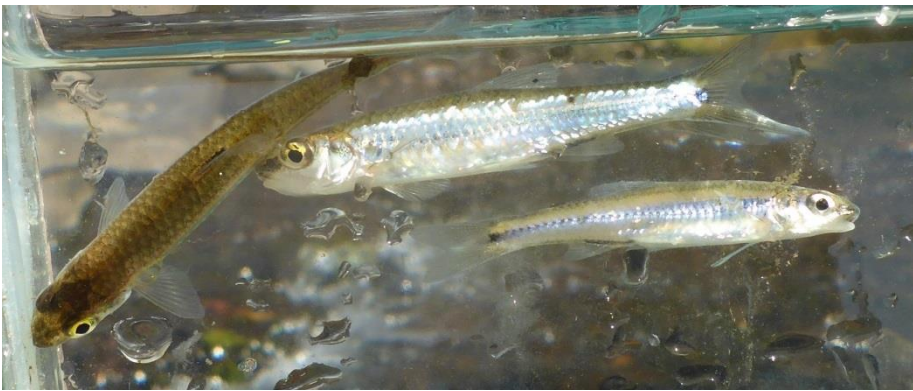
Figure 12. Three Cahaba Shiners collected at Site 2.