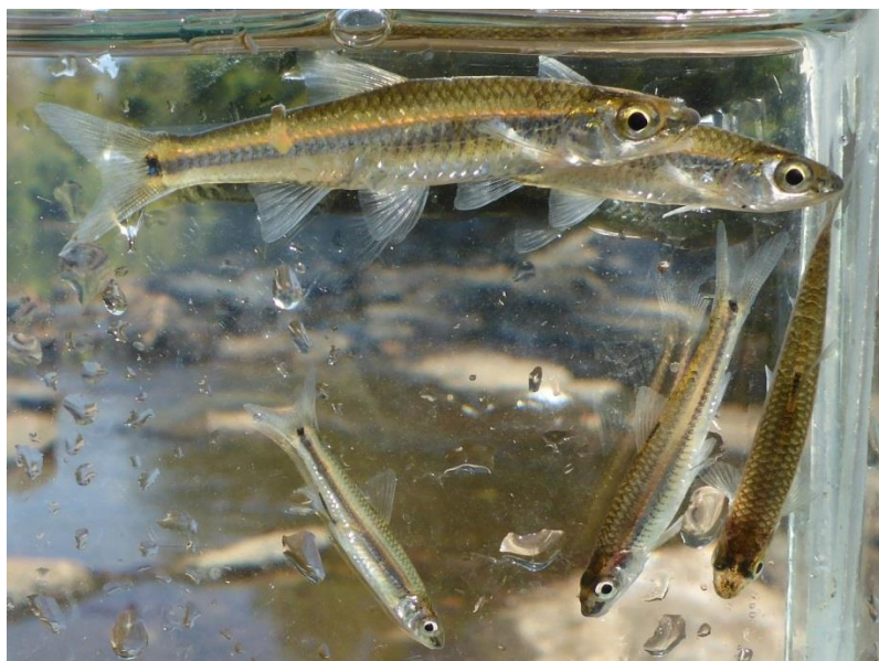
Figure 7. Five Cahaba Shiners collected at Site 2.