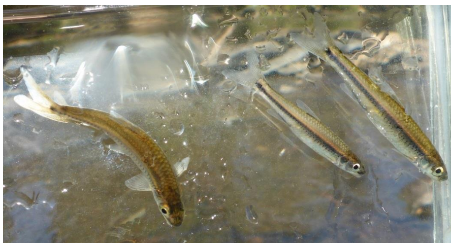
Figure 6. Three Cahaba Shiners collected at Site 2.