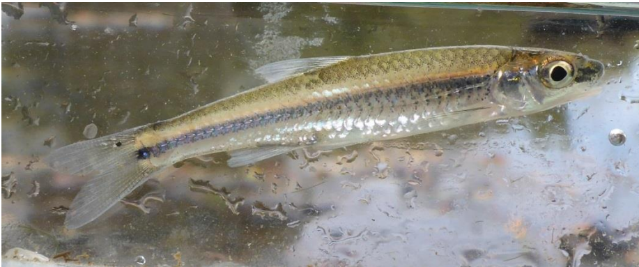
Figure 20. One Cahaba Shiner collected at Site 5.