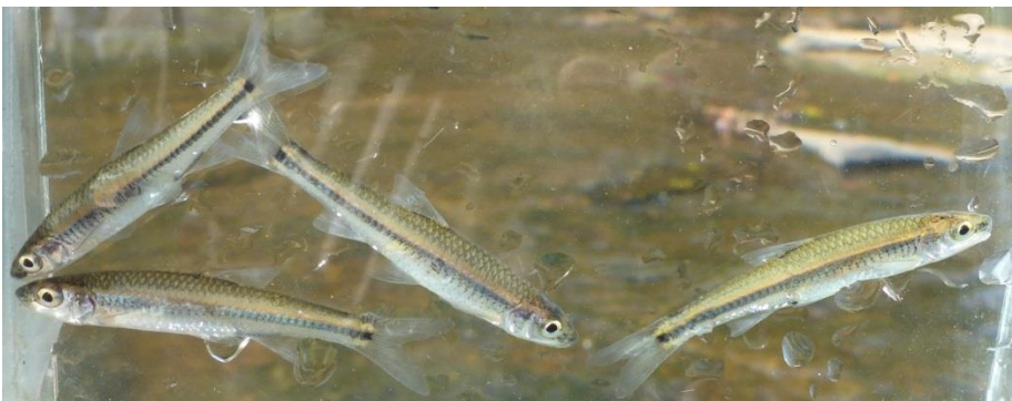
Figure 16. Four Cahaba Shiners collected at Site 3.