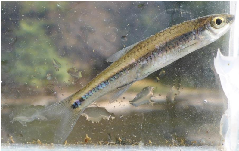
Figure 18. One Cahaba Shiner collected at Site 4.