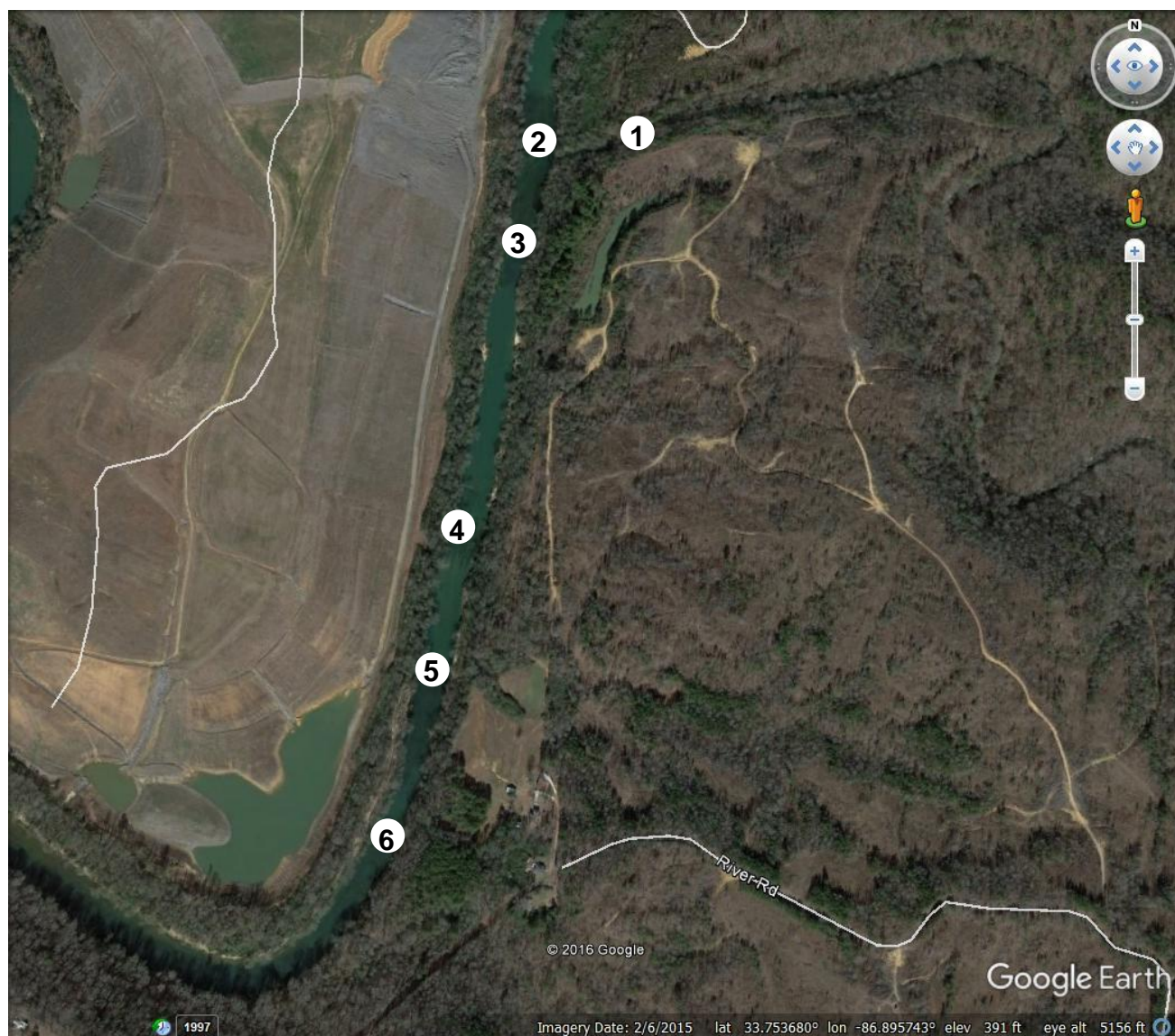
Figure 2. Sampling areas for Cahaba Shiners Notropis cahabae : 1) first shallow area upstream of mouth in Crooked Creek, 2) first riffle upstream of mouth of Crooked Creek in Locust Fork, 3) first, 4) second, 5) third, 6) and fourth riffle downstream of mouth of Crooked Creek in Locust Fork.