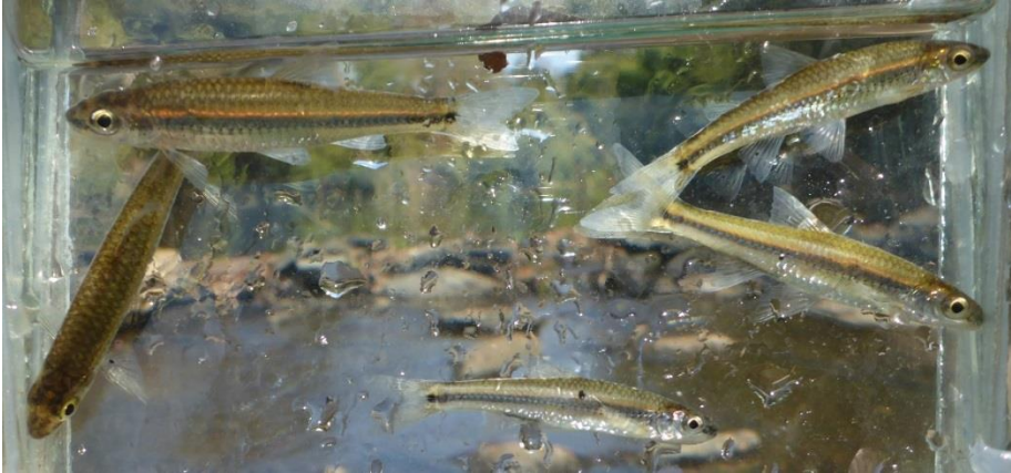
Figure 8. Five Cahaba Shiners collected at Site 2.