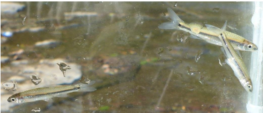
Figure 15. Three Cahaba Shiners collected at Site 3.