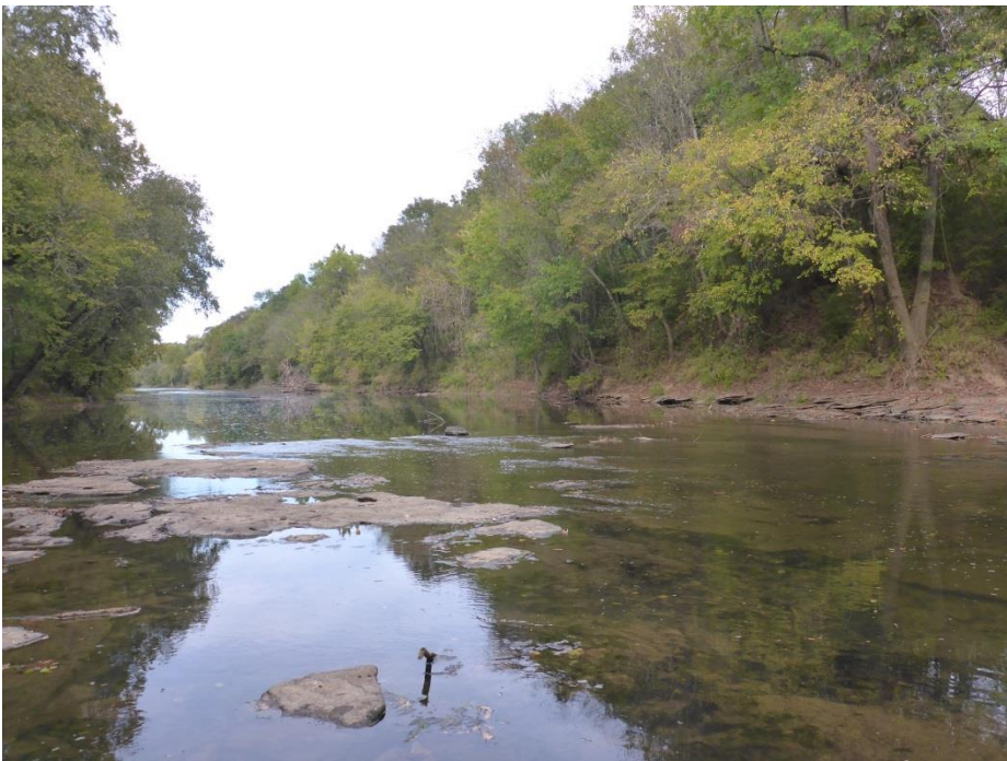
Figure 23. Fourth riffle downstream of mouth of Crooked Creek in Locust Fork (Site 6).