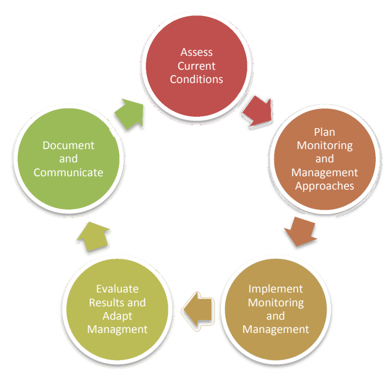
Figure 2. Adaptive management strategy for the Agreement.

The implementation of adaptive management will be the responsibility of the conservation team. The implementation of the conservation actions identified in Table 4 will require the development of survey and monitoring, plant and seed salvage, reclamation, weed management, and restoration plans and protocols.