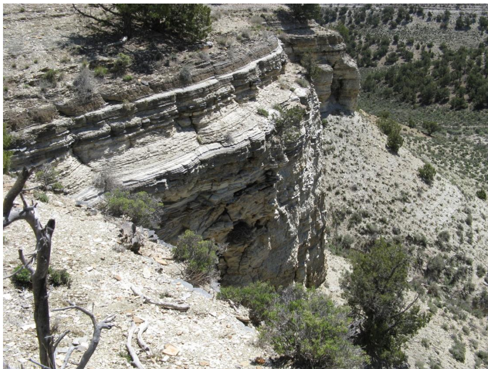
2011 Survey area near 3 Mile Canyon.