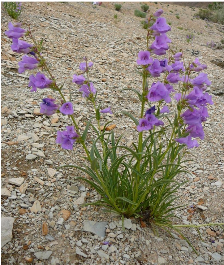
P. scariosus var. albifluvis