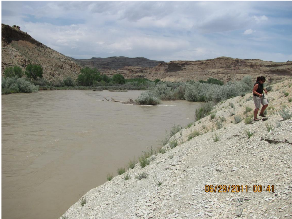
Researcher monitoring P. scariosus var. albifluvis at the White River site.