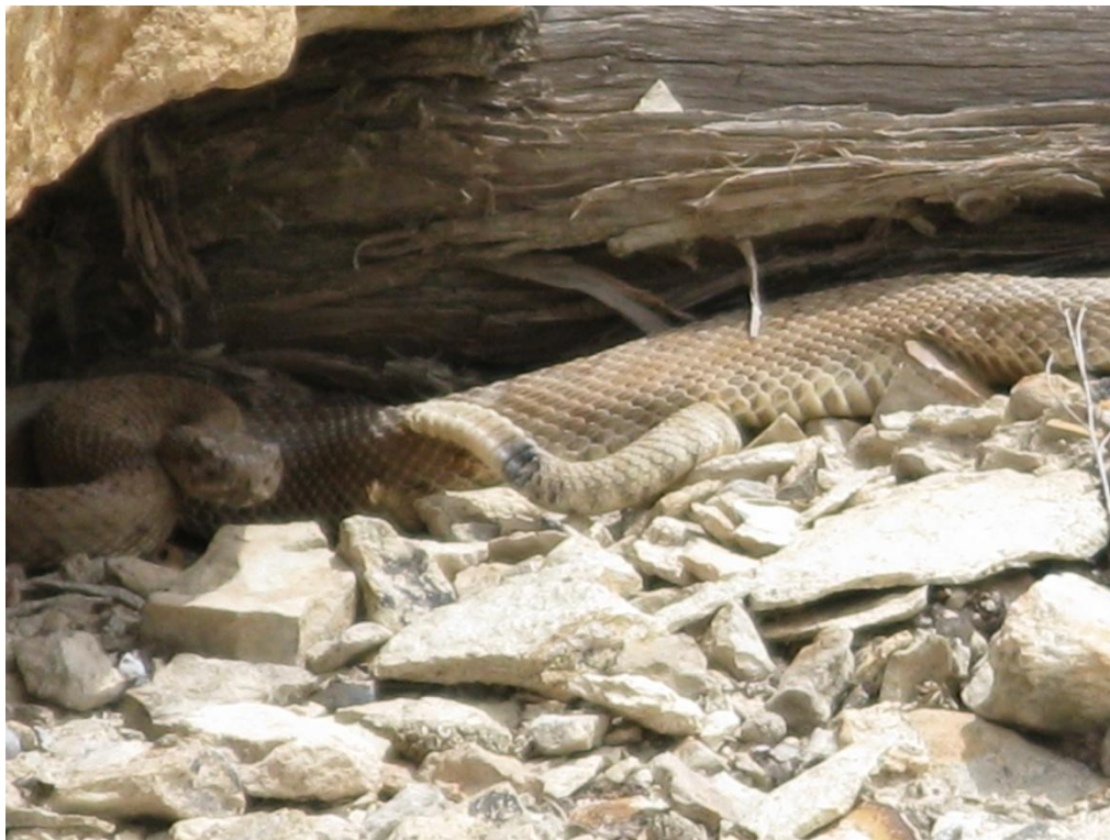
Rattle snake found along the survey path.