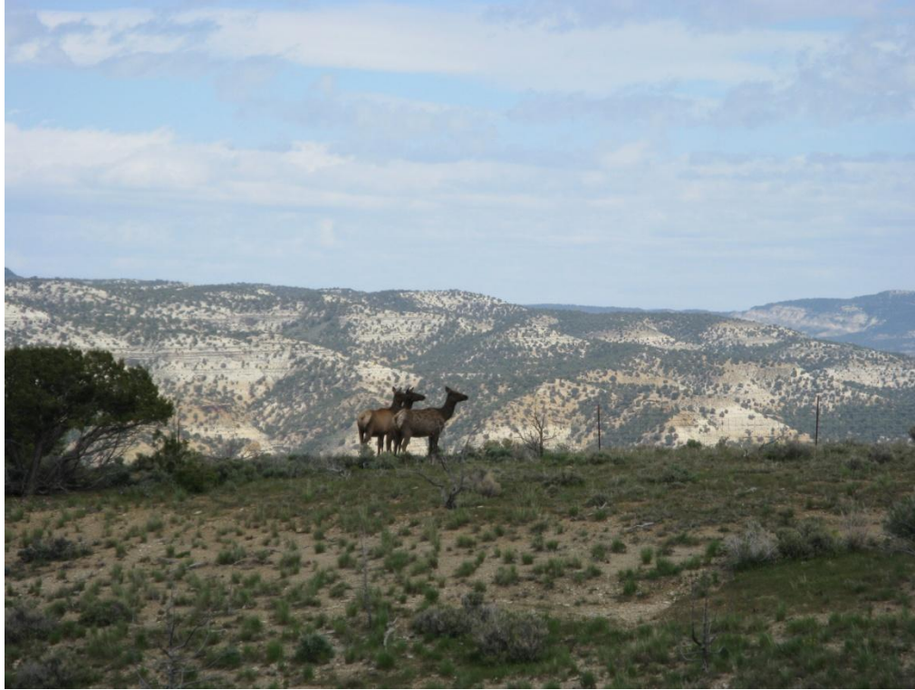
View of survey area and wildlife.