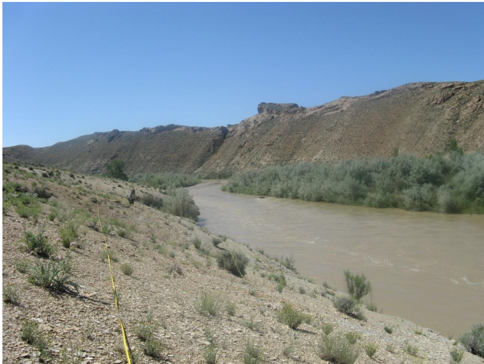
The White River site.