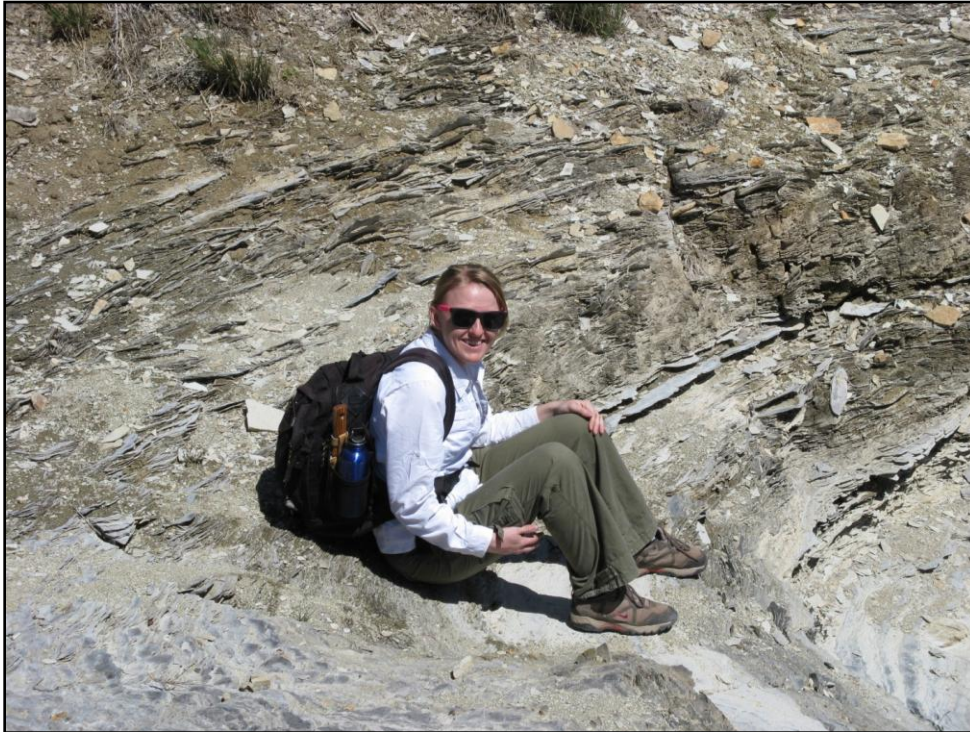
White-gray oil shale outcroppings of the Green River formation protruding from ridgeline edge.