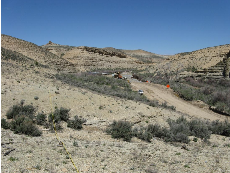
Construction of a bridge over Evacuation Creek near the Watson site. Watson site runs parallel to the tape measure in the photo.