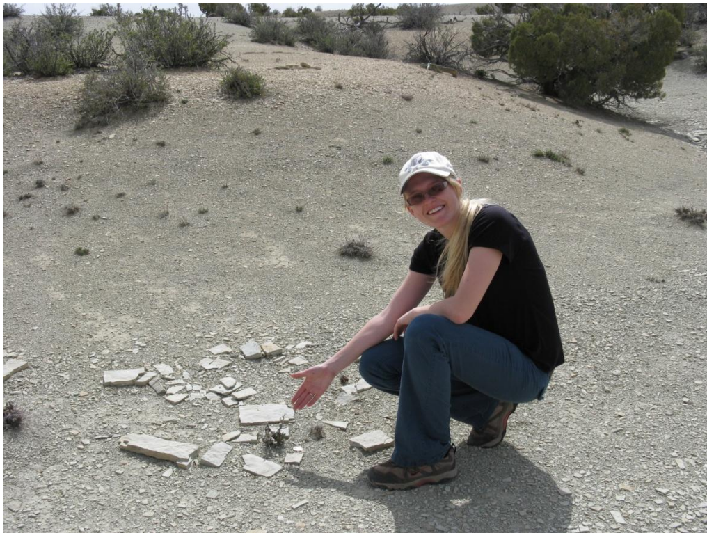
Researcher with P. grahamii at the Buck Canyon site