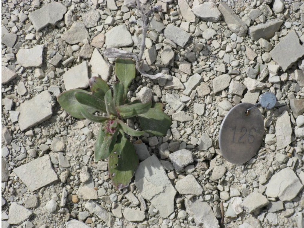
Monitored P. grahamii at the Buck Canyon site.