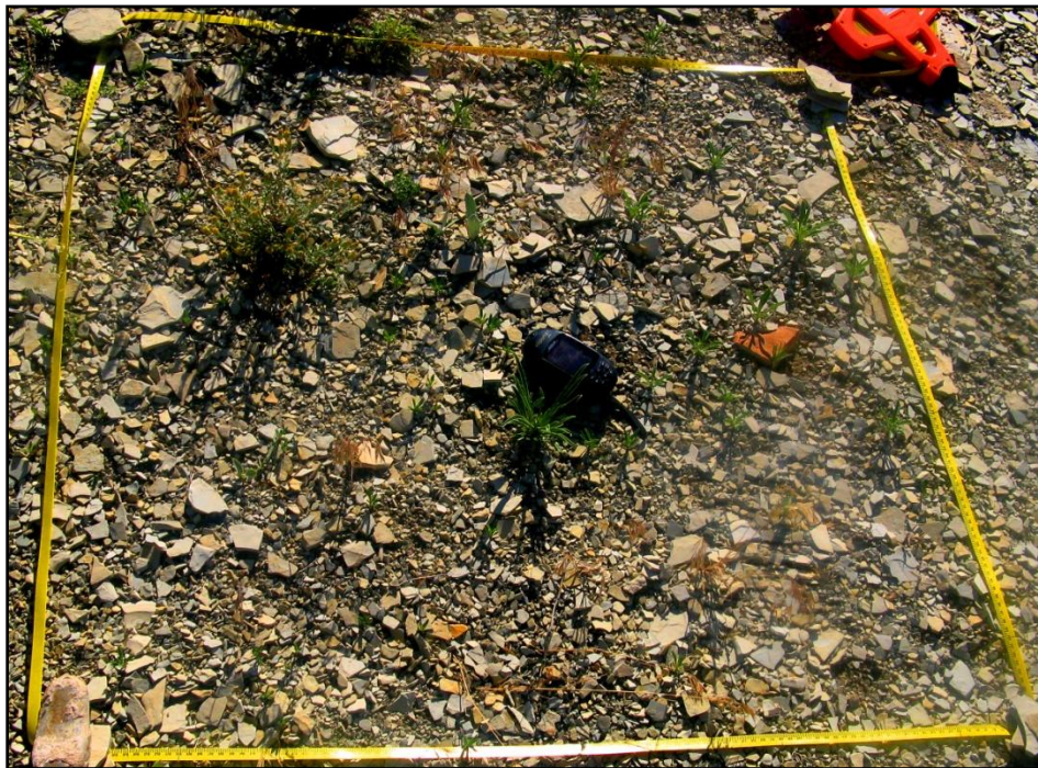
Figure 2. Seedling plot at White River site.