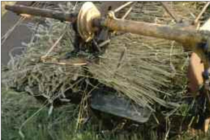
Binding wheat sheaves, Belclare / Gleás Ceangail, Béal Chláir

It should also be possible to return to the use of locally grown straw as a common thatching material. Such a strategy would bring to the fore issues surrounding the growing of high quality straws and their proper harvesting and storage to provide a sufficient supply of a long lasting, high quality product. This would, among other indirect positive consequences, increase the biodiversity of the rural environment. The introduction of biodiversity schemes to encourage the provision of straw for thatching would at the same time increase the number of natural habitats, thereby encouraging a rich variety of wildlife. This is but one example of a thatch conservation strategy that would help to promote a diversity that is local in origin and carbon footprint appropriate. The compulsory tillage scheme introduced by the Irish government in 1939 was successful in ensuring crop self-sufficiency in a time of crisis. The impact of global warming is without doubt a crisis on a much bigger scale and the former tillage scheme could be used as model for a voluntary, carbon footprint appropriate, state sponsored initiative to ensure the future diversity of thatching materials and methods.