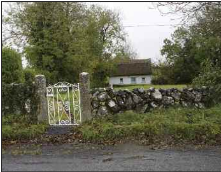
Kinvara area / Ceantar Chinn Mhara