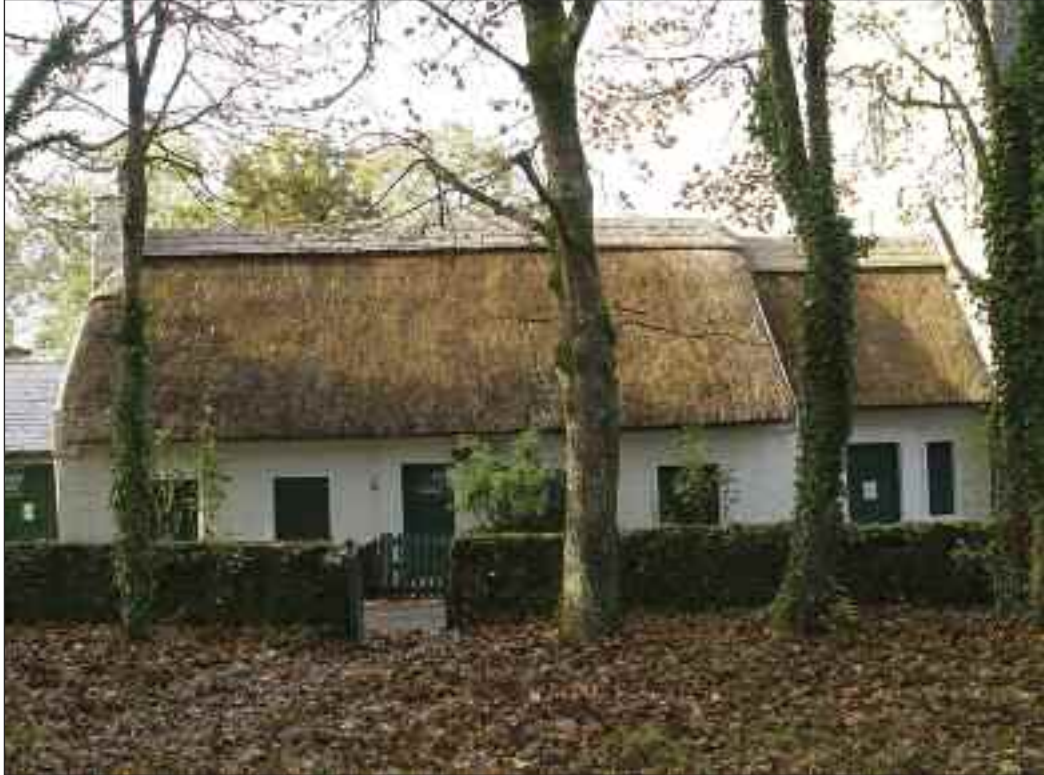
Thatched house at Thoor Ballylee / Teach ceann túí ag Túr Bhaile Uí Laoigh