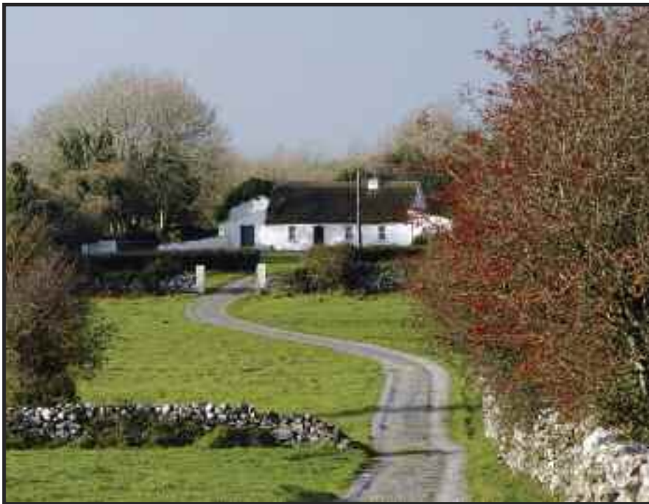
Corrandulla area / Ceantar Chor an Dola