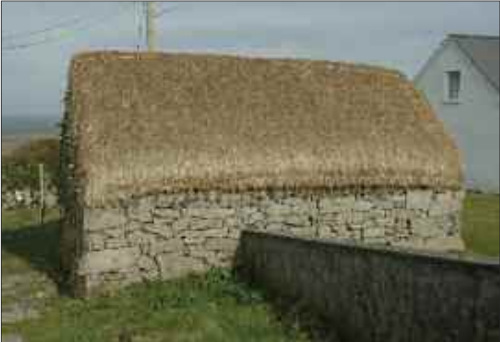
Rope thatched outbuildings, Aran Islands / Sciobóil agus tuíodóireacht le rópaí orthu, Oileáin Árann