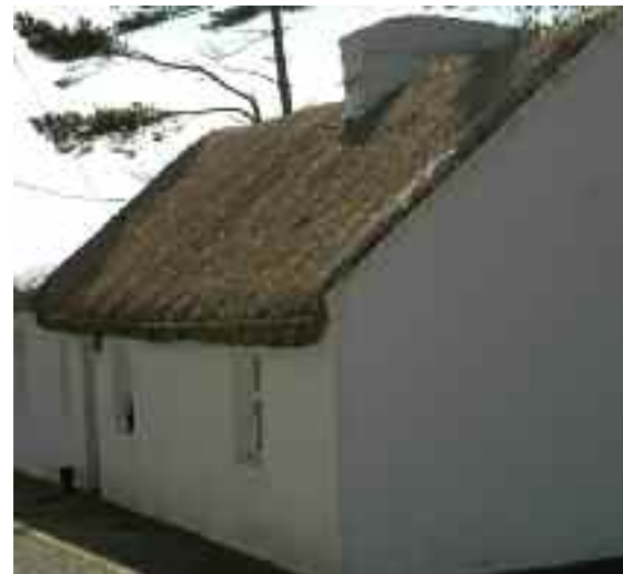
Grass roof, near Clifden / Díon fiontarnaigh, in aice leis an gClochán

Currently, thatched roofs with a covering of fiontarnach or rushes are found in association with roped and pegged thatch. This also appears to be the case historically although two descriptions, one from 1934, 8 the other from 1938, 9 mention another type of sedge, fiadhtail , used with scollop thatching as opposed to roped or pegged thatch. During the recent survey, very fine reed thatched roofs were noted where the reed was sourced from local marshes, rivers and lakes. It would appear that water reed was not very much in use as a thatching material in Co. Galway in the 1940s and it only began to be used on a significant scale from the 1970s onwards. 10