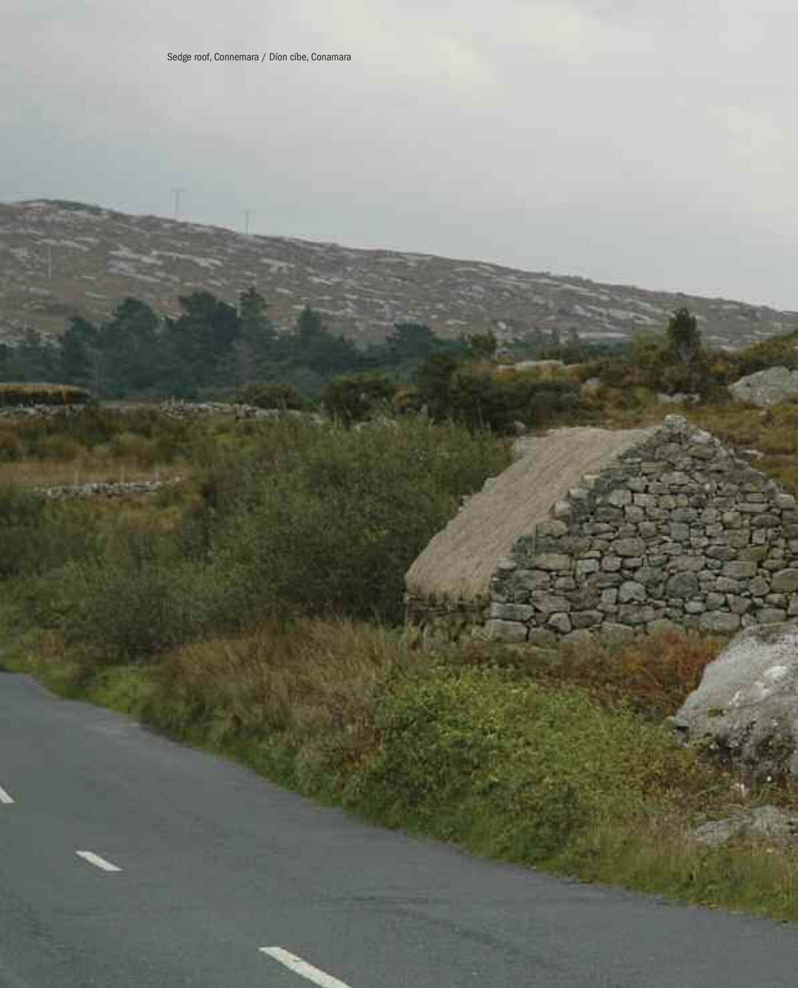
Sedge roof, Connemara / Díon cíbe, Conamara