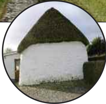
Hip roof, Cloonboo / Díon gabhail éadain, Cluain Bú