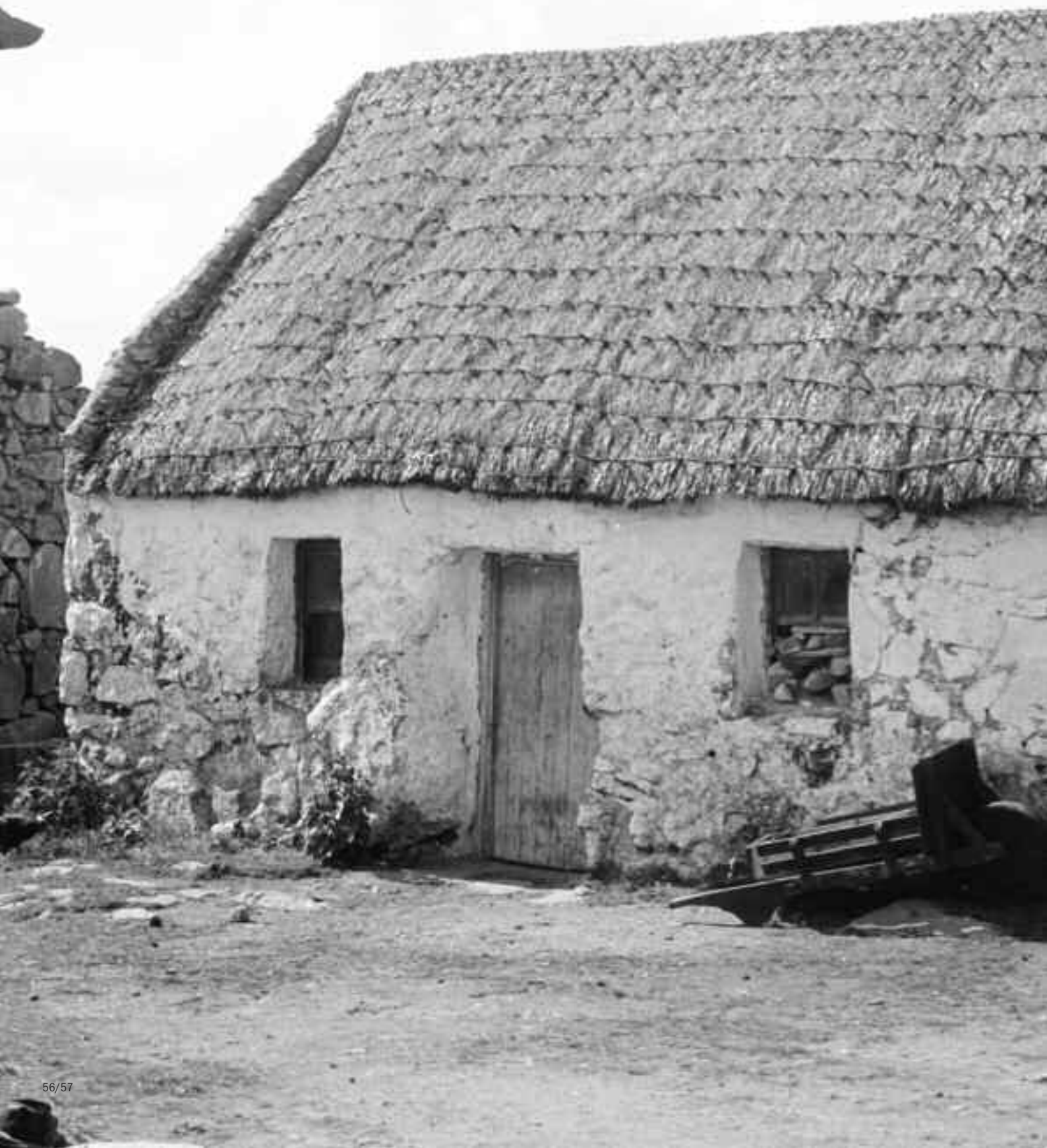
Pegged thatch / Tuíodóireacht phionnáilte, An Cheathrú Rua (1958)