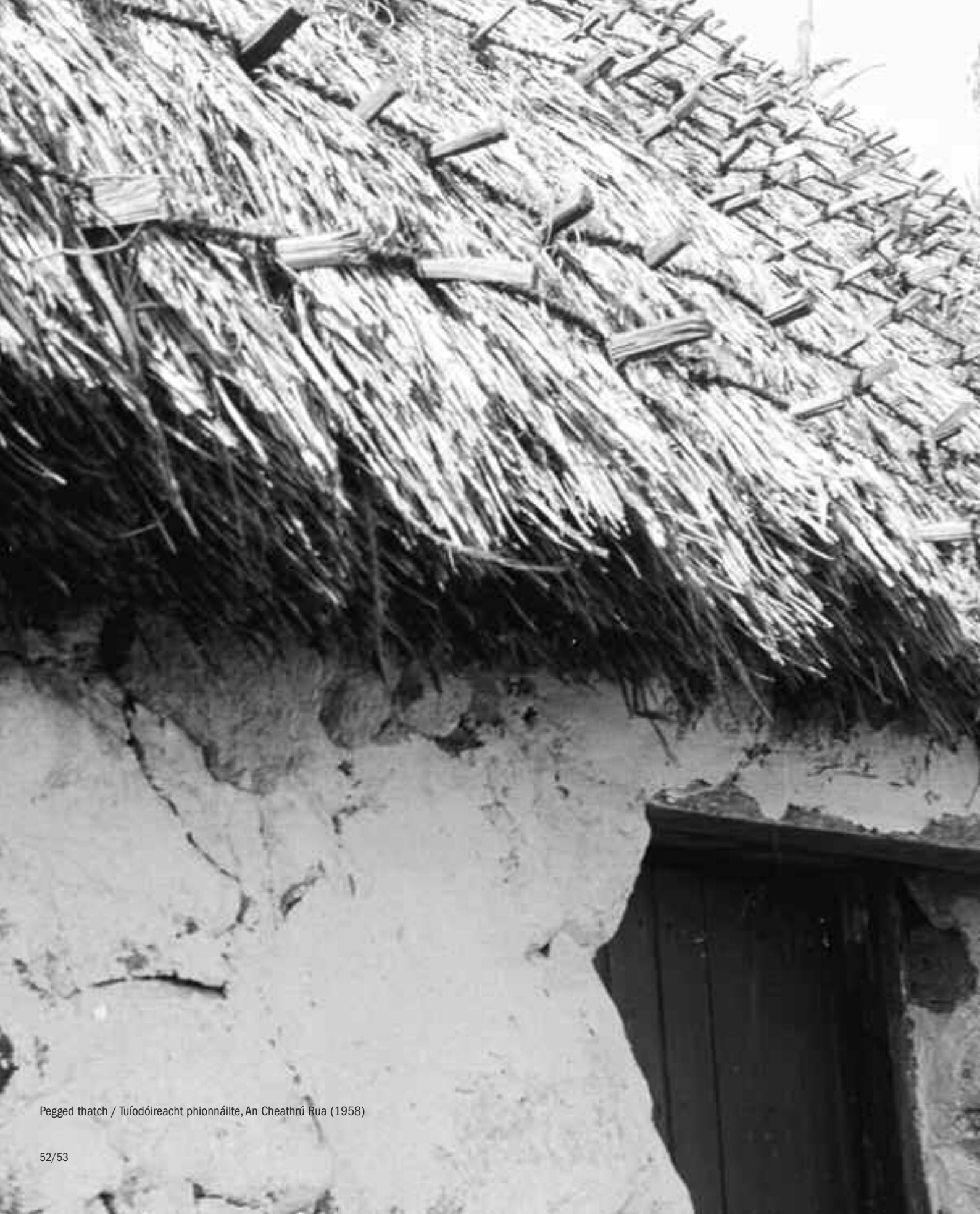
Pegged thatch / Tuíodóireacht phionnáilte, An Cheathrú Rua (1958)