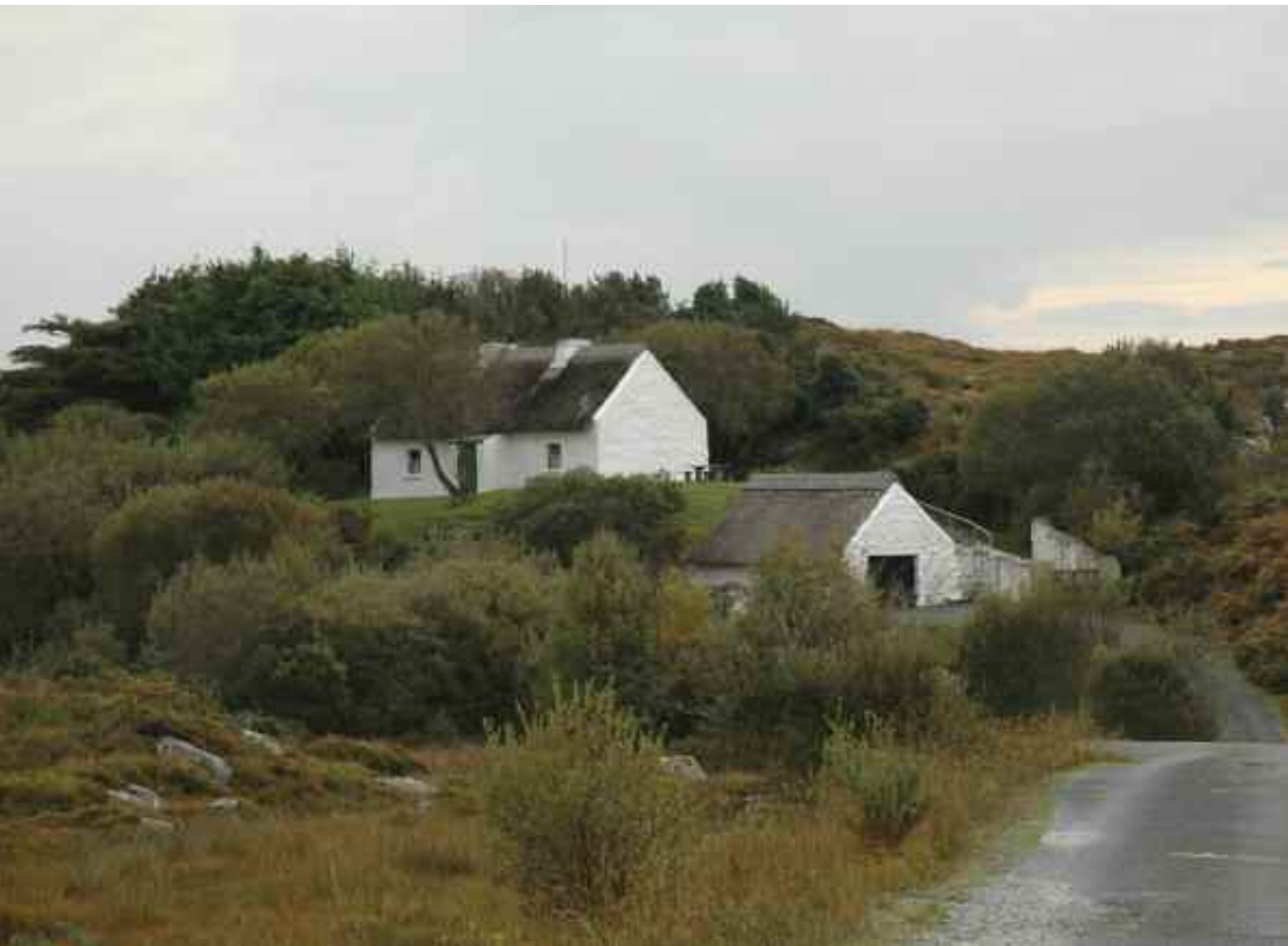
Pearse's house, Ros Muc / Teach an Phiarsaigh, Ros Muc