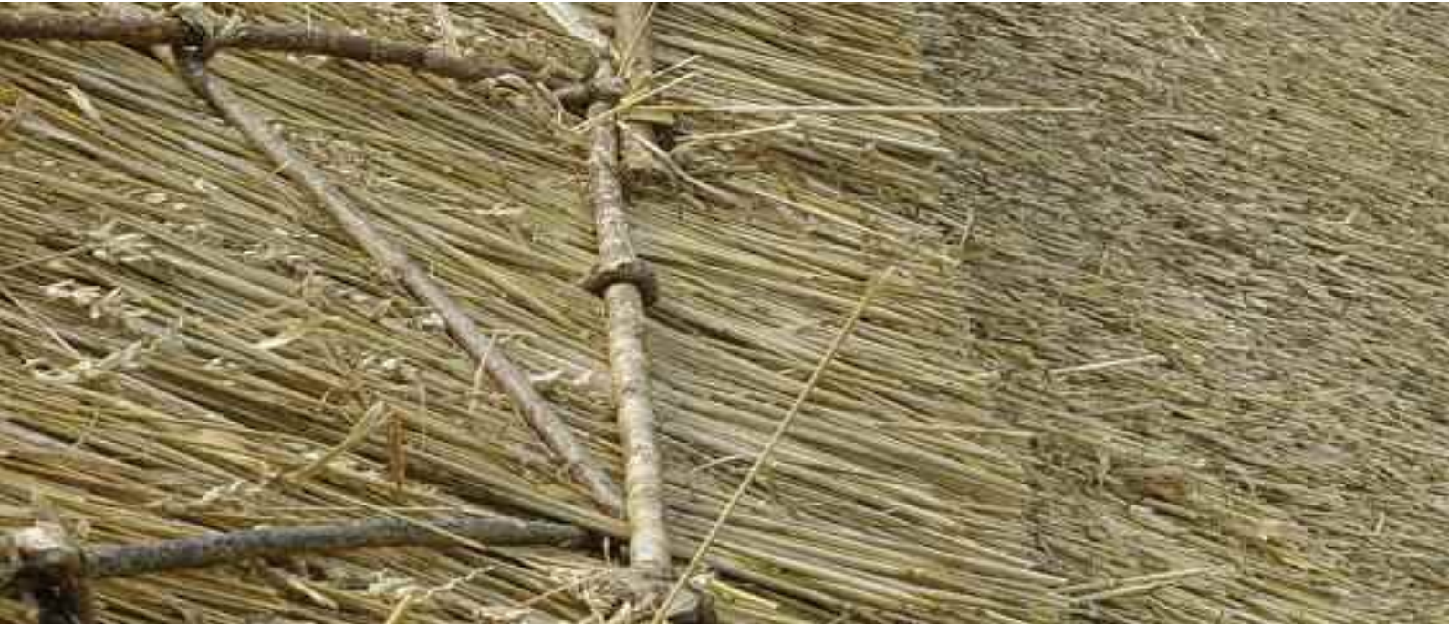
Wheat straw scollop thatch, Tuam area / Tuíodóireacht le scoilb agus tuí chruithneachta, Ceantar Thuama