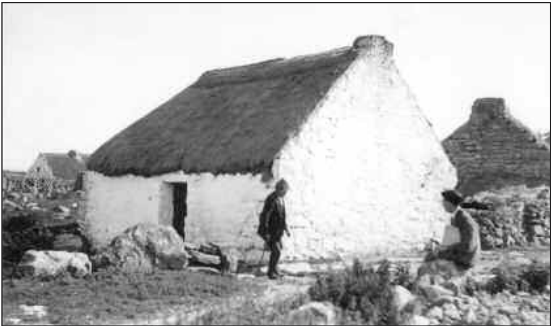
Stone gables / Beanna cloiche, Cois Fharráige (1935)