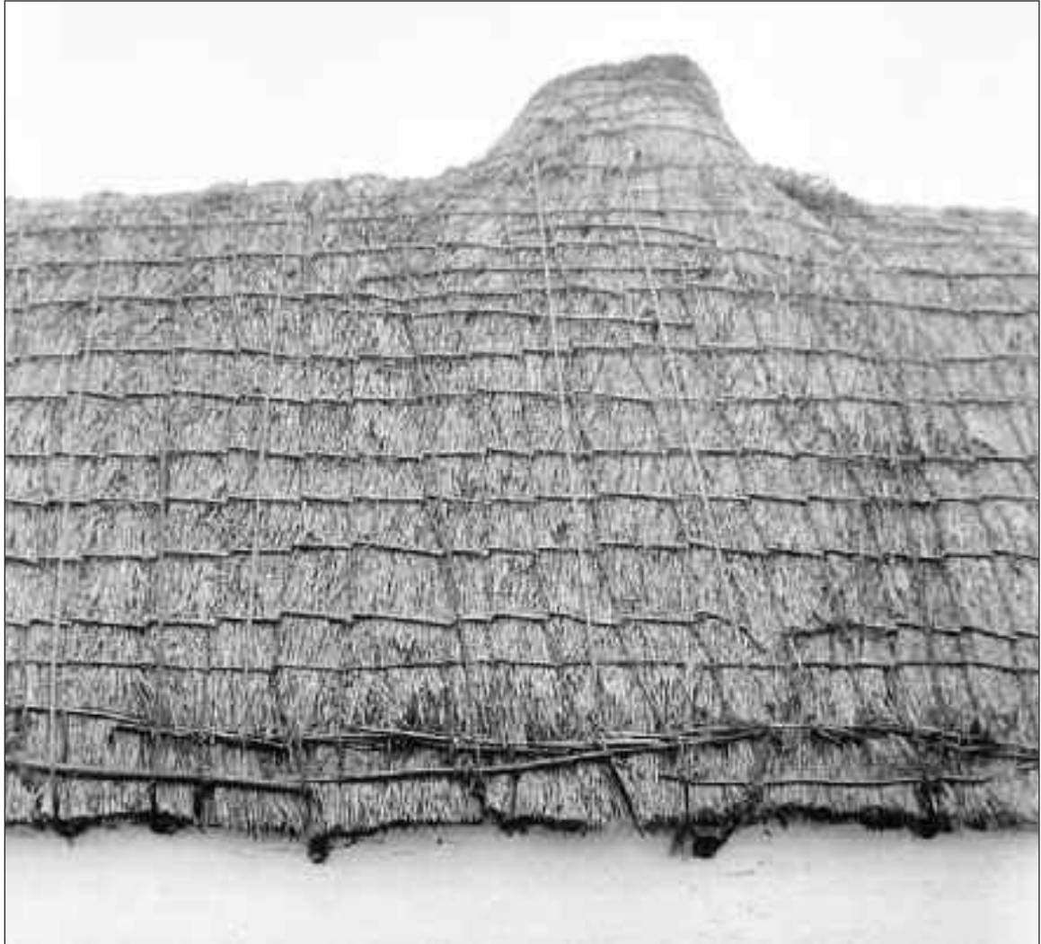
Thatched chimney and roof tied down with ropes, Teernakill / Simléar le tuí agus d'ón ceann tuí ceangailte síos le rópaí, Tír na Cille, An Mám (1935)