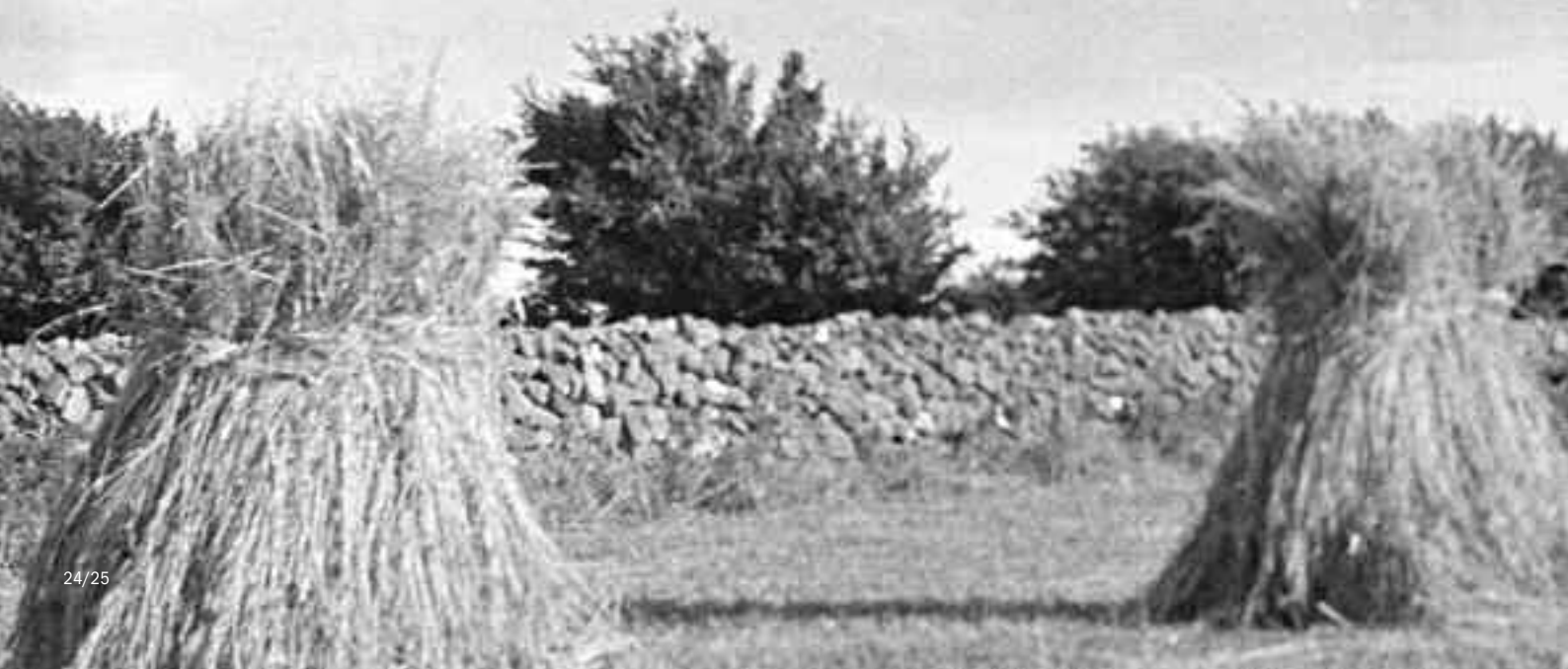
Stooks of corn / Stucaí arbhair (1946)

The thatched roof directly reflects the cultivation practices, or indeed their absence, in the local farming economy. Just as the farmland consisted of a patchwork of colours, textures and patterns, thatched roofs too reflected this diversity. Indeed, the most striking aspect of the responses to the IFC questionnaires was the variety described in the materials used for thatching. The rich biodiversity of natural and farmed landscapes provided roofing materials of wild and cultivated materials such as rye, wheat, oat and barley straw from the farmland, rushes from the poorly drained fields, heather from the bogs, and wild grasses from the mountains and sand dunes.