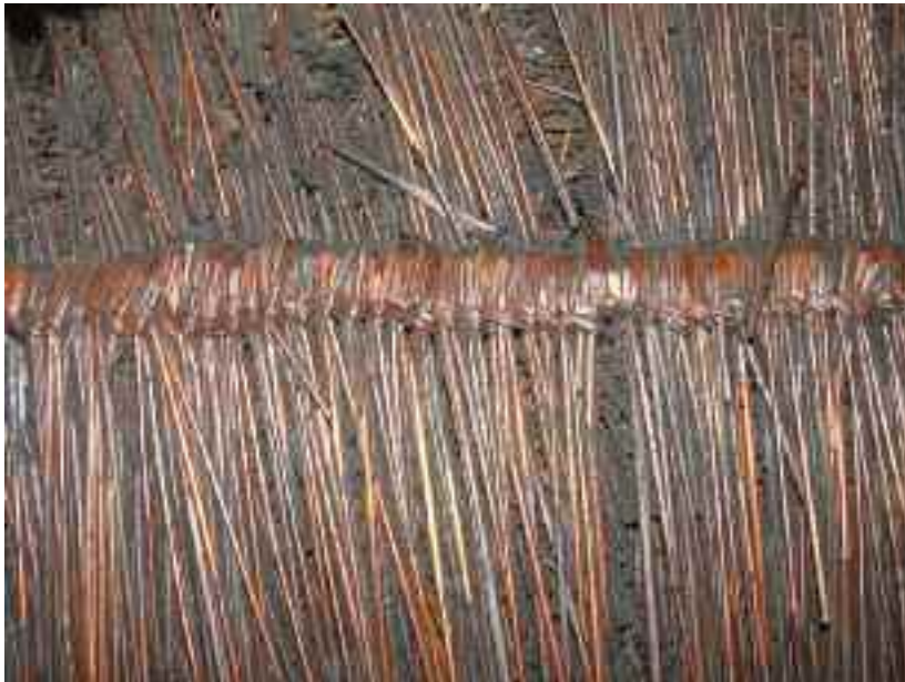
Straw lining, Ardrahan / Líneáil tuí, Ard Raithin