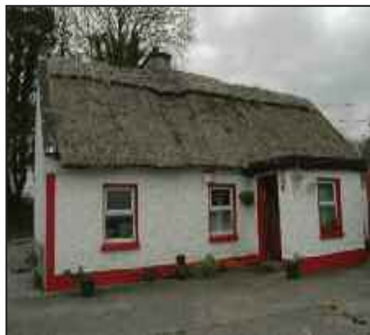
Hidden scollop thatching with reed changed to thrust thatch with straw, Killimor

The distribution map of thatching methods, drawn up in 1945, shows that the thrust thatch method was found, at that time, only at a considerable distance from Co. Galway, in an area extending throughout most of Leinster and some parts of east Ulster. However, three examples of thrust thatch, without ropes, were located during the recent inventory of thatched structures in Co. Galway and all examples were located close to each other in the east of the county, in the Tynagh district. In 2006, this method was also noted on a roof at Meelick under a layer of scollop thatch, and the thrust method was recently employed to replace the outer reed layer of scollop thatch at Killimor. However, its most interesting distribution may be the one where it is found tied down with a network of ropes.