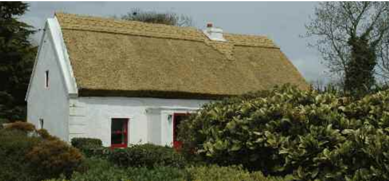
Hidden scollop reed thatch, Inishmicatreer / Tuíodóireacht le scoilb i bhfolach, Inis Mhic an Trí

Scollop or pinned thatch was identified from the IFC questionnaire replies as the most widely used method in Ireland with examples found in almost every county. It was recorded as the only method for some counties such as Limerick and Tipperary. Traditionally, wheat, oat and rye straws were employed for scollop thatching throughout the country and wild grasses or rushes were not generally found in conjunction with this method. Reed appears to have been used more recently as a material for scollop thatching in areas adjacent to estuaries, rivers and lakes such as the Shannon Estuary, and the Blackwater and Suir rivers. In Co. Galway, reed was harvested for thatching, predominantly in the 1960s and 1970s, from a number of places, including Lough Corrib.