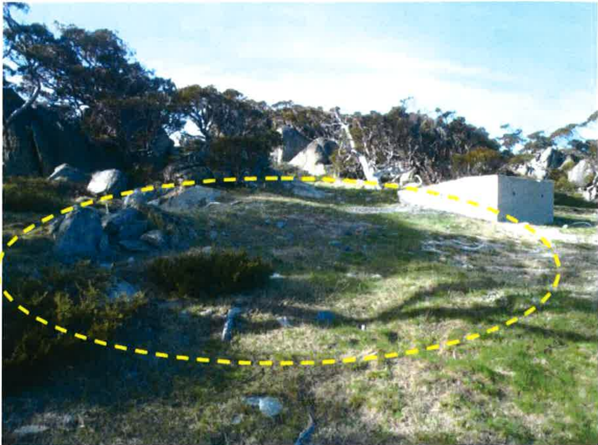
Photo 3: The proposal includes the planting of trees and heath on the edge of the clearing approximately 35 m to the east of the study area.