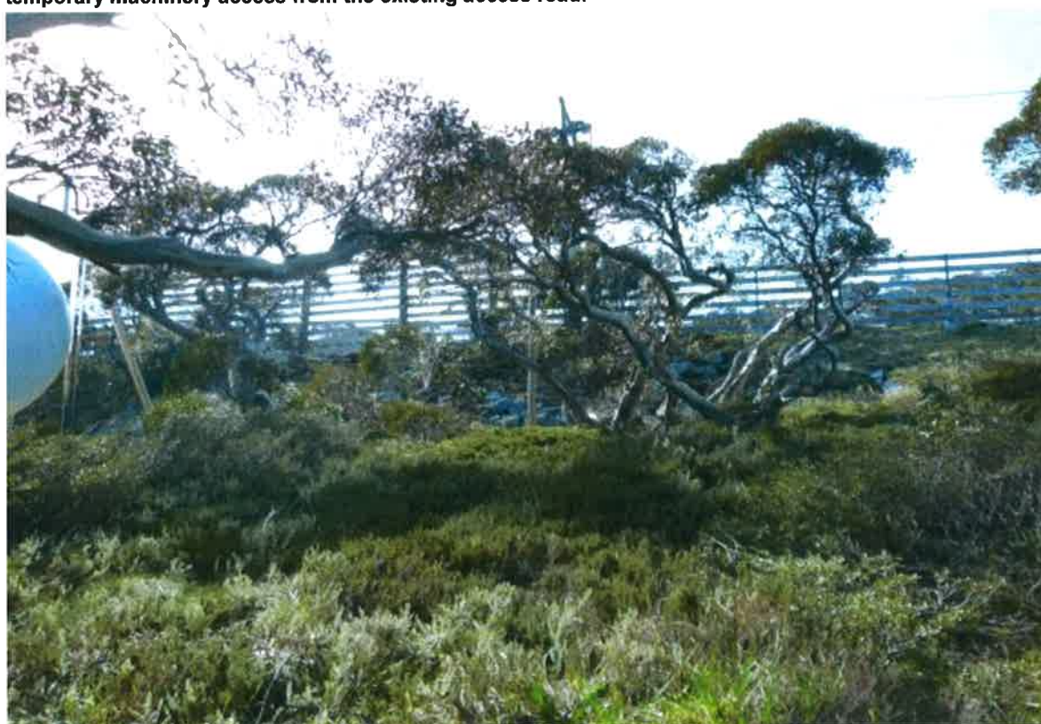
Photo 2: The proposal will require the removal of three small Snow Gums and some heath.