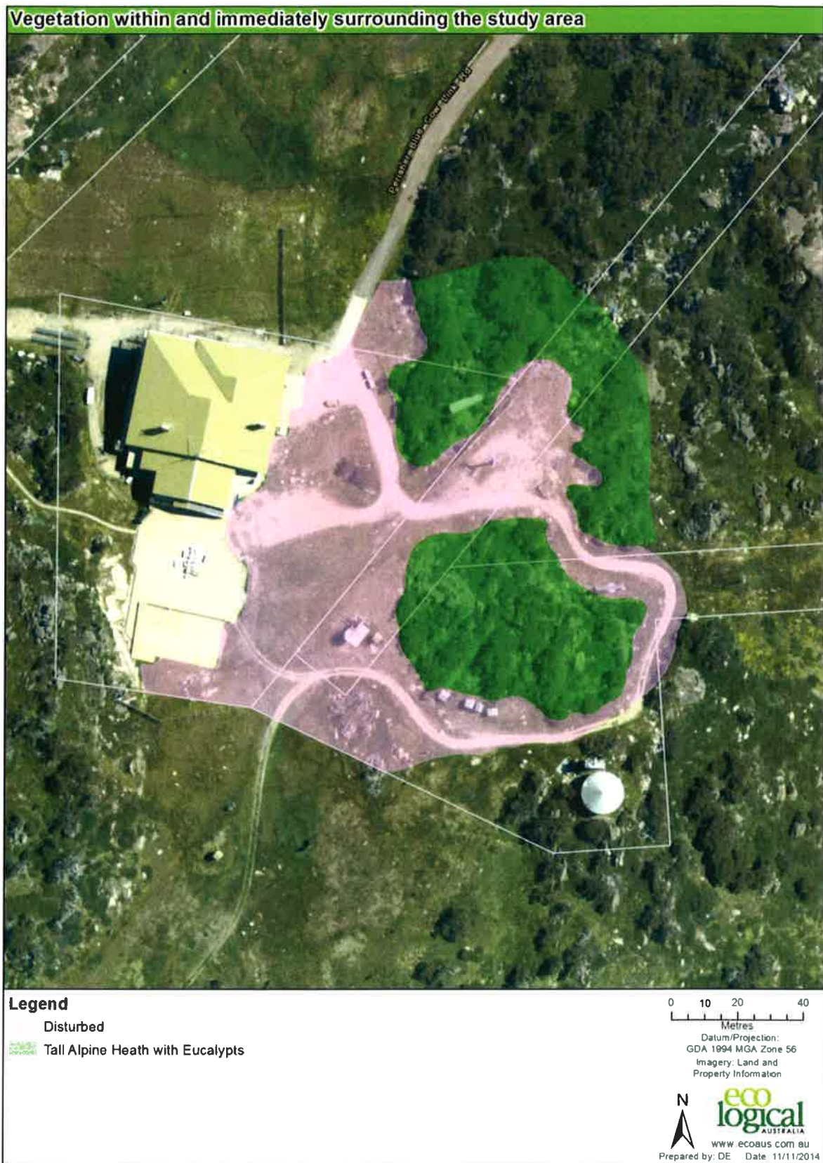
Figure 2: Vegetation within and immediately surrounding the study area.