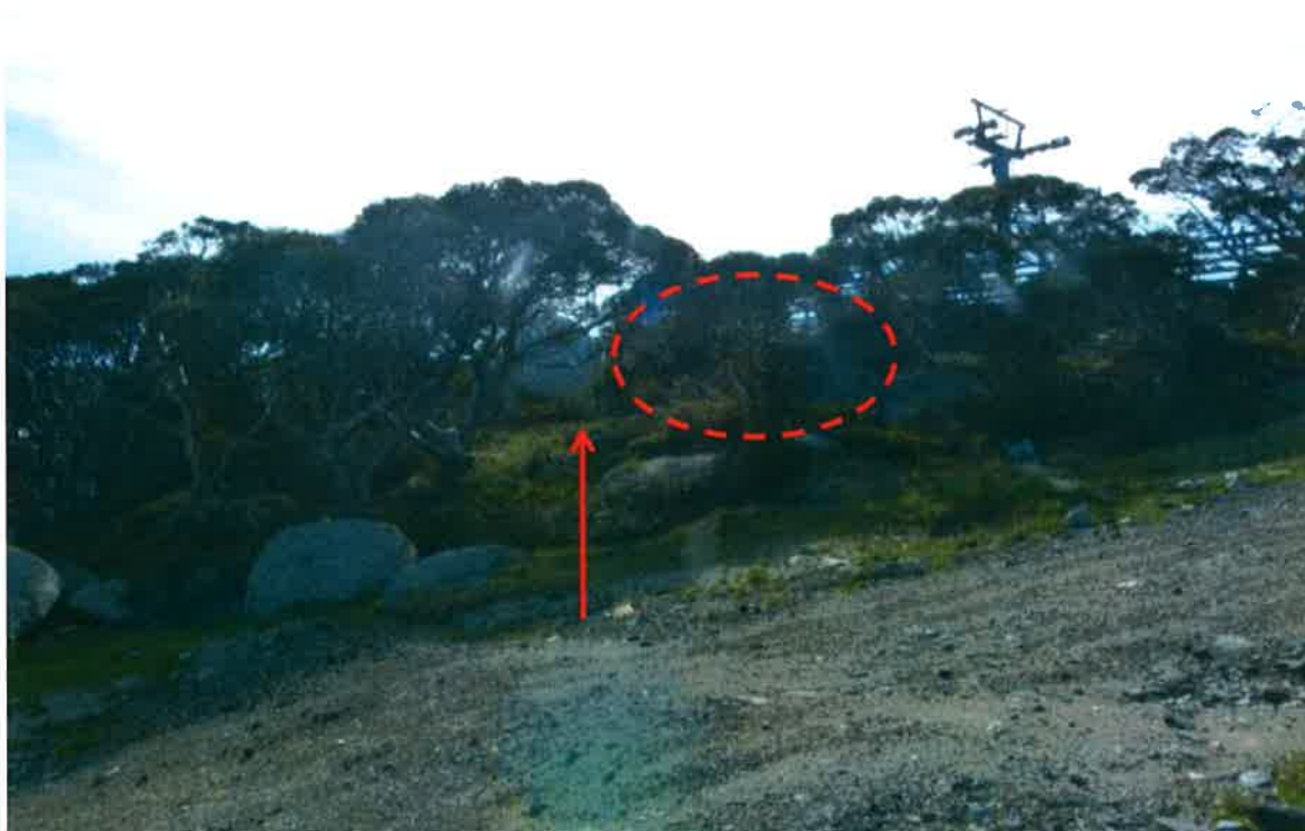
Photo 1: The gas tank will be installed immediately adjacent to the existing gas tank and will require temporary machinery access from the existing access road.