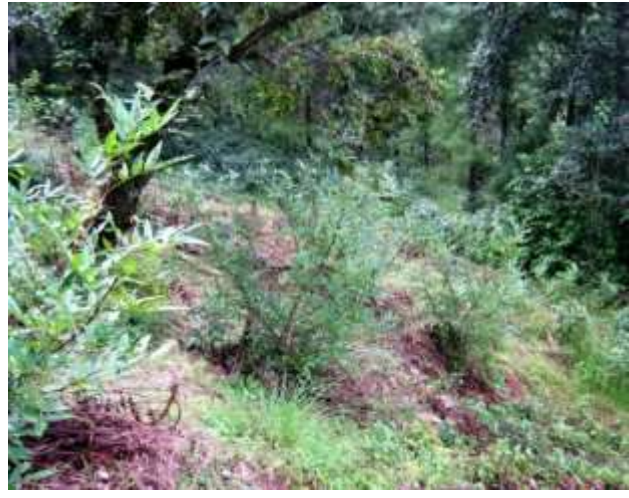
Timur plants in wild haitat