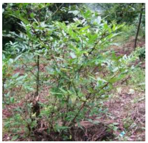
Timur Plant 3 years' old