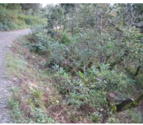
Timur plants at road sides