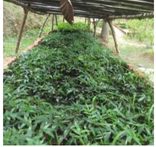
Timur seedling ready for plantation