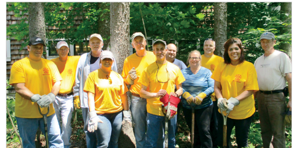
Church & Dwight employees volunteer at the Johnson Education Center