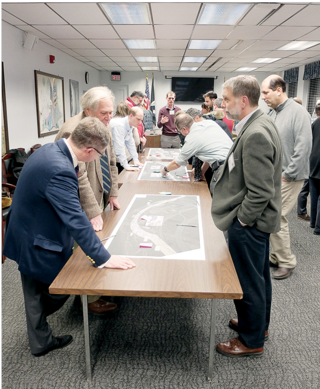
Bicycle planners and enthusiasts reconnecting the D&R Canal path and Circuit