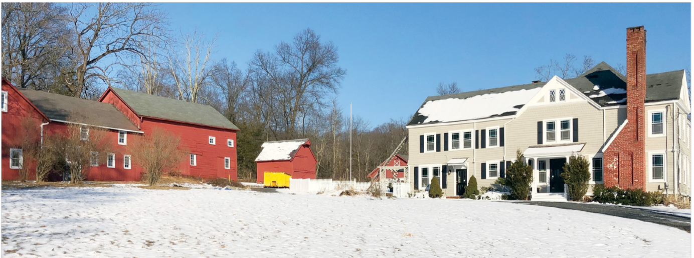
Wemple estate home and barns, ca. 1885, will remain privately owned, surrounded by the preserved historic land.