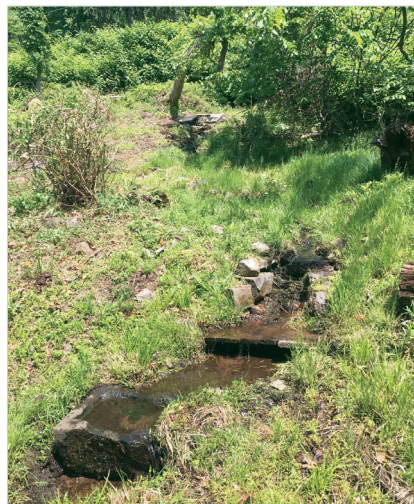
Channel and horse drinking trough on Revolutionary land.