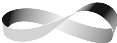
Figure 1. Mobius strip.