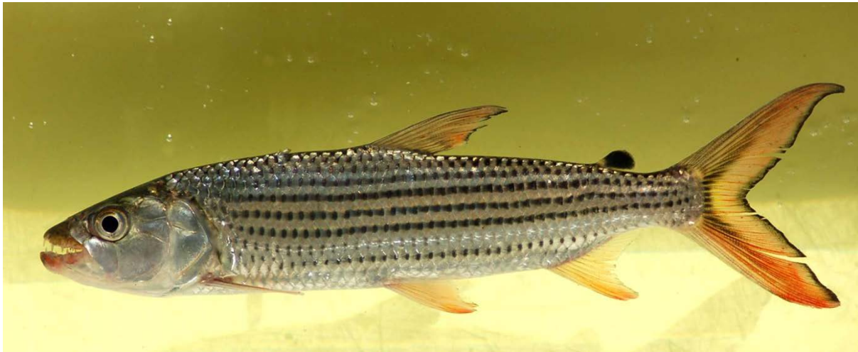
Figure 3: The tigerfish, Hydrocynus vittatus .

and social value to South Africans. Although valuable, very little is known about the biology and environmental requirements of this charismatic species. As a result of its ecological and economic importance the tigerfish has been the focal point of five different research projects undertaken by my research group over the past 10 years.