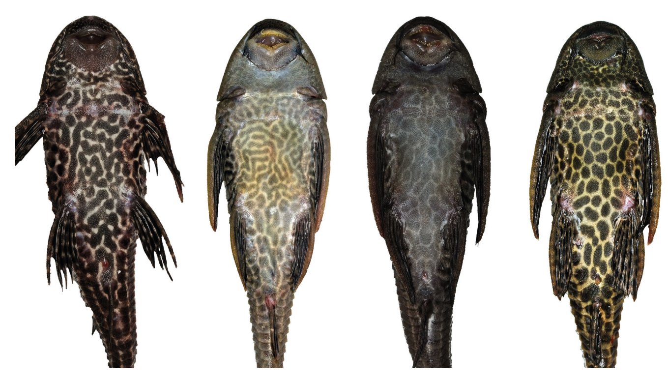
Fig. 2. Variations in ventral colour patterns of Pterygoplichthys spp. in the River Dinh.

consists of four species: P. multiradiatus (Hancock 1828), P. pardalis (Castelnau 1855), P. ambrosettii (Holmberg 1893) (syn. P. anisitsi sensu Ferraris, 2007) and P. disjunctivus (Weber 1991). Members of this species complex are currently spreading throughout the world. Apart from their range, these species differ only in their colour patterns (Armbruster and Page, 2006). However, there is high variability in colouration, and some variants do not correspond to any of the species. This can be explained either by interspecific hybridisation or by the assumption that at least some members of the P. multiradiatus group are not actually valid species (Zworykin and Budaev, 2013; Wei et al., 2017). However, neither suggestion is currently conclusively confirmed, and therefore it is not possible to determine the species' identity in this group, and especially so outside their natural range. Accordingly, like several other authors in recent years (e.g. Wei et al., 2017; Stolbunov, Dien, and Armbruster, 2020; Seshagiri et al., 2021), in the present study the "open nomenclature" Pterygoplichthys spp. is used to refer to these fishes (Fig. 2).