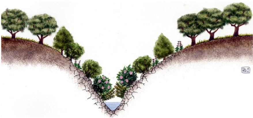
Figure 3. Vegetation catena in gorges on Palaeozoic slate in the Sierra Morena with a predominance of Juniperus oxycedrus subsp. lagunae , contacting towards the upper areas with forests of Fagaceae.

The formations of Juniperus oxycedrus subsp. lagunae in the easternmost territories of the Iberian Peninsula (Portugal) appear in small mountain ranges with a quartzite character and frequent mesophytic flora, as although the thermotype continues to be mesomediterranean, the ombrotype is subhumid-humid. There is thus a strong floristic component with an oceanic character such as Erica arborea , Viburnum tinus and Cytisus eriocarpus .