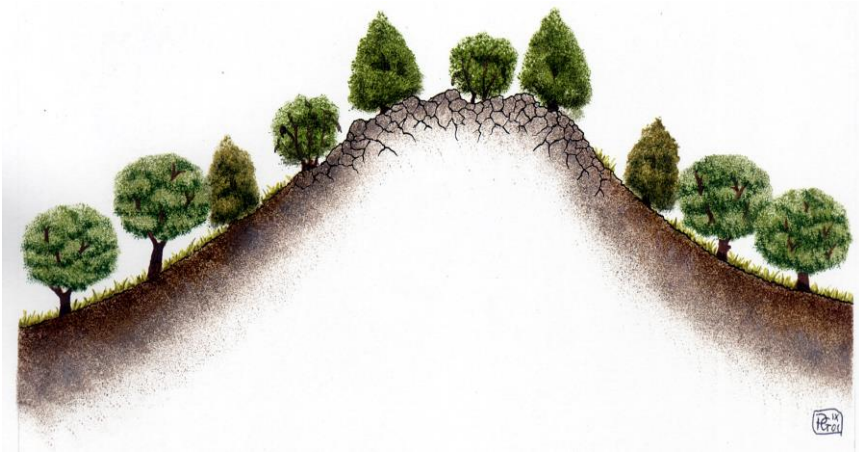
Figure 2. Vegetation catena with a quartzite rock field and a predominance of Juniperus oxycedrus subsp. lagunae , contacting towards the lower areas with forests of Fagaceae.