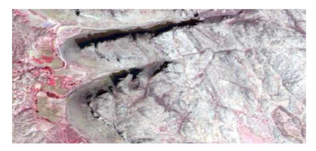
Fig.7 Shadow used for identifying topography in imagery

1. Shadow: It is useful in interpretation as it may provide an idea of the profile and relative height of a target or targets which may make identification easier. However, shadows can also reduce or eliminate interpretation in their area of influence, since targets within shadows are much less (or not at all) discernible from their surroundings. Shadow is also useful for enhancing or identifying topography and landforms (figure 7).