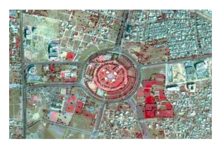
Fig.3: Size as parameter for visual interpretation

used in judging the significance of objects and features (size of trees related to board feet which may be cut; size of agricultural fields related to water use in arid areas, or amount of fertilizers used; size of runways gives an indication of the types of aircraft that can be accommodated) as shown in figure 3. It is important to assess the size of a target relative to other objects in a scene, as well as the absolute size, to aid in the interpretation of that target.