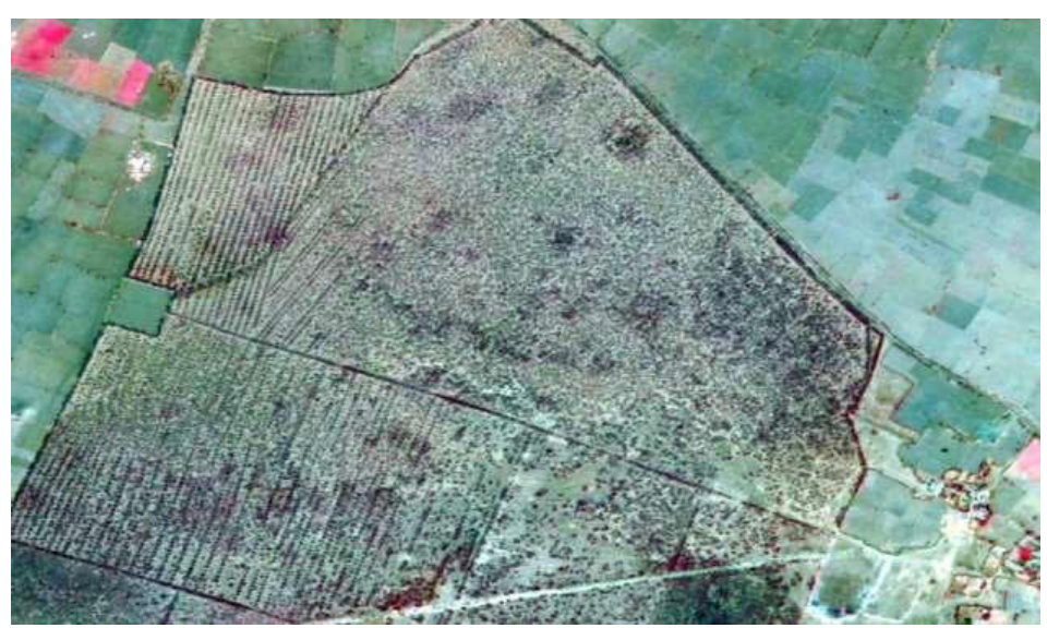
Fig.5: Textural variations

3. Texture: It refers to the arrangement and frequency of tonal variation in particular areas of an image. The visual impression of smoothness or roughness of an area can often be a valuable clue in image interpretation. Rough textures would consist of a mottled tone where the grey levels change abruptly in a small area, whereas smooth textures would have very little tonal variation as shown in figure 5. Smooth textures are most often the result of uniform, even surfaces, such as fields, asphalt, or grasslands. A target with a rough surface and irregular structure, such as a forest canopy, results in a rough textured appearance. Similarly, various density of scrub vegetation shows different texture. Uniform fields of crops, water bodies etc gives smooth texture.