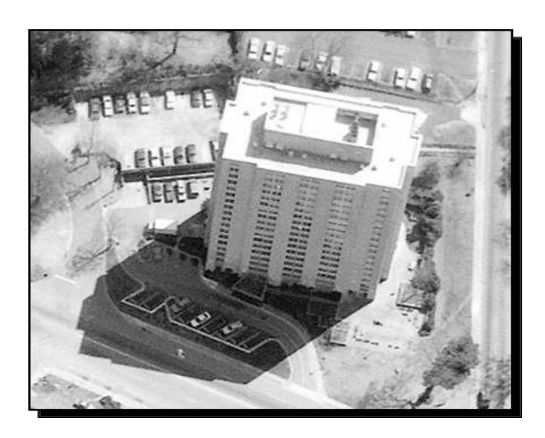
Fig.9 High rise buildings with parking arrangements