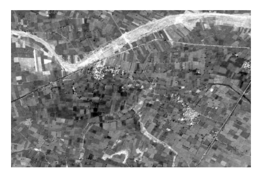
Fig.2: Tonal variations

Many factors influence the tone or colour of objects or features recorded on photographic emulsions. Human interpreter can distinguish between ten to twenty shades of grey, but can distinguish many more colours (figure 2). Some authors state that interpreters can distinguish at least 100 times more variations of colour on colour photography than shades of gray on black and white photography.