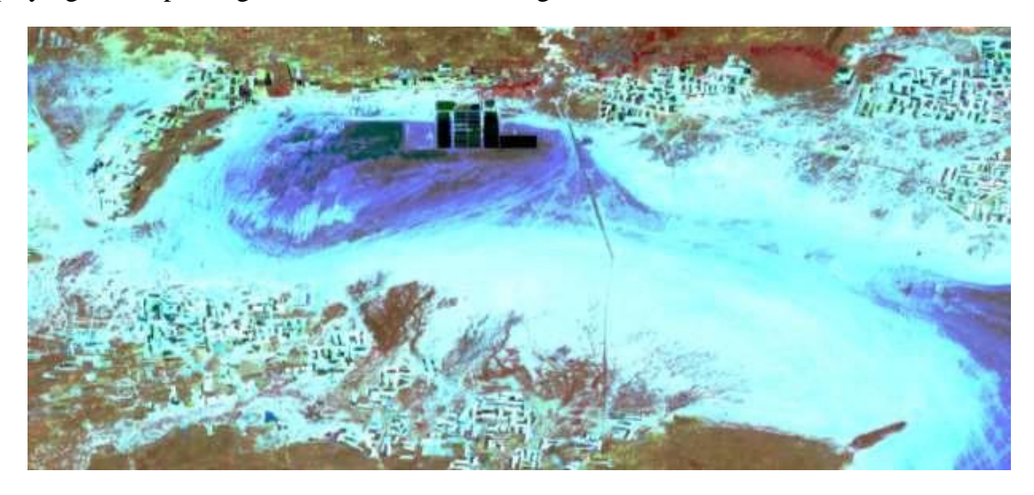
Fig.8 salt patches and salt production unit

3. Association: It takes into account the relationship between other recognizable objects or features in proximity to the target of interest. The identification of features that one would expect to associate with other features may provide information to facilitate identification. Some objects are so commonly associated with one another that identification of one tends to indicate or confirm the existence of another. Smoke stacks, step buildings, cooling ponds, transformer yards, coal piles, railroad tracks = coal fired power plant. Arid terrain, basin bottom location, highly reflective surface, sparse vegetation = playa. water body surrounded by salt pond and saline patches = salt production units (figure 8). Association is one of the most helpful clues in identifying man made installations. Aluminium manufacture requires large amounts of electrical energy. Absence of a power supply may rule out this industry. Cement plants have rotary kilns. Schools at different levels typically have characteristic playing fields, parking lot and cluster of building in urban area