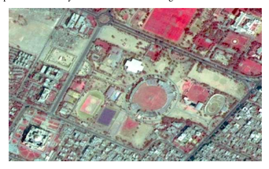
Fig.4: Shape as parameter for visual interpretation

2. Shape - Shape refers to the general form, structure, or outline of individual objects. Shape can be a very distinctive clue for interpretation. Straight edge shapes typically represent urban or agricultural (field) targets, while natural features, such as forest edges, are generally more irregular in shape, except where man has created a road or clear cuts. Similarly, roads can have right angle turns, rail lines do not. play grounds, large buildings, parks etc. have specific shapes and can easily be identified shown in figure 4.