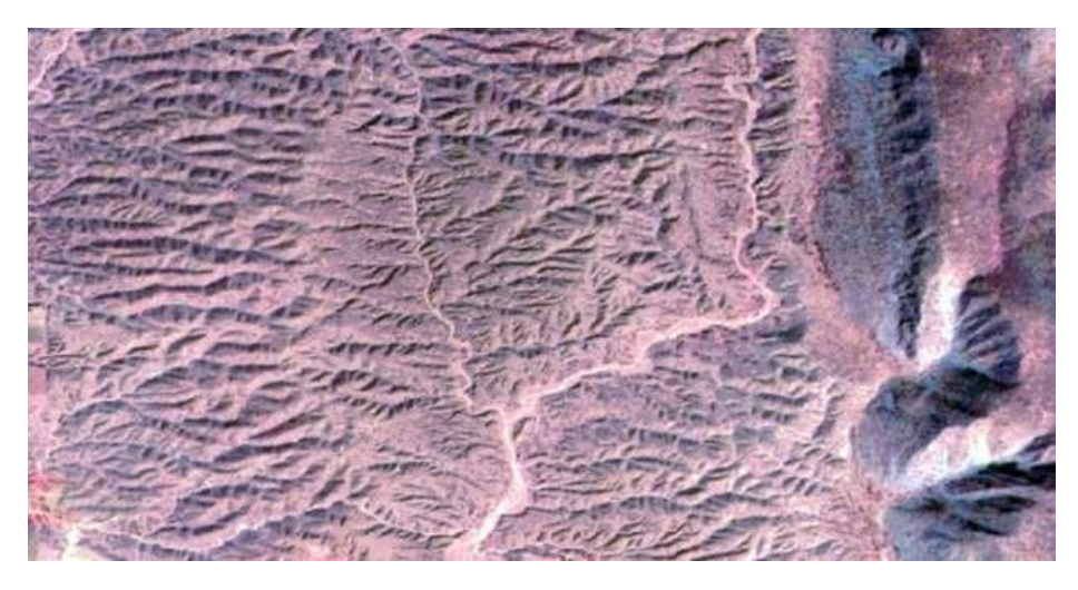
Fig.6: Pattern variations