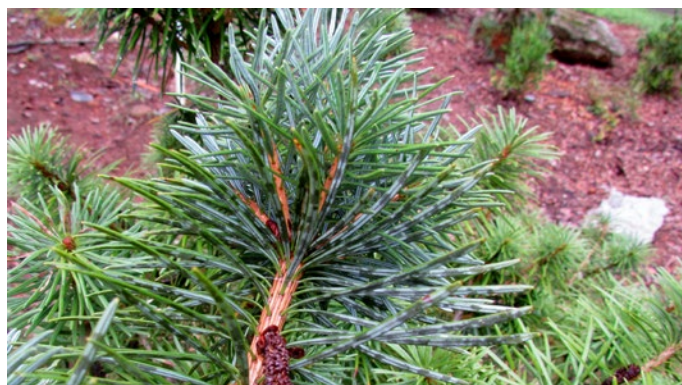
Cathaya argyrophylla from China, showing the abaxial side of the leaf