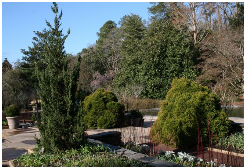
Sarah P. Duke Gardens