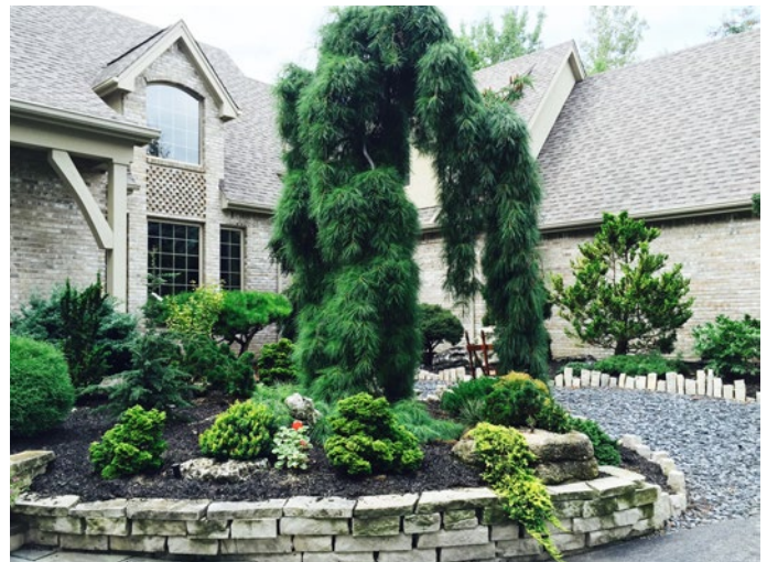
Pinus strobus 'Niagara Falls'