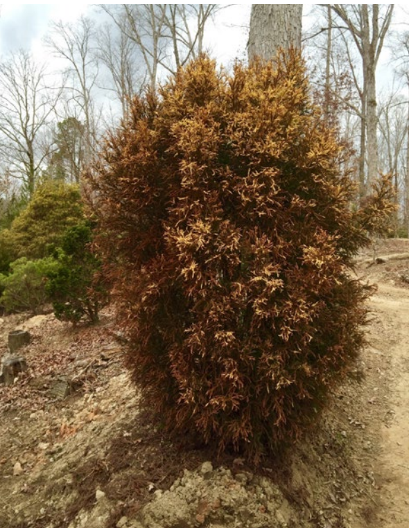
'Knaptonensis' in Winter