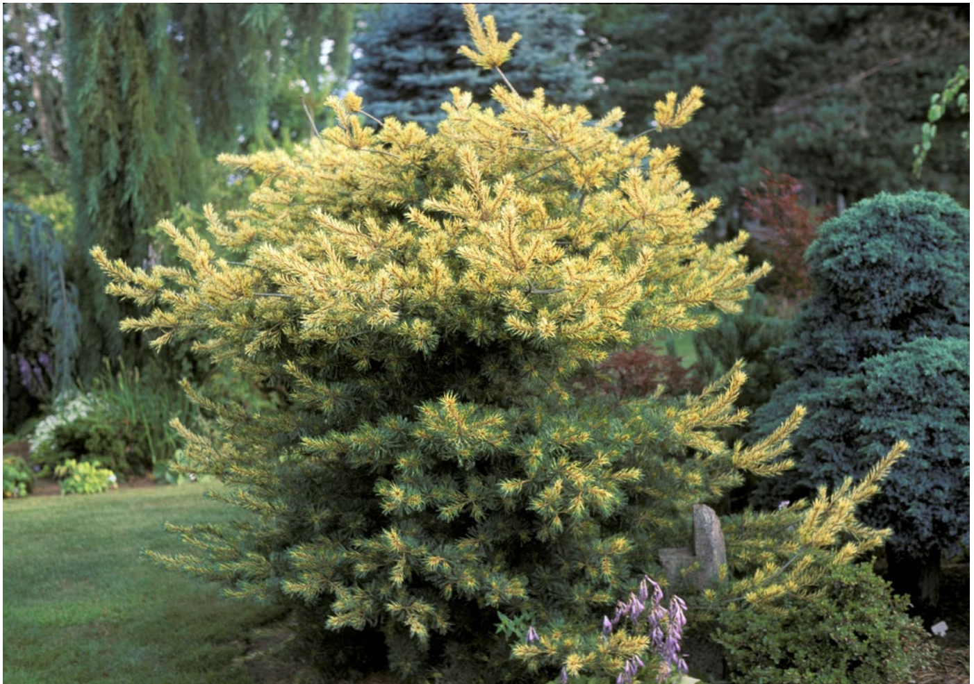
Pinus parviflora 'Ogon-Janome'