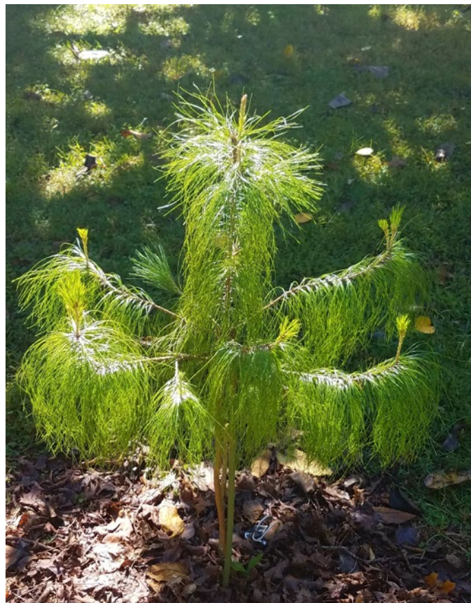
Pinus lumholtzii from Mexico

Several factors contribute to this with the first being that we receive, on average, 55 inches of rain per year, and the rain is distributed throughout each month. The US average is 37. The second factor is no temperature extremes on either side of the dial. While it can get hot, more conifers than not actually benefit from summer heat and humidity. Other factors in our favor include a long hardening-off period, which enables our plants to shut down early enough to be prepared for winter. Remember, it's not how cold it gets, but how it gets cold. We have a long growing season, and even our coldest days are short lived. Some plants are able to withstand some cold as long as that cold is not long in duration.