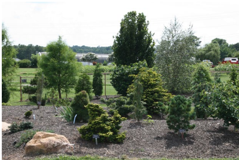
New conifer beds, June 1, 2017

A total of about 123 conifers are currently under evaluation in these conifer beds, and the JCRA currently has over 560 conifers throughout the Arboretum (go to https://jcra.ncsu.edu/horticulture/our-plants/index.php to see what we are growing), and an additional 75 or so in the nursery are waiting to be planted. The plants have grown well and are thriving, but the dwarf nature of most of the selections we had planted did nothing to obstruct the not-so-lovely view of NC State field research plots. With the help of a new grant from the Southeastern ACS, a selection of upright conifers was added along the backside of the beds to help screen the view.