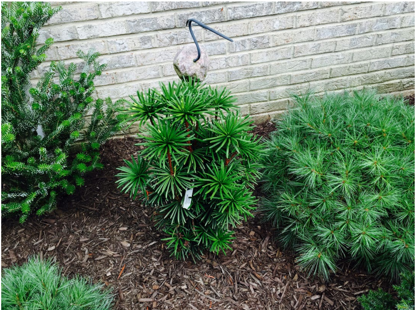
Sciadopitys verticillata , Japanese umbrella tree