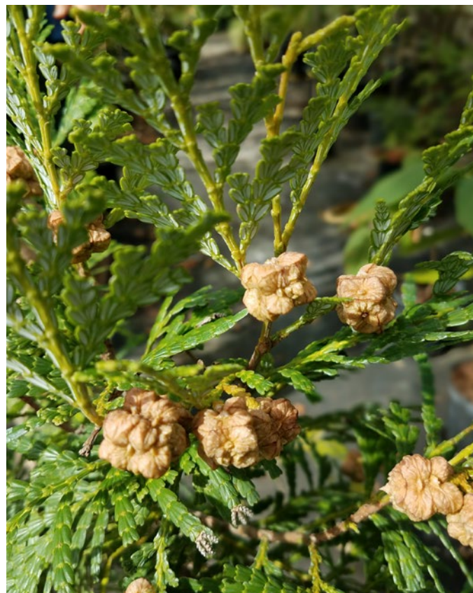
Chamaecyparis hodginsii from China and Vietnam