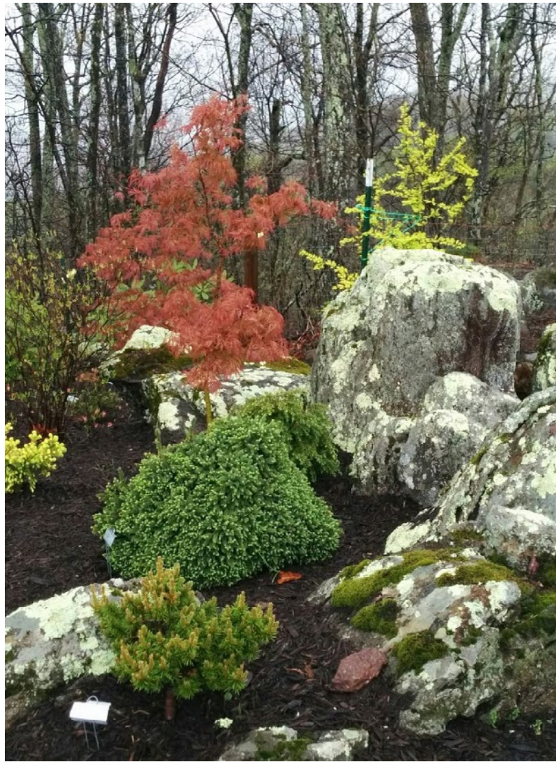
Galloway Garden

SE Region Sec./Treasure and chairs of the 2018 National Meeting