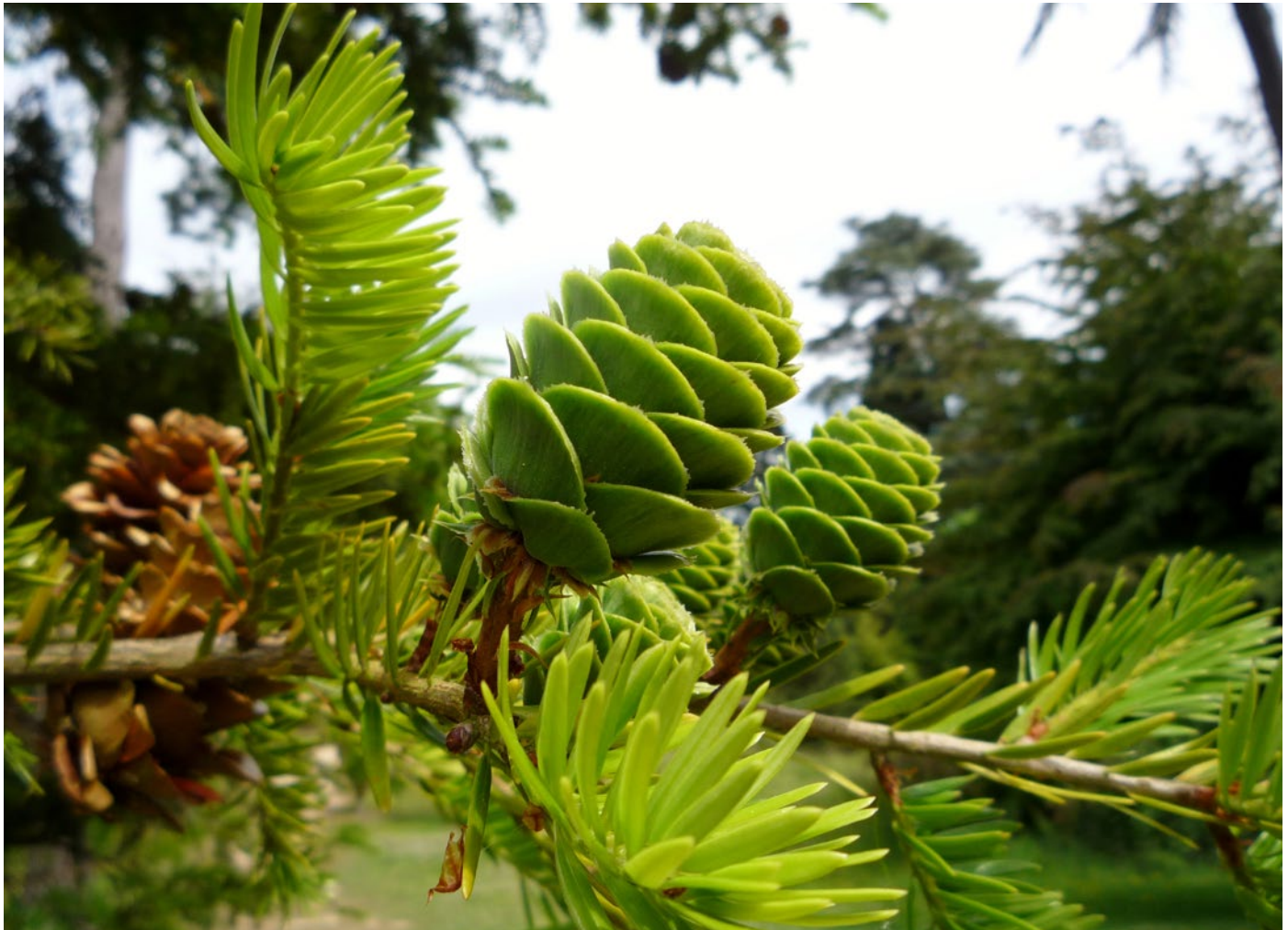
Keteleria davidiana from Taiwan and SE China

In conclusion, there are many conifer species that are of interest that have proved to be adaptable here in Zone 7b. Visitors here continue to remark about the beauty of many of these and how unusual they are. As an added bonus, we are providing a home for some of the rarest conifers on earth.