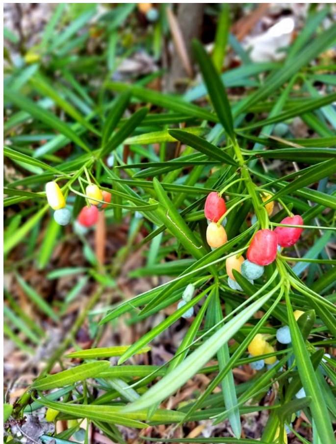
Podocarpus macrophyllus from China

Native here in the Southeast is one of the rarest conifers in the world, Torreya taxifolia . For thousands of years, it was a large evergreen tree endemic to the ravine forests along the Apalachicola River which snakes through the Florida panhandle. Somewhere around 1950, the tree suffered a catastrophic decline as all reproductive-aged trees died. In the decades to follow, the species has not recovered. What remains is a population at approximately 0.3% of its original size, in a manner reminiscent of American chestnut