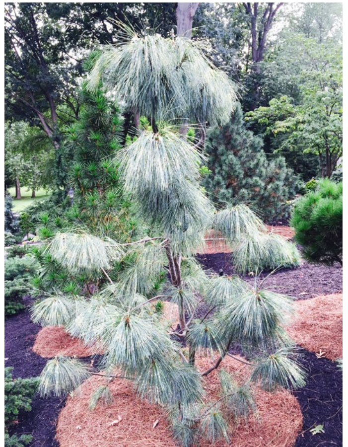
Pinus wallichiana 'Zebrina'