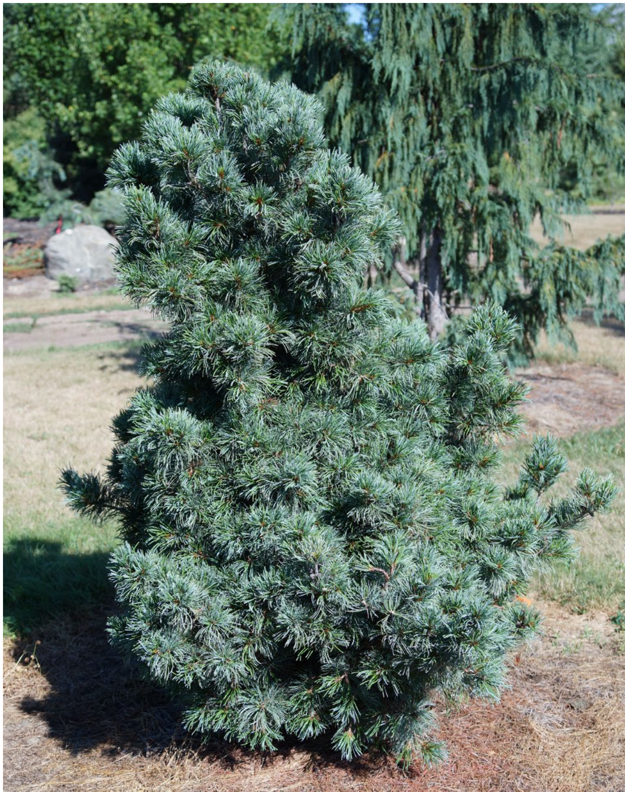
Pinus parviflora 'lbo-can'