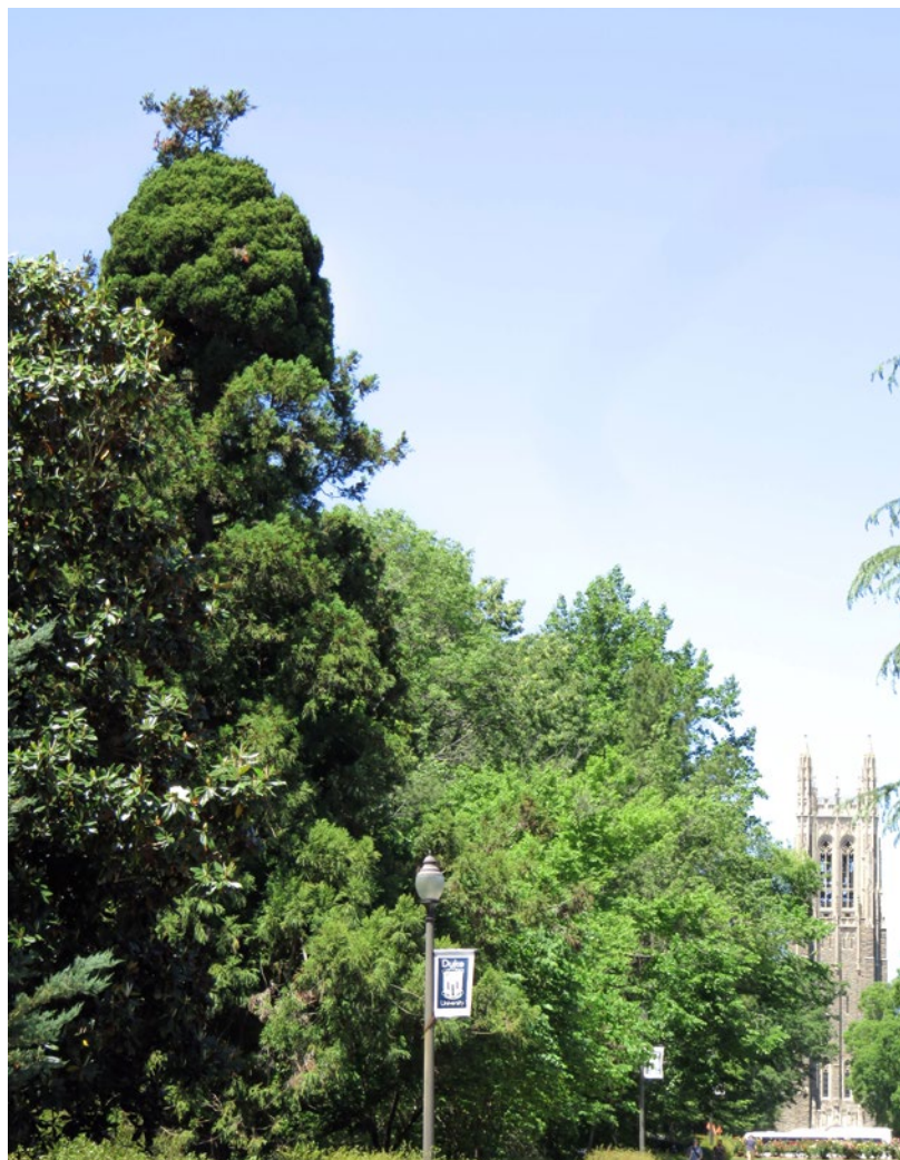
Cryptomeria japonica 'Chapel View' witch's broom