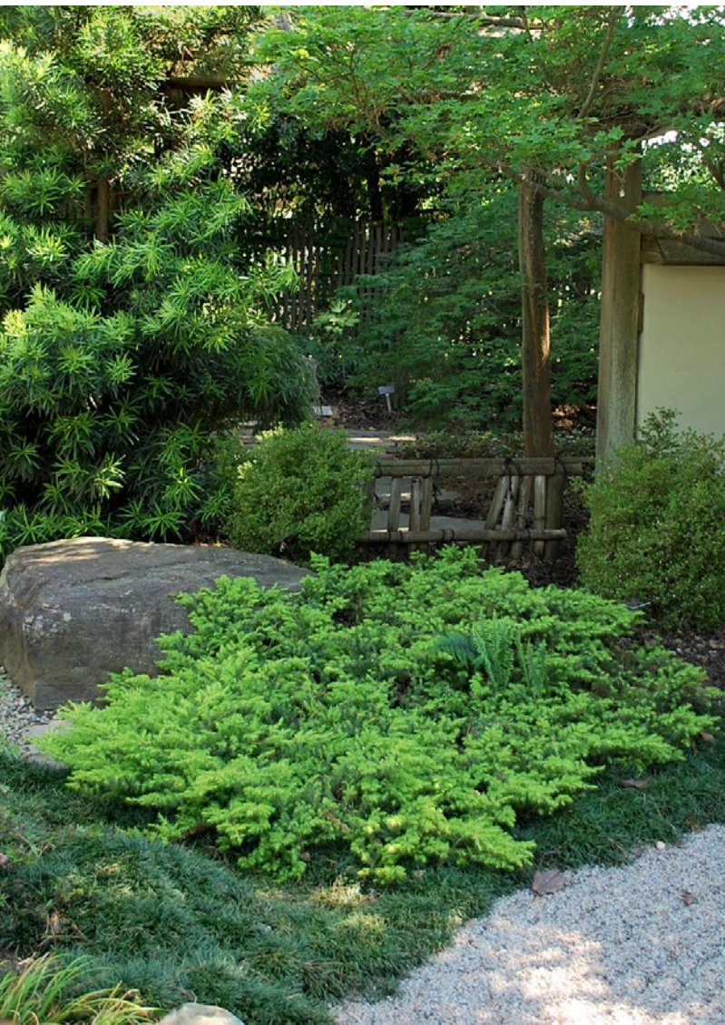
Japanese Garden

Duke Gardens is situated on 55 acres on the campus of Duke University and is named one of the top 10 public gardens in the U.S. by tripadvisor.com. Among its many features are Italianate terraces, a Japanese Garden, a garden of native plants, a white garden, and a SITES certified organic food garden.