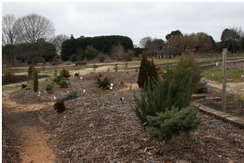
New conifer beds, March 4, 2016

A crushed gravel path made from a local material known as Chapel Hill gravel combined with some permeable pavers forms the path system and makes an excellent contrast with the mulched beds and ties this collection to our other Arboretum paths. After the beds were roughly constructed and bermed to about 36", paths were cleared and compacted. A base layer of crushed stone 3"-4" thick was put down. Paths were graded to a low spot which was dug out to create a 3'x3' dry well filled with gravel and topped by permeable pavers. The crushed stone paths were compacted and topped with 1" of Chapel Hill gravel which was again compacted.