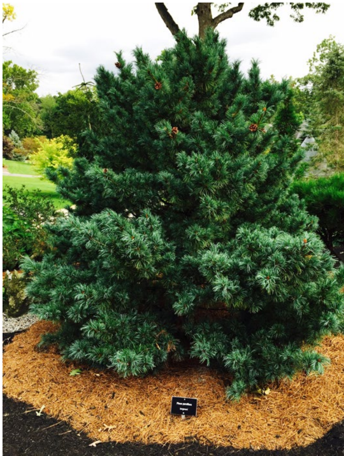
Pinus parviflora 'Bergman'