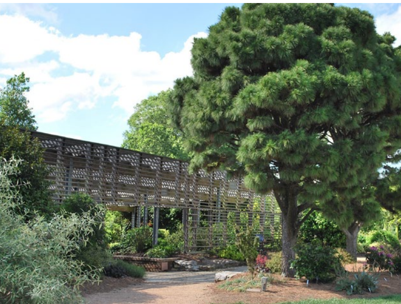
Pinus taeda