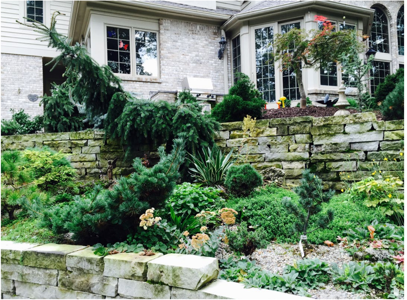
Front Scape Terrace