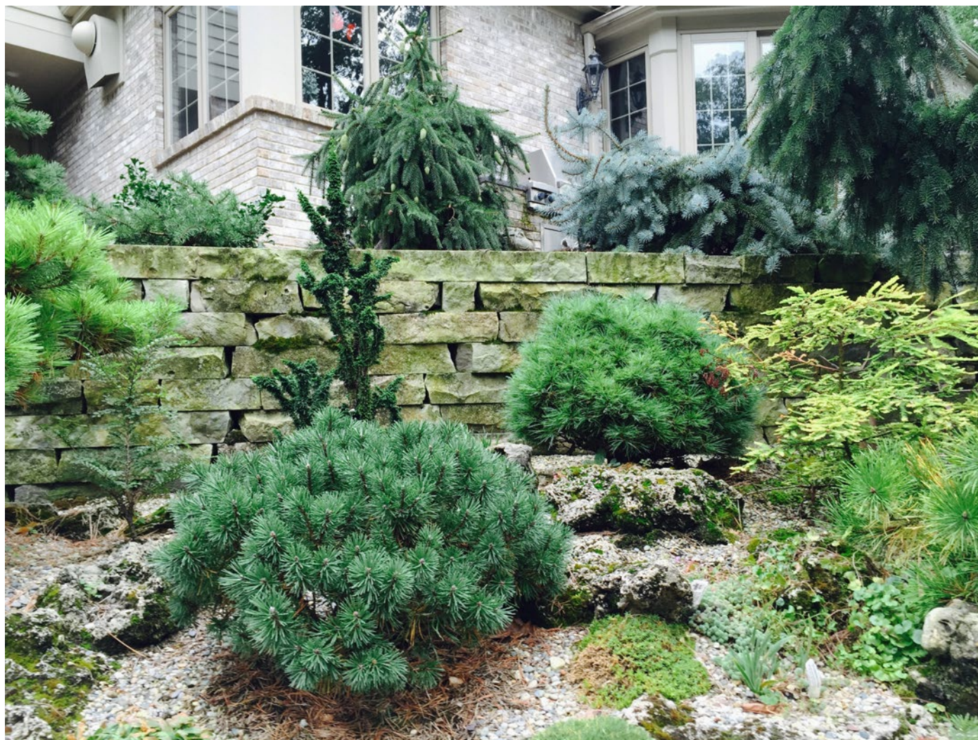
Front Scape Terrace