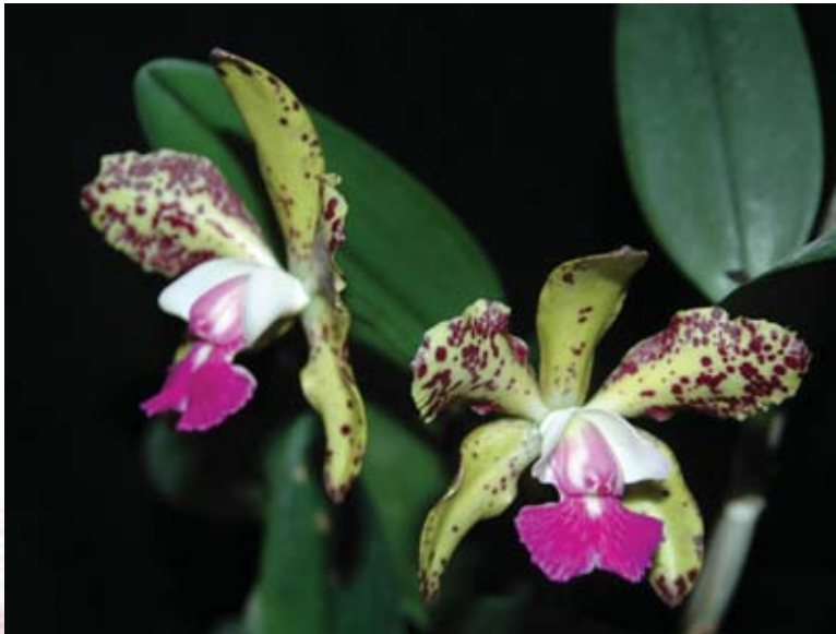
Blc. Sun Coast Sunspots