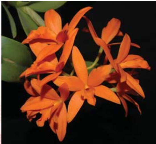
Lc. Trick or Treat

As many of the societies take a summer hiatus, here are some suggestions to help keep your orchid experience going through the summer. As an example, as you are repotting (either individually or as a society), perhaps you could solicit the assistance of new members of your society, give them some hands on experience and share divisions with them....a win-win for everyone. Visit commercial orchid firms listed on the AOS web site and in the Orchid Source Directory (I've heard of some members who keep theirs in their car so they can check while traveling on whose nearby). As you are planning your summer vacations or outing take advantage of reciprocal garden admissions AOS members enjoy. Use some hot lazy summer days exploring the members only section of the AOS web site.....lots of hidden nuggets to enrich your orchid journey and improve growing or spark a new or renewed interest in a particular variety. Check out some of the summer orchid events (listed in Orchids as well as on the AOS website – keep checking for new additions) including Redland Orchid Festival, Shore Orchid Festival, Santa Barbara Orchid Estate International Fair, Central Iowa Orchid Society Speakers Day, Houston Orchid Society Summer Workshop or Phalaenopsis Symposium.