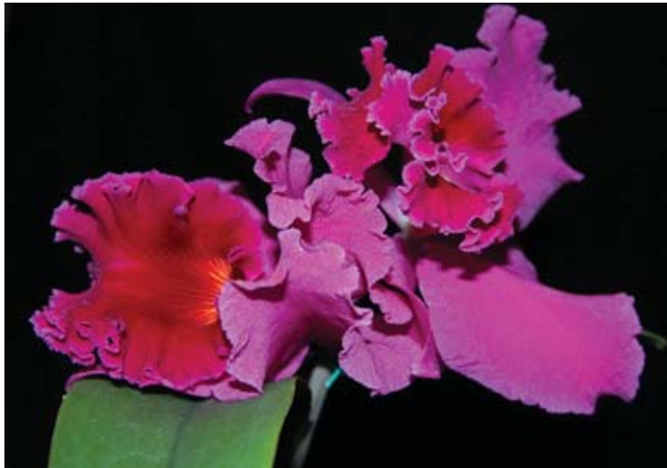
Blc. Mem. Grant Eichler 'Lenette' HCC/AOS