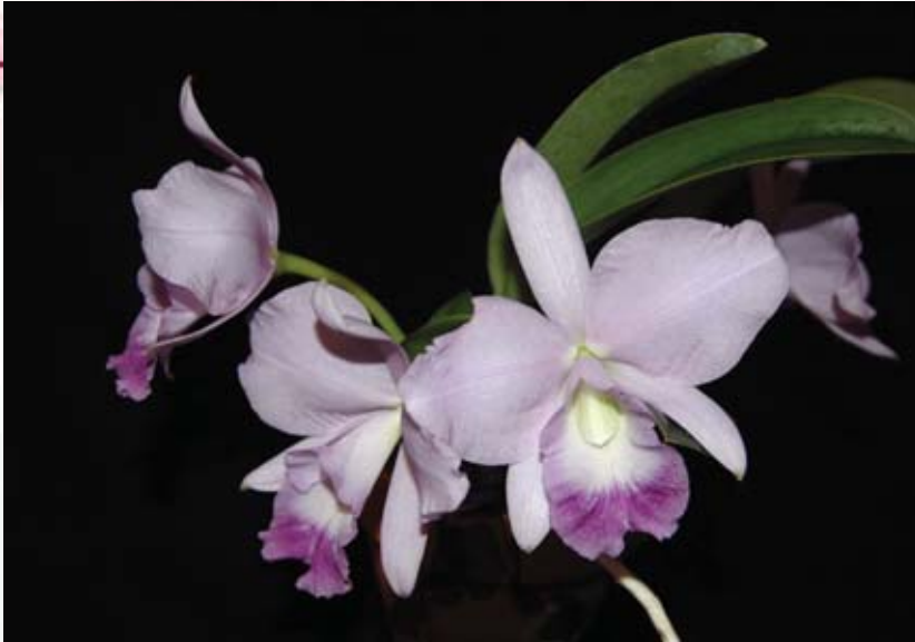
Lc. Lake Tahoe v. coerulea 'High Sky'