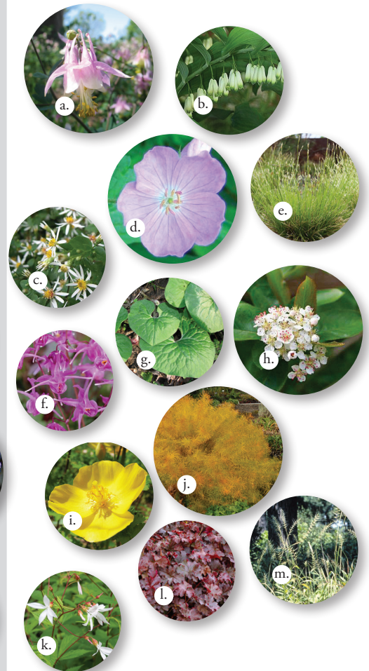
a. Aquilegia canadensis ; b. Polygonatum biflorum ; c. Aster divaricatus 'Eastern Star'; d. Geranium maculatum ; e. Carex appalachica ; f. Epimedium 'Lilafee'; g. Asarum canadense ; h. Aronia melanocarpa 'LowScape'; i. Stylophorum diphyllum ; j. Amsonia hubrichtii ; k. Gillenia trifoliata ; l. Heuchera 'Chocolate Ruffles'; m. Hystrix patula

Transform your shady areas into lush landscapes! These shade tolerant plants offer delicate blooms and interesting foliage, creating texture and dynamics in low-light settings.