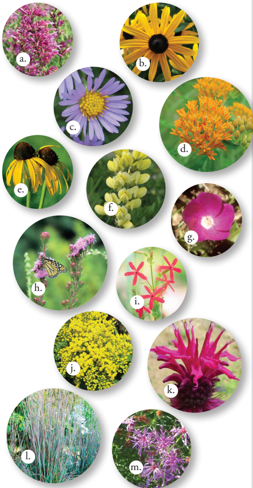
a. Agastache 'Raspberry Summer'; b. Rudbeckia fulgida ; c. Aster oblongifolius 'Raydon's Favorite'; d. Asclepias tuberosa ; e. Echinacea paradoxa ; f. Baptisia 'Lemon Meringue'; g. Callirhoe involucrata ; h. Liatris ligulistylis ; i. Silene regia ; j. Solidago 'Little Lemon'; k. Monarda 'Raspberry Wine'; l. Schizachyrium scoparium 'Standing Ovation'; m. Vernonia 'Iron Butterfly'

Pollinator-friendly plants chosen for their beauty, succession of bloom and ease of care. Most importantly, they provide food and habitat for pollinators of all kinds.