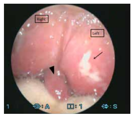
Figure 1: Bilateral peritonsillar areas were bulging with centrally located uvula (arrowhead) and pus discharge over left peritonsillar area (arrow).

uvula was centrally located (Figure 1). There was no swelling over the posterior pharyngeal wall.