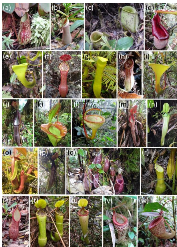
Figure 3 Nepenthes species recorded from West Sumatra: (a) N. adnata (lower pitcher), (b) N. albomarginata (lower pitcher), (c) N. ampullaria (rosette pitcher), (d) N. bongso (lower pitcher), (e) N. dubia (upper pitcher), (f) N. eastachya (lower pitcher), (g) N. gracilis (upper pitcher), (h) N. barauensis (lower pitcher), (i) N. inermis (upper pitcher), (j) N. izumiae (upper pitcher), (k) N. jacquelineae (upper pitcher), (l) N. jamban (upper pitcher), (m) N. lingulata (upper pitcher), (n) N. longifolia (upper pitcher), (o) N. mirabilis (upper pitcher), (p) N. naga (upper pitcher), (q) N. pectinata (rosette pitcher), (r) N. reinwardtiana (upper pitcher), (s) N. rhombicaulis (upper pitcher), (t) N. singalana (upper pitcher), (u) N. spatulata (upper pitcher), (v) N. talangensis (upper pitcher), (w) N. tenuis (upper pitcher). Authorities are noted in Table 1

the entire global population of some of these locally endemic species. Conservation needs and responsibilities are therefore extremely high. Further exploration and formal records would add to the quality of existing assessments. Beyond assessing their conservation status, the key threats to the majority of Nepenthes in Indonesia are land-use change and collection for the horticultural trade (Clarke et al. 2018; Cross et al. 2020), so practical conservation methods need to address these challenges that will only be successful with the support of local communities and governments. These fascinating restricted range and threatened Nepenthes species in Sumatra need further study, especially regarding their distribution and population status. A more detailed exploration of the mountainous regions of Sumatra may well find further populations, as we have done here.