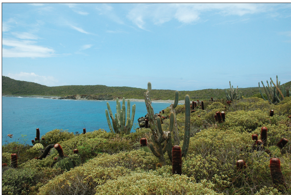
Figure 4. Coastal scrub community typical of Solanum conocarpum habitat at Nanny Point, St. John, USVI.

Ecological data can sometimes reflect a “convenience sampling” approach (Anderson 2001). This occurs when data are collected either at sites located by chance or readily accessible along roads or trails, and are not representative of