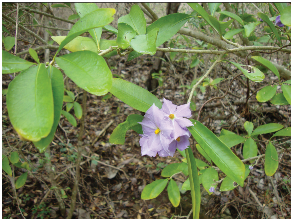
Figure 2. Flowering Solanum conocarpum individual at Brown's Bay trail, Virgin Islands National Park, St. John, USVI.

We utilized these digital databases to generate a habitat suitability model for S. conocarpum in St. John using geographic locations of 3 surveyed populations and 5 other known populations made available following our field surveys, along