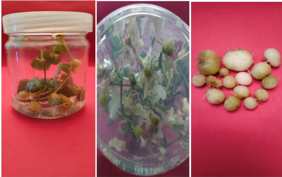
Fig. 5: In vitro tuberization stage of Ceropegia woodii shoots grown in vitro on MS medium augmented with BA at 8 mg/l and sucrose at 60 g/l over 60 days.