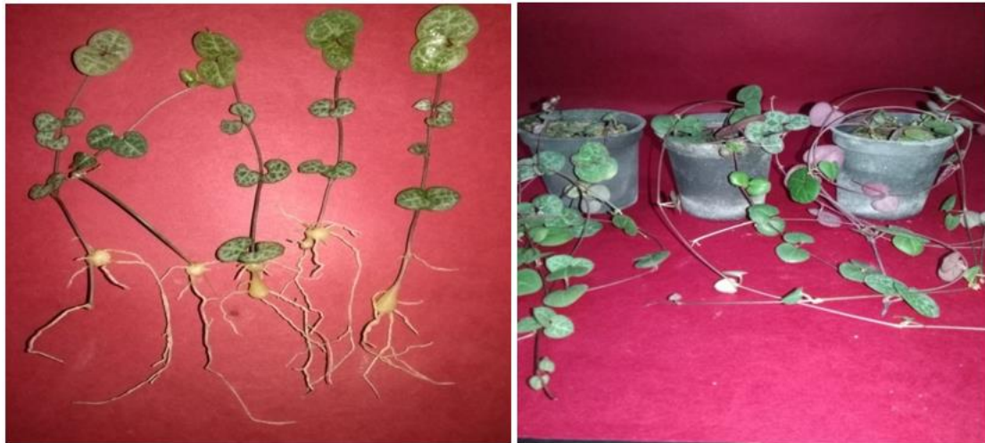
Fig. 6: Acclimatization stage of Ceropegia woodii shoots grown on rooting medium of peatmoss and perlite at (1:1, v/v) over 30 days.

Survival was observed when plantlets were transferred to pots containing a potting mixture of sterile soil, sand and coco peat (Chavan et al. , 2013b). Similarly, in vitro rooted plants of C. evansii and C. noorjahaniae were transferred to sterile soil, sand and coco peat for their ex vitro establishment with (90% and 85%) of survival rate, respectively (Chavan et al. , 2015; Chavan et al. , 2014b; Chavan and Ahire, 2016). Decomposed coir waste, perlite and compost were a planting substrate for successful acclimatization of C. pusilla was reported twice by the same research group (Kalimuthu and Prabakaran, 2013d; Prabakaran et al. , 2013). Rooted plantlets of Ceropegia mohanramii were transferred to sterile planting substrate (a mixture of sand and coco peat 1:1) for hardening. Initially, the plantlets were covered and kept in the laboratory conditions for 2 weeks recorded the highest mean value percentage of plant survival (Avinash et al. , 2019). The successful acclimatization of Ceropegia media (58%) was attained after two months resulting in normal phenotype in pots (Pandey et al. , 2020).