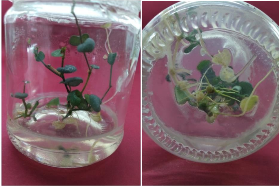
Fig. 3: Rooting stage of Ceropegia woodii shoots grown in vitro on MS medium plus IBA at 1.00 mg/l and NAA at 0.50 mg/l over 35 days.

Chavan et al. (2013b) reported the in vitro rooting of C. panchganiensis , the shoots showed a better rooting response in IBA supplemented medium. The highest incidence of root formation ( 96 \pm 1.9\% ), number of roots ( 9.3 \pm 0.9 ), and root length ( 3.6 \pm 0.5 cm). maximum rooting percentage (92%), and a maximum number of roots ( 10.3 \pm 0.9 ) for C. evansii was achieved with \frac{1}{2} MS medium fortified with IBA (1.0 mg l -1 ) after 28 days (Chavan et al. 2015 and 2018).