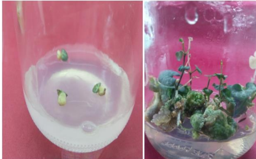
Fig. 4: Caulogenesis stage of Ceropegia woodii leaf segments and shoots regenerations grown in vitro on MS medium augmented with BA at 0.5 mg/l and NAA at 2.00 mg/l over 35 days.

The above-mentioned results could be attributed to the role of exogenous cytokinin in enhancing plant cell division. It has been suggested that cytokinins might be required to regulate the synthesis of proteins involved in the formation of new cells (Pasternak et al. , 2002). Regarding the main effect of auxin, it represents the important growth regulator for the induction of callus in the majority of angiosperms (Roy and Banerjee, 2003). NAA acts as an auxin to induce cell division and enlargement at low concentrations. Cell enlargement has been associated with an increase in activities of autolytic and synthetic enzymes, which affect cell wall plasticity and synthesis of new wall materials (Cleland, 1981). Hence, a balance between auxin and cytokinin growth regulators is most often required for the formation caulogenesis and subsequent events (Johri and Mitra, 2001).