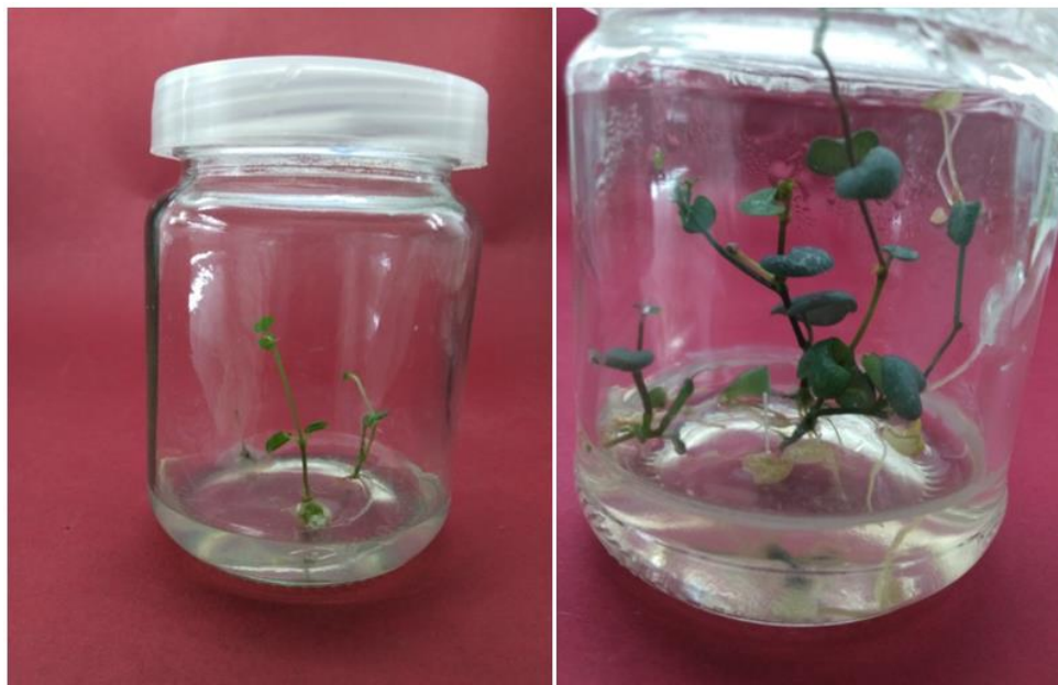
Fig. 1: Initiation stage of Ceropegia woodii single nodal grown in vitro on MS medium augmented with BA at 0.50 mg/l and NAA at 2.00 mg/l over 35 days.

Regarding the main effect of NAA tested levels on the above-mentioned traits, commonly, the highest mean values were always recorded at 2.00 mg/l of NAA in the culture medium, and the lowest ones were noticed at its absence from the cultured medium (0.00 mg/l) or at (4.00 mg/l), except the mean number of roots formed per propagule. Concerns the interaction between levels of both factors under the study the BA at 0.25 and NAA at 1.00 mg/l led to the highest mean values of the studied characters in general. On the other hand, the lowest mean values of the above-mentioned characters were recorded at the highest levels of both factors (i.e. NAA and BA at 4.00 and 1.00 mg/l, each in turn). On the other side, the number of roots showed the highest mean values at 1.00 mg/l NAA added in the culture medium, but the lowest ones were noticed at its absence or highest level (4.00 mg/l).