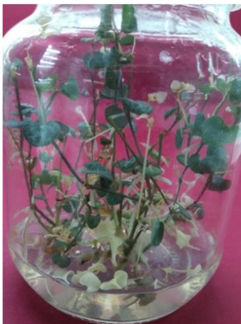
Fig. 2: Multiplication stage of Ceropogia woodii explants grown in vitro on MS medium augmented with BA at 1.00 mg/l and NAA at 0.50 mg/l over 35 days.

The interaction between both BA and NAA at 1.00 and 0.50 mg/l, respectively, resulted in the highest mean value. With respect to the number of roots formed per propagule, both growth regulators had a highly significant effect on the given trait. The main effect of BA showed that MS-basal medium free of BA, gave the highest mean value. In case of NAA main effect, augmenting basal medium with 1.00 mg/l of it brought about the maximum mean value of the number of roots formed per propagule. While, the combinations between BA at 0.00 mg/l, and NAA at 50 or 1.00 mg/l led to the formation of the highest mean number of roots.