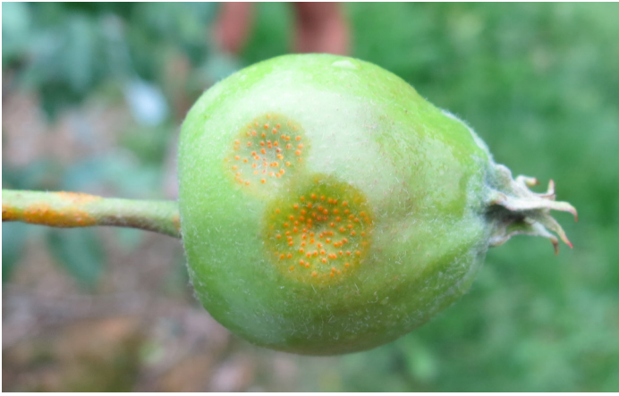
Figure 2. Cedar apple rust pycnia on a young apple fruit and fruit stem.

gelatinous and orange in color (Fig. 3b, c). Telia produce spores in the spring that infect apple leaves and fruit.