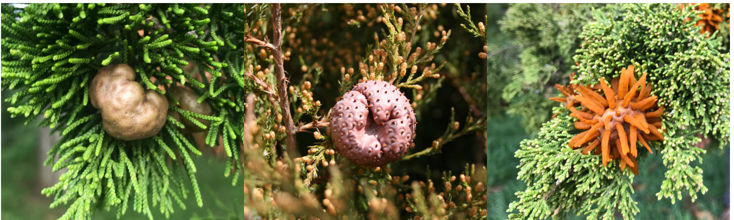
Figure 3. (a) Cedar apple rust galls form on eastern red cedar starting in the autumn months after initial infection. Galls continue to grow through spring, summer and fall of the following year, allowing the fungus to overwinter through two winters. (b) Early in the second spring, the mature galls begin to exude telial horns. (c) By mid-spring telial horns have fully developed. During wet weather they become gelatinous and orange whereupon they release teliospores that generate subsequent basidiospores to spread the infection to an apple host. Telial horns can dry down and rehydrate to produce repeated cycles of basidiospores before the spore supply is exhausted and the gall dies out.

Highly susceptible cultivars that warrant a fungicide program include: cvs. Burgundy, Braeburn, Cameo, Cortland, Golden Delicious, Gala, GoldRush, Jonagold, Jonathan, Julyred, Lodi, Macfree, Monroe, Mutsu, Northern Spy, Lodi, Prima, Quinte, Rhode Island Greening, Rome Beauty, Sir Prize, Stayman, Twenty Ounce, Vista Bella, Wayne, Wealthy, and York Imperial.