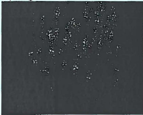
Figure 2. Astragalus ampullarioides in flower.

The fruit is a short, broad, long-stipitate bilocular pod (0.8 to 1.5 cm (0.3 to 0.6 inches) long and 0.6 to 1.2 cm (0.2 to 0.5 inches) wide). A. ampullarioides commonly has up to 45 flowers in a raceme inflorescence which are borne on a peduncle up to 21 cm (8.5 inches) long.