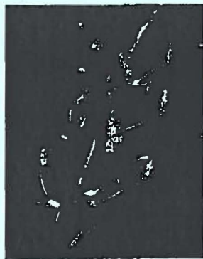
Figure 3. Astragalus ampullarioides fruits.