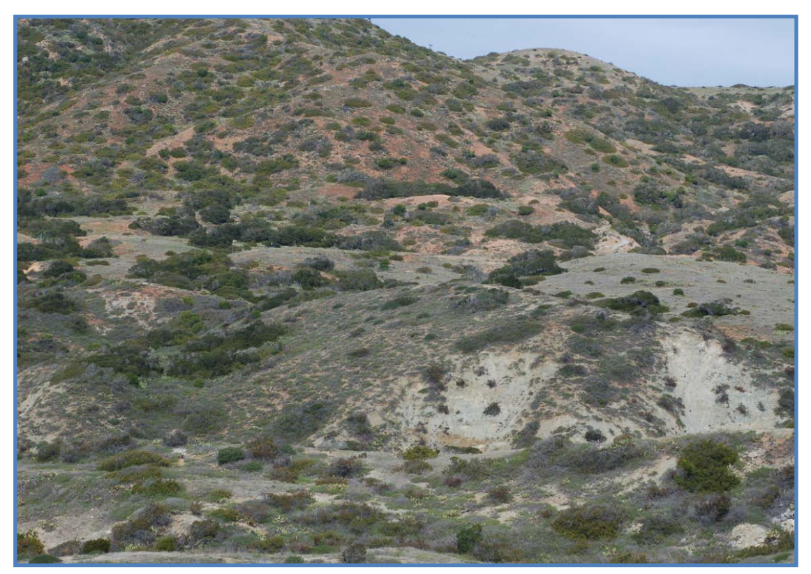
Figure 1: Landscape within Wild Boar Gully on Santa Catalina Island.