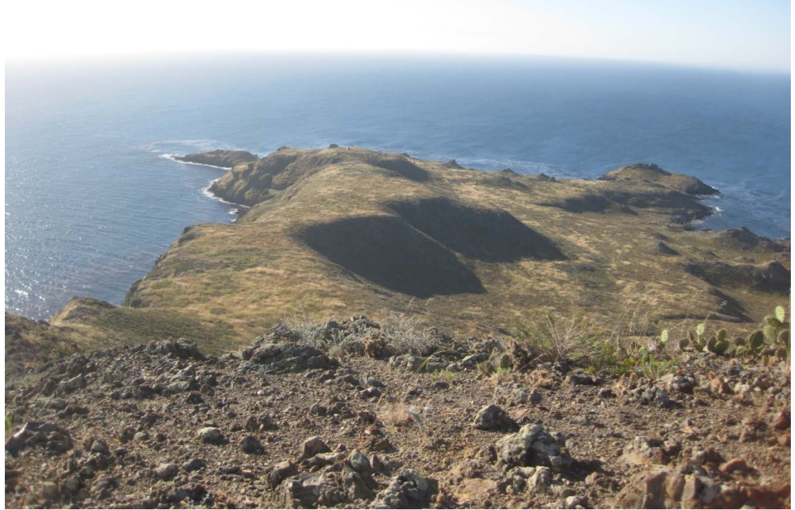
Figure 2: Rocky escarpment looking southeast towards Pyramid Point on San Clemente Island.