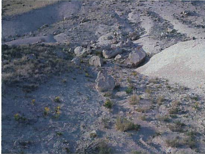
Habitat of the Sand Draw population