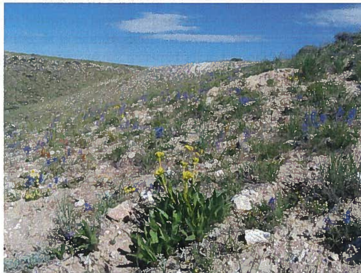
Habitat of the Cedar Rim population

Conversely, the Cedar Rim population does not occur on an outwash; the seven subpopulations occupy a narrow band along escarpment slopes (Heidel et al. 2011). These slopes are generally south-facing, mostly at the intersection between the cushion plant rim and sagebrush grassland toeslope communities on gravelly silt loam derived from the White River Formation (Heidel and Handley 2010, as cited in Heidel et al. 2011). Vegetation cover consists of 5 to 20 percent bunchgrasses, including Pseudoroegneria spicata (bluebunch wheatgrass) and Koeleria cristata (junegrass), accompanied by diverse forbs (broad-leaved herbs). Therefore, the habitats of the two populations differ not only in their topographic positions (mid-slope vs. base), but also in vegetation structures (bunchgrass community vs. barren cushion plant community) (Heidel et al. 2011).