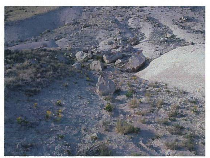
Habitat of the Sand Draw population

Conversely, the Cedar Rim population does not occur on an outwash; the seven subpopulations occupy a narrow band along escarpment slopes (Heidel et al. 2011). These slopes are generally south-facing, mostly at the intersection between the cushion plant rim and sagebrush grassland toeslope communities on gravelly silt loam derived from the White River Formation (Heidel and Handley 2010, as cited in Heidel et al. 2011). Vegetation cover consists of 5 to 20 percent bunchgrasses, including Pseudoroegneria spicata (bluebunch wheatgrass) and Koeleria cristata (junegrass), accompanied by diverse forbs (broad-leaved herbs). Therefore, the habitats of the two populations differ not only in their topographic positions (mid-slope vs. base), but also in vegetation structures (bunchgrass community vs. barren cushion plant community) (Heidel et al. 2011).