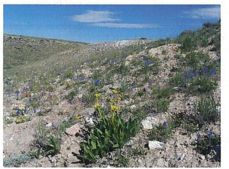
Habitat of the Cedar Rim population

Conversely, the Cedar Rim population does not occur on an outwash; the seven subpopulations occupy a narrow band along escarpment slopes (Heidel et al. 2011). These slopes are generally south-facing, mostly at the intersection between the cushion plant rim and sagebrush grassland toeslope communities on gravelly silt loam derived from the White River Formation (Heidel and Handley 2010, as cited in Heidel et al. 2011). Vegetation cover consists of 5 to 20 percent bunchgrasses, including Pseudoroegneria spicata (bluebunch wheatgrass) and Koeleria cristata (junegrass), accompanied by diverse forbs (broad-leaved herbs). Therefore, the habitats of the two populations differ not only in their topographic positions (mid-slope vs. base), but also in vegetation structures (bunchgrass community vs. barren cushion plant community) (Heidel et al. 2011).