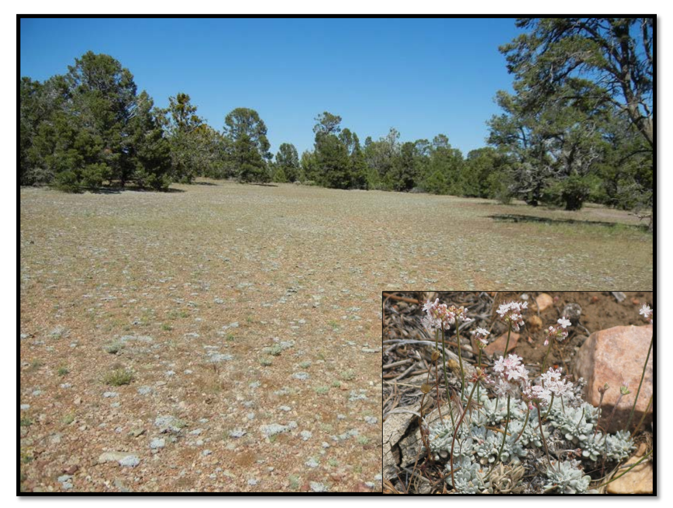
Pebble plain habitat Eriogonum kennedyi var. austromontanum (southern mountain wild buckwheat).

U.S. Fish and Wildlife Service Carlsbad Fish and Wildlife Office Carlsbad, CA