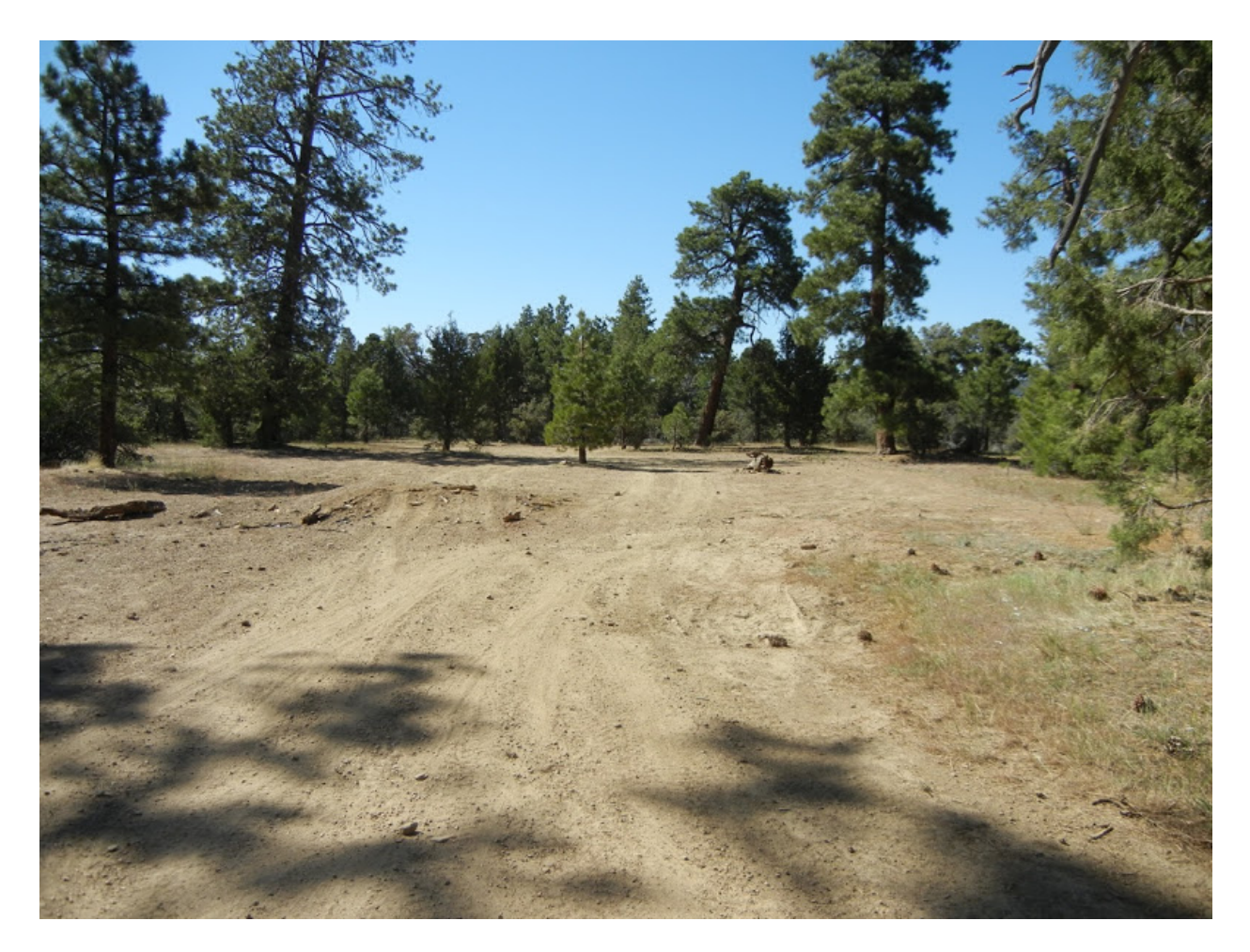
Figure 1. Heavy Off-Highway Vehicle use at the "Deveg/Horseshoe" pebble plain within the Sawmill pebble plain complex.