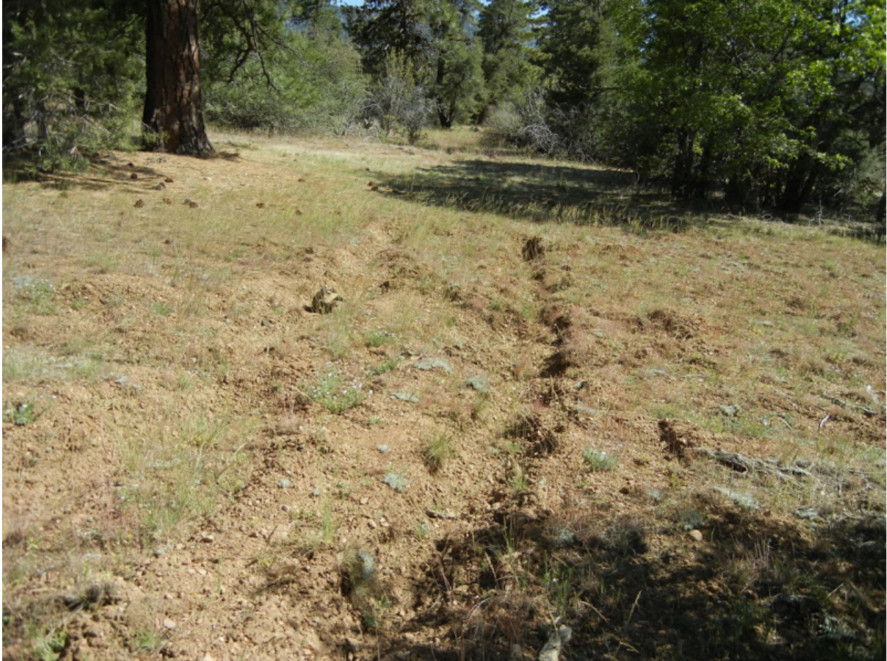
Figure 2. New damage in spring 2012 from Off-Highway Vehicle activity at the "Deveg/Horseshoe" pebble plain site (USFWS photo, 2012).