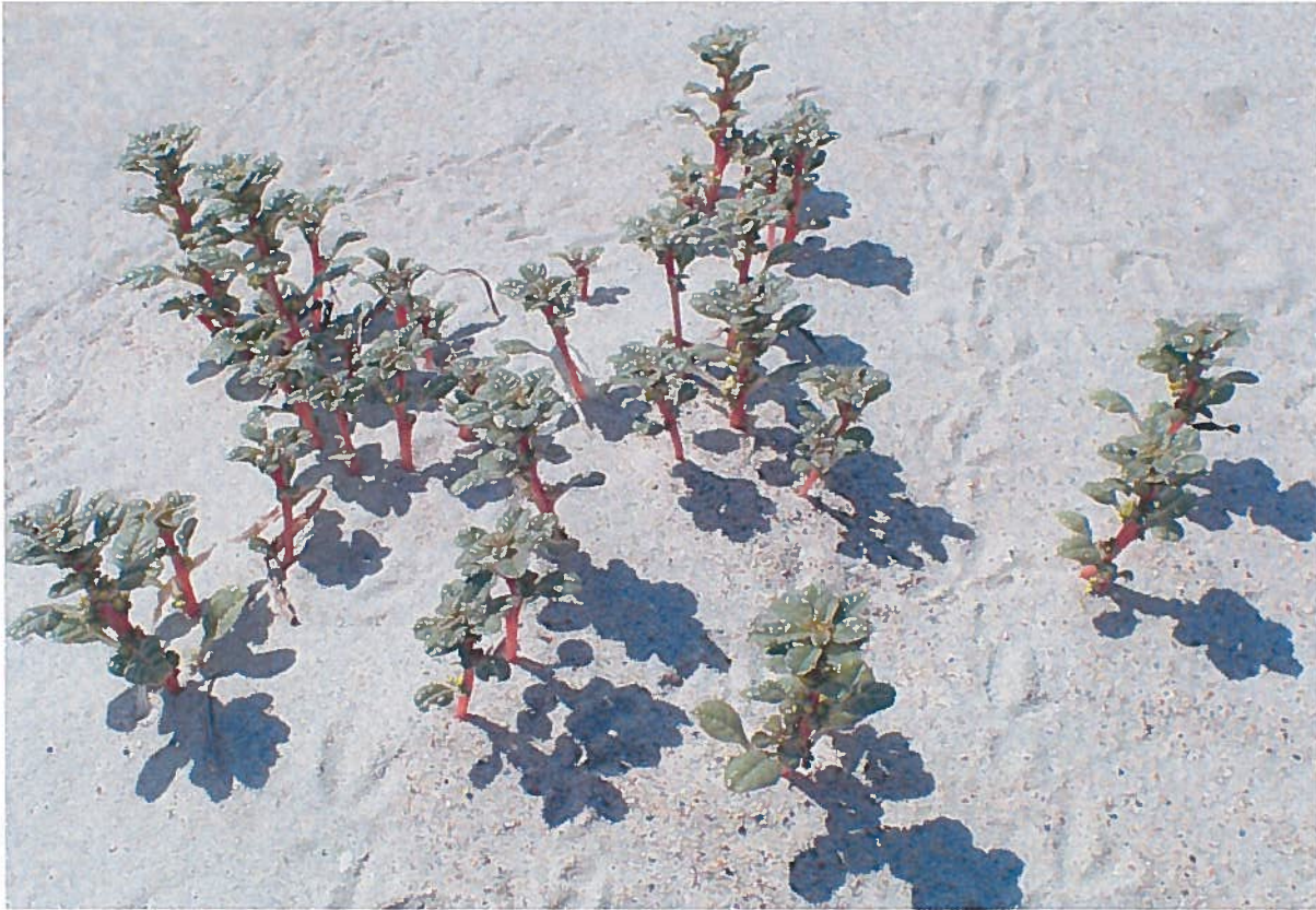
USFWS Photo by Dale Suiter

U.S. Fish and Wildlife Service Southeast Region Raleigh Ecological Services Field Office Raleigh, North Carolina