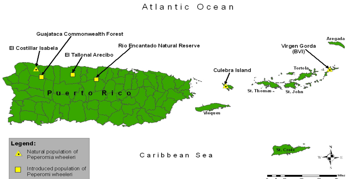
Figure 2. Current distribution of Peperomia wheeleri in Puerto Rico, US Virgin Islands and British Islands (USFWS, unpubl. data, 2013).

Even though the overall distribution of Wheeler’s peperomia has expanded in twenty years, the plant has very limited spatial distribution at known localities (Table 2). When the recovery plan was approved, the area of occupancy of the species in Puerto Rico was estimated at about 0.5 acres (0.2 hectare) (USFWS 1990). In February 2007, Service biologist Carlos Pacheco conducted an assessment on the status of the species in Puerto Rico. Based on his observations, the species has a clumped distribution pattern. The total area currently occupied by natural populations of the species is approximately 1 acre (0.4 ha) (Table 2; C. Pacheco, USFWS unpublished data 2007a,b). The total area currently occupied by the re-introduced populations is unknown.