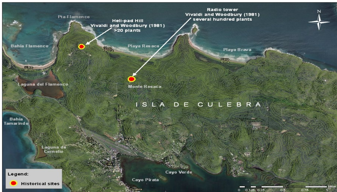
Figure 1. Historical distribution of Wheeler's peperomia ( Peperomia wheeleri ) in Culebra Island (Vivaldi and Woodbury 1981).

Every year the Service reviews the status of listed species and update species information in the Recovery Data Call (RDC). The last RDC for the Wheeler's peperomia was completed in 2013. Recovery Data Call: 1998, 1999, 2000, 2001, 2002, 2003, 2004, 2005, 2006, 2007, 2008, 2009, 2010, 2011, 2012 and 2013.