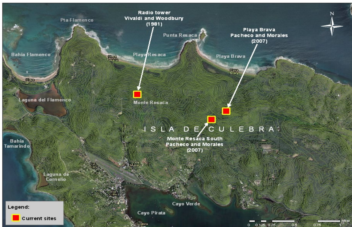
Figure 3. Current distribution of Peperomia wheeleri in Culebra Island (Pacheco, USFW, unpubl. data, 2007a).