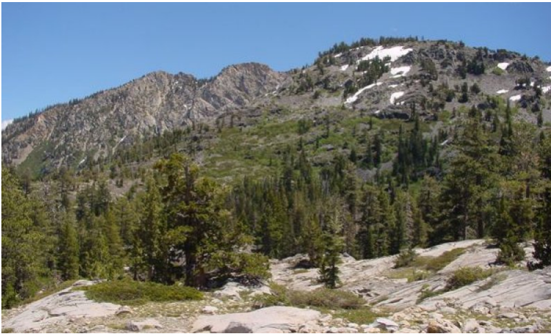
Figure 7. Community Phase 1.1