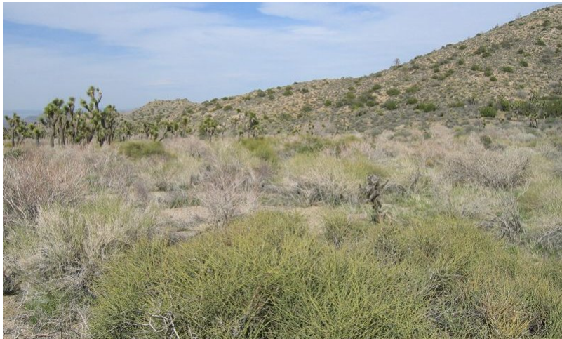
Figure 5. CT 2.1 California jointfir - burrobrush