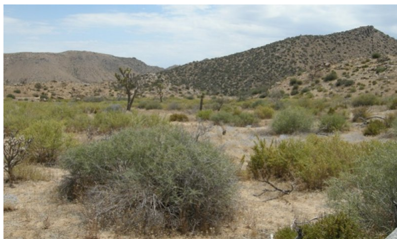
Figure 8. 11 years post-fire