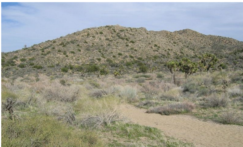
Figure 6. CT 2.1 California jointfir - burrobrush