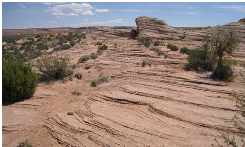
Figure 5. Sandstone Rockland 6-10" p.z.