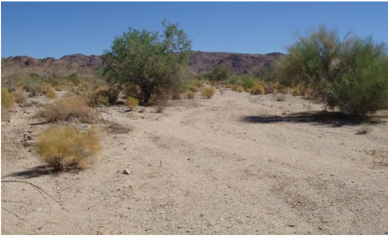
Figure 8. CC2 with Desert Ironwood