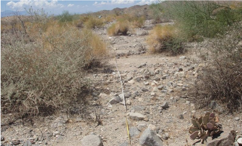
Figure 5. Community Component 2