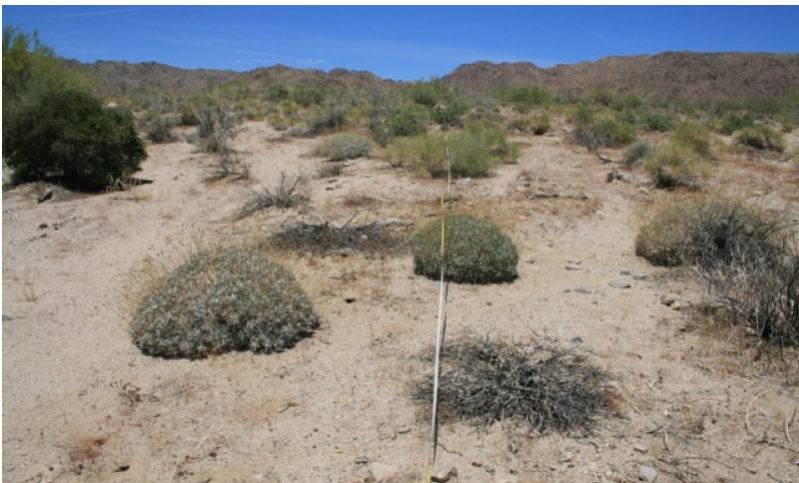
Figure 7. Community Component 3