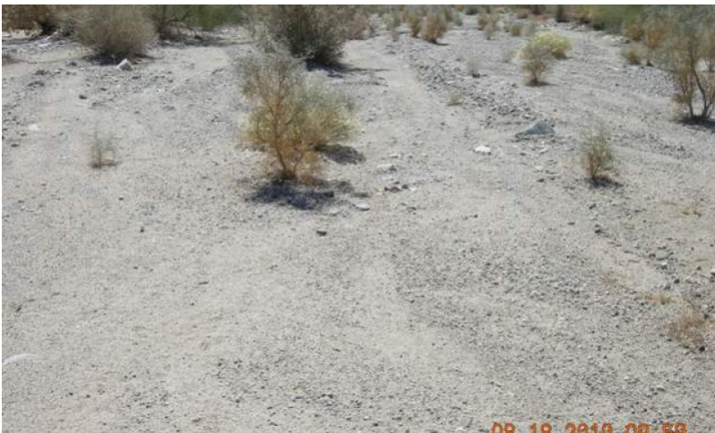
Figure 6. Community Component 1