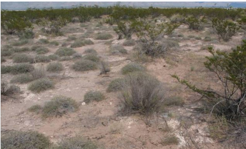
Figure 8. Mixed-Shrub w/creosotebush

This State is Characterized by a decrease in grass cover resulting in dominance of the shrub component. Hairy crinklemat is dominant with fourwing saltbush or Torrey's ephedra typically occurring as sub-dominant. Occasionally creosotebush is present. This typically occurs where the soils of the site or adjacent sites contain calcium carbonate. Other important species include, gyp moon pod, stinging cevallia, and pitchfork, Grass cover is sparse usually consisting of scattered gyp dropseed. High cover of biological crusts helps to limit erosion and retain soil moisture. It is not known if they enhance or limit seedling establishment on these sites.