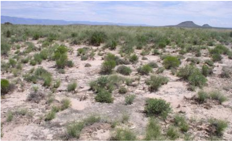
Figure 5. Grass/Mixed shrub

The Grass/Mixed shrub community is believed to be the historic plant community for this site. It is naturally a patchy mixture of grasses and shrubs dominated by gyp dropseed and hairy crinklemat. Torrey's ephedra, fourwing saltbush, alkali sacaton, and gyp monopod are also commonly found on this site.