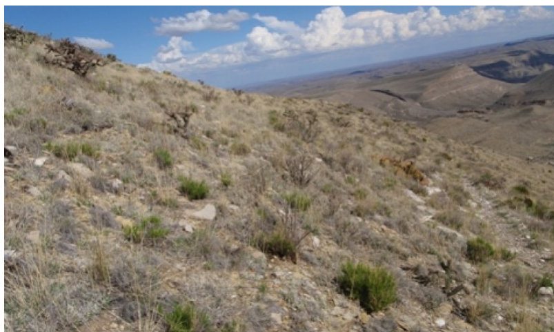
Figure 4. 1.1 Gramas/Shrubs Community

The Grama/Shrubs Community is the reference or current potential vegetative community. Characteristic grasses include sideoats grama, black grama, blue grama, Warnock's grama, curlyleaf muhly, and New Mexico feathergrass. Shifts in above average winter or summer precipitation can shift dominance from either black grama or sideoats to cool-season grasses. In addition, the more mesic grasses such as sideoats grama, blue grama, and curlyleaf muhly will inherently be more abundant on north facing slopes while black grama will dominate south-facing slope. A variety of shrubs occurs sporadically and is characterized by winterfat, skeletonleaf goldeneye, ephedra, mariola, mountain mahogany, and New Mexico agave. Canopy cover of shrubs can range from 5-20 percent. It is unknown if the higher shrub cover in some locations is attributed to past management or it is part of the natural variability of the site. Shrub canopy cover over 25 percent will categorize the site in the Shrubland State. Annual production ranges from 600 to 1400 pounds per acre. The site is suited for livestock grazing and provides important wildlife habitat. Heavy continuous grazing over several years can reduce and potentially eliminate black and blue grama. Sideoats grama, threeawns, slim tridens, and hairy grama will increase. If there is an available seed source, shrubs may begin to encroach on the site.