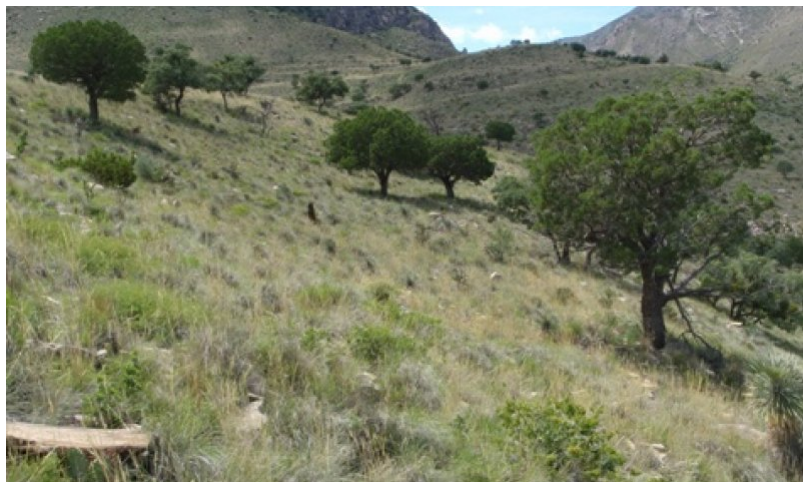
Figure 7. 3.1 Muhlys-Gramas/Oak-Juniper Community

This plant community is an inclusion within the Bonespring map unit that occurs in a cooler and wetter soil temperature regime. Soils still remain shallow to mostly sandstone with some areas derived from limestone. At Guadalupe Mountains National Park, it is found on the north facing slopes of Pine Spring Canyon and the north face slopes of the foothills of Frijole Ridge. According to the park’s Fire Management Plan, this area is referred to as the Madrean Evergreen Woodland. The reference plant community is a gray oak – alligator juniper savanna with abundant warm- and cool-season perennial bunchgrasses such as pine muhly, bull muhly, sideoats grama, and New Mexico feathergrass. Scattered shrubs include skunkbush sumac, cholla, and wavyleaf oak. Annual production ranges from 1350 to 2600 pounds per acre. Similar open savanna communities such as this one are typically maintained by a fire interval of 10-30 years (Abbott 1998). The few scattered woody plants allows for maximum herbaceous production that ultimately provides the fuel to carry fires. Fire suppression either alone or in combination with overgrazing will allow woody plants to increase at the expense of herbaceous plants. Conservation practices such as prescribed fire and prescribed grazing will help maintain an open savanna or oak woodland.