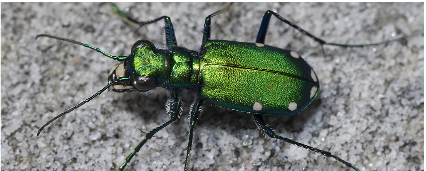
Six-spotted tiger beetle