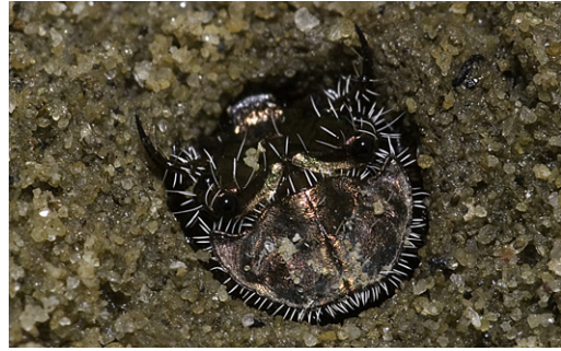
Tiger beetle larva inside a burrow (top view)

Tiger beetles are found in a variety of habitats, but soil type is very important to each species. For example, some species such as the big sand tiger beetle ( Cicindela formosa ), prefer sandy areas as the common name implies, with little or no low vegetation. The splendid tiger beetle ( C. splendida ), is often found in association with open areas and red clay soils. Many readers probably have seen the widespread, iridescent-green six-spotted tiger beetle ( C. sexguttata ) while walking trails or dirt roads throughout the state. This common species occasionally is even found on sidewalks or patios. The one-spotted tiger beetle ( C. unipunctata ) is normally found in woodlands where it forages under leaf litter. In fact, no matter where you wander outside in Kentucky, a tiger beetle could be nearby. You may not have seen it or even been aware of its presence, but at some point you likely have been in the eye of the tiger. 🐅