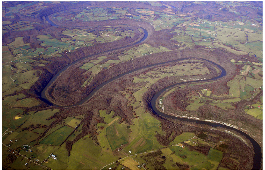
A forested corridor along the Kentucky River Palisades

One thing that is certain is that we have to address another vexing issue – habitat fragmentation. The landscape has been chopped up by urban and suburban areas, roads, utility corridors, crop agriculture and other land uses that separate large areas of natural habitat by developed areas that plants and animals can not travel across. One concern over this parceling of the landscape is that it isolates plants and animals in "islands" of natural habitat. There has been longstanding recognition of the need to create corridors to connect these areas to prevent the genetic isolation of the plants and animals that survive within them. This same concept of connecting large natural areas with travel corridors to prevent genetic isolation can also provide pathways for plants and animals to migrate and adapt to a rapidly changing environment brought on by global warming.