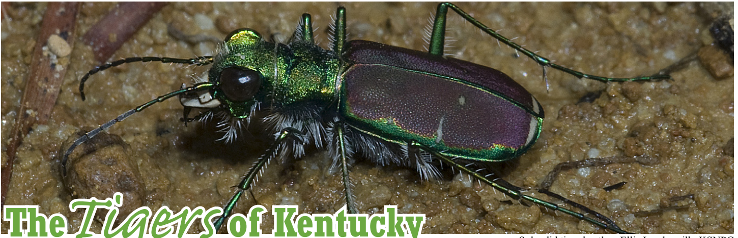
Splendid tiger beetle ~ Ellis Lauder milk, KSNPC