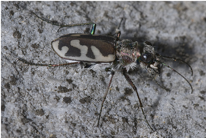
Big sand tiger beetle ~ Ellis Laudermilk, KSNPC