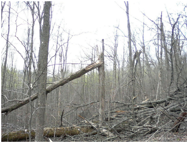
Vernon-Douglas State Nature Preserve, Hardin County

We won't soon forget the impact the ice storm of 2009 has had on our lives, and we will see the evidence in our nature preserves for years to come. It is important to remember that despite the broken trees and damaged canopies, this storm was a natural occurrence. As nature so often illustrates, the preserves will repair themselves. New tree branches will grow, seeds will sprout, and woody debris will decompose, feeding insects and microorganisms and enriching the soil. ☞