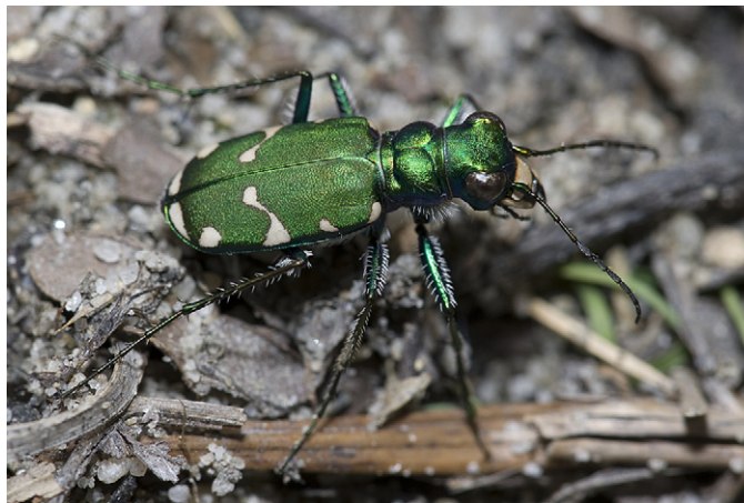
Northern barrens tiger beetle ~ Ellis Lauder milk, KSNPC

While roaming pine barrens and pine-oak ridge tops in eastern Kentucky the last few years, I've encountered one of Kentucky's most stunning "tiger" species on a few occasions. This secretive predator is beautiful with a striking pattern of white or cream colored lines on its back and an iridescent-green body. Sounds unusual for a tiger, but many Kentucky species exhibit a variety of iridescent colors and line patterns. The tigers I'm referring to here are insects known as northern barrens tiger beetles ( Cicindela patruela ) and they are harmless to humans. They are called tiger beetles because of their voracious predatory habits. After all, if you are a small ant scampering across the ground a tiger beetle is just as ferocious as its furry namesake. All species are carnivorous in the adult and larval stage.