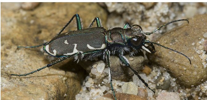
Appalachian tiger beetle ~ Ellis Lauder milk, KSNPC

Over 2,600 tiger beetle species have been described in the world with about 109 species known from North America north of Mexico. Recent field surveys across the state and visits to museums by tiger beetle enthusiasts (also known as