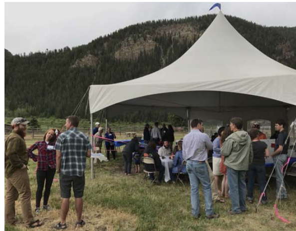
The reception venue was Cement Creek Ranch at the foot of Cement Mountain