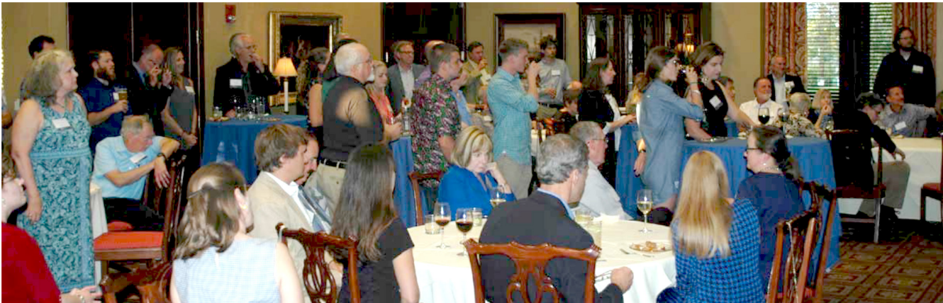
Below: the venue for our Lexington125 celebration was the Boone Center on the UK campus. Over 125 alumni, family, and friends attended.