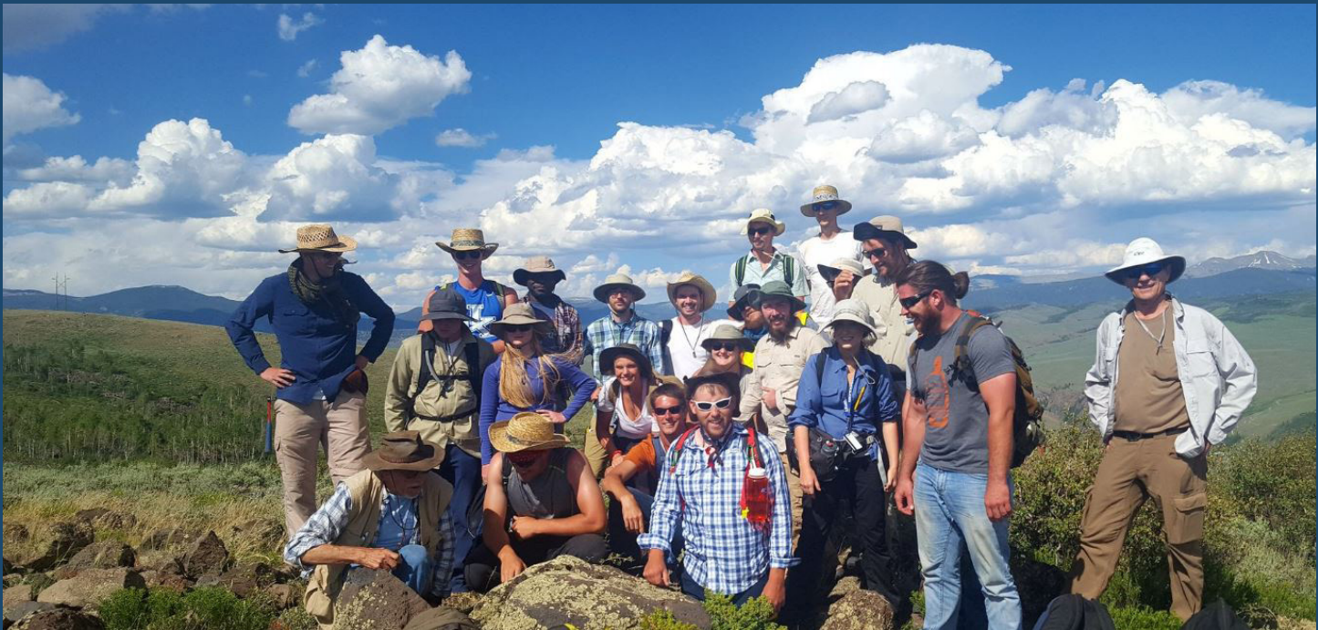
The traditional group photo on top of Almont after measuring the Mesozoic and Cenozoic sections.