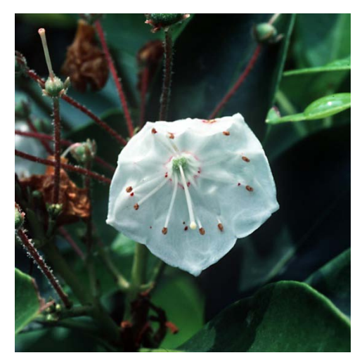
Figure 34. Mountain laurel.

Other names: Southern mountain-laurel, American laurel, wood laurel, small laurel, poison laurel, Chamaedaphne latifolia, Cistus chamaerhodendros, Kalmia ferruginea, Kalmia myrtifolia