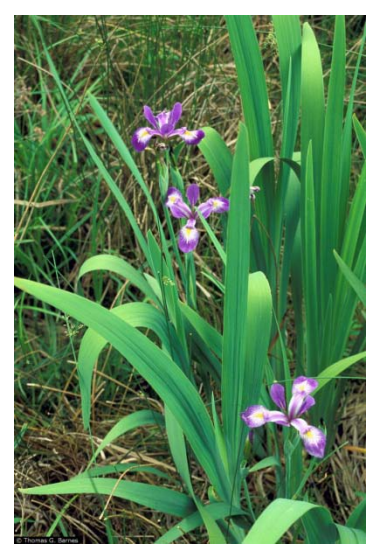
Figure 22. Virginia Iris. Barnes, T.G. and S.W. Francis. 2004. Wildflowers and ferns of Kentucky.

Other names: blue flag, blue flag iris, wild iris, fleur-de-lis