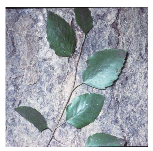
Figure 38. River birch. Photo by Robert H. Mohlenbrock, USDA-SCS. 1989. Midwest wetland flora: field office illustrated guide to plant species @ USDA-NRCS PLANTS Database.

Other names: black birch, red birch, Japanese red birch, water birch, Betula lanulosa , Betula rubra