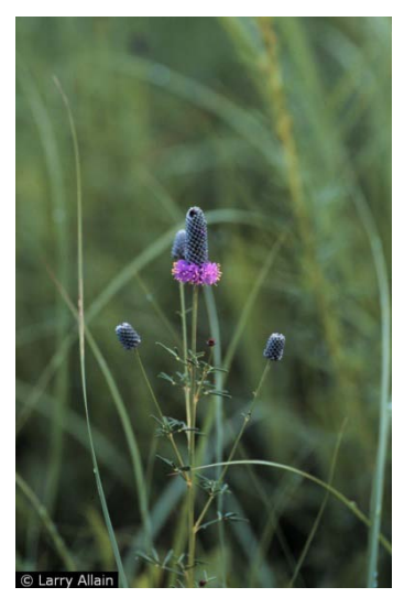
Figure 26. Violet prairieclover.

Other names: purple prairie clover, red tasselflower, thimbleweed