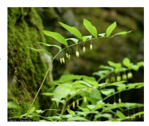
Figure 17. Smooth Solomon's seal.

Other names: Solomon's seal, King Solomon's seal, Convallaria angustifolia, C. canaliculata, C. commutate, C. parviflora