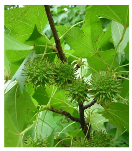
Figure 41. Sweetgum.

Other names: American sweetgum, storax, styrax, star-leaf gum, sap gum, red gum, Liquidambar barbata, L. gummifera, L. macrophylla