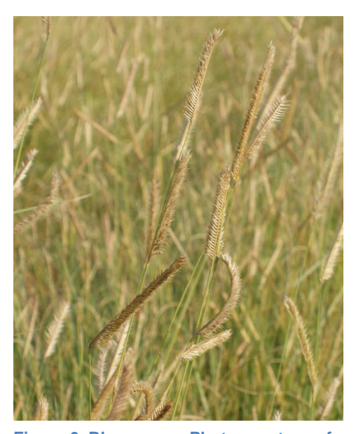
Figure 6. Blue grama.