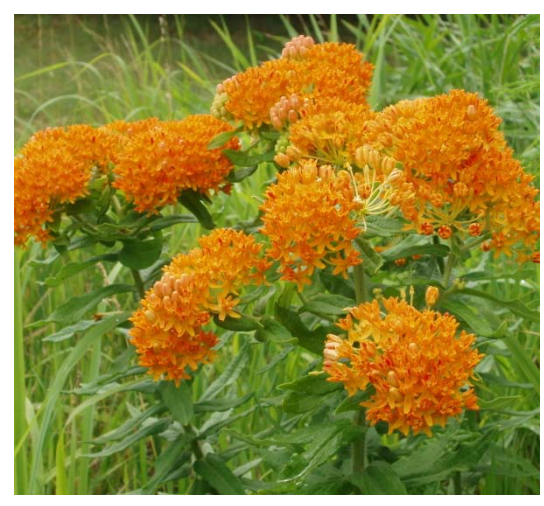
Figure 20. Butterfly milkweed.

Other names: chigger weed, pleurisy root, butterfly weed, Indian post, Canada tuber, orangeroot, orange milkweed, whiteroot, windroot, yellow milkweed