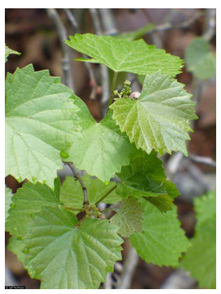
Figure 50. Muscadine grape.

Other names: muscadine, frost-grape, riverbank grape, wild grape, bull grape, bullit grape, bullace, Muscadinia munsoniana , M. rotundifolia, Vitis amara, V. angulata, V. campestris, V. cordifolia, V. munsoniana, V. muscadina, V. verrucosa, V. vulpina