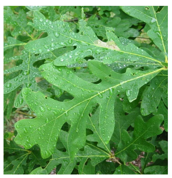
Figure 44. White oak.

Other names: stave oak, northern white oak, eastern white oak, Quebec oak, fork-leaved white oak, fork-leaf oak, stone oak, Quercus repanda