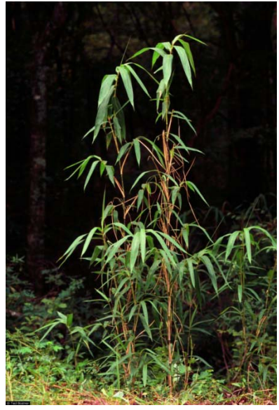
Figure 5. Giant cane.

Other names: cane, cane reed, giant cane, large cane, small cane, A. bambusina, A. macrosperma, A. tecta, Bambusa newmanii, Festuca grandiflora, Ludolfia macrosperma, L. tecta, Miegia gigantea, M. macrosperma, M. pumila, Nastus macrospermus, Triglossum bambusinum