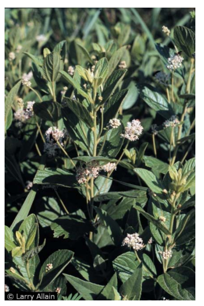
Figure 9. New Jersey tea.

Other names: inland ceanothus, Indian tea, walpalo tea, mountain sweet, wild snowbell, red root, Ceanothus intermedius