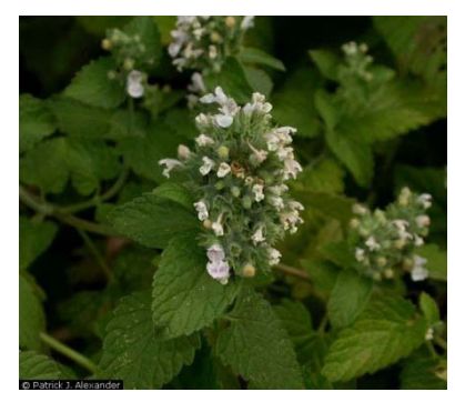
Figure 12. Catnip.

Other names: catmint, catwort, nip, field balm