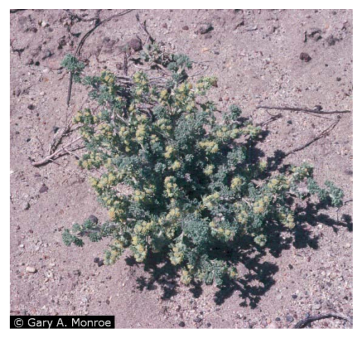
Figure 23. Prairie sagewort.

Other names: fringed sagebrush, fringed sagewort, fringed sage, prairie sage, wormwood, pasture sagebrush, and woman sage