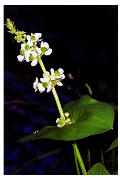
Figure 14. Broadleaf arrowhead.

Other names: arrowhead, common arrowhead, Indian potato, tule potato, duck potato, muskrat potato, wapato, arrowleaf waterplant, S. chinensis, S. engelmannia, S. esculenta, S. longirostra, S. obtusa, S. ornithorhyncha, S. planipes, S. pubescens, S. variabilis, S. viscose