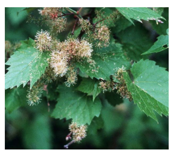
Figure 51. Riverbank grape. Photo courtesy Bill Summers, USDA-SCS. 1991. Southern wetland flora: Field office guide to plant species. @ USDA-NRCS PLANTS Database.

Other names: frost grape, winter grape, fox grape, Vitis vulpine, V. cordifolia, V. illex