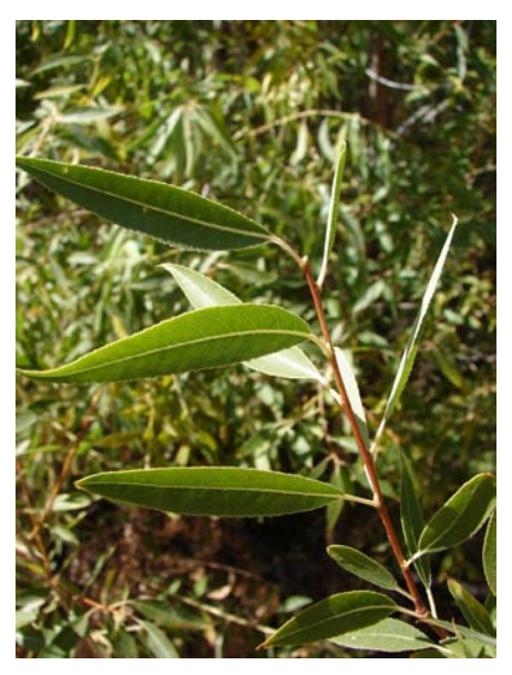
Figure 46. Peach-leaved willow.

Other names: Willow, almond willow, black willow, swamp willow, Dudley willow, Goodding willow, Salix nigra, S. gooddingii, S. wrightii