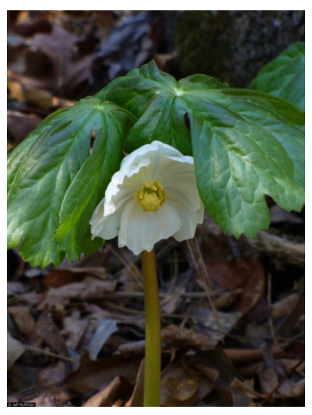
Figure 16. Mayapple.

Other names: mandrake, wild mandrake, wild lemon, ground hog lemon, hog apple, devil's apple, Indian apple, pomme de mai, podophylle pelte, Anapodophyllum peltatum, Podophyllum callicarpum, P. montanum, P. pubescens