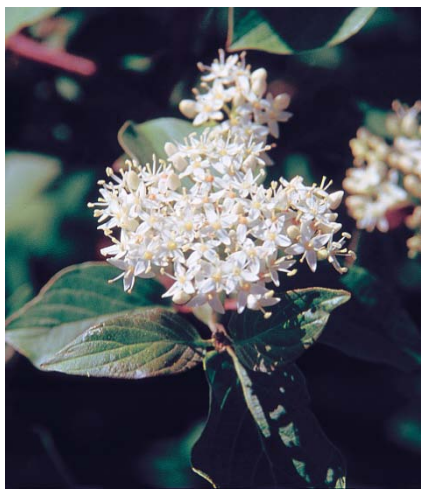
Figure 35. Redosier dogwood.

Other names: American dogwood, western dogwood, redstem dogwood, red willow, Cornus alba, C. bailey, C. instolonea, C. interior, C. stolonifera