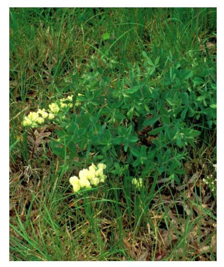
Figure 28. Plains wild indigo. Barnes, T.G. and S.W. Francis. 2004. Wildflowers and ferns of Kentucky.

Other names: longbract wild indigo, creamcolored false indigo, yellowish false indigo, white stem wild indigo, large bracted wild indigo, rattlepod