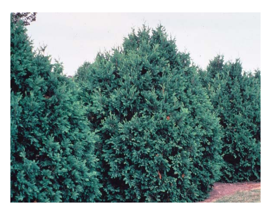
Figure 47. Arborvitae.

Other names: tree of life, Northern white cedar, flat cedar, cedar, white cedar, Eastern white cedar