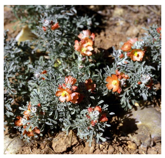
Figure 32. Scarlet globemallow.

Other names: red false mallow, false mallow, common globemallow, prairie mallow, desert mallow, flame mallow, copper mallow, cowboy's delight