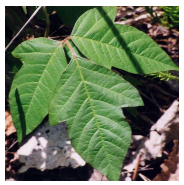
Figure 49. Eastern poison ivy.

Other names: poison ivy, vine poison ivy, Rhus blodgettii, R. floridana, R. humilis, R. littoralis, Toxicodendron blodgettii, T. glabrum, T. gonicarpum, T. vulgare