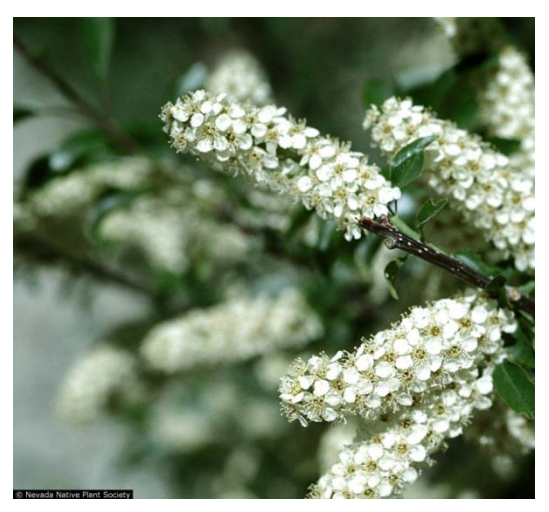
Figure 36. Chokecherry.

Other names: common chokecherry, red chokecherry, bird cherry, jam cherry