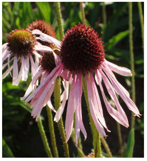
Figure 27. Blacksamson.

Other names: blacksamson Echinacea, purple coneflower, narrow-leaved purple coneflower, red sunflower, snakeroot, Kansas snakeroot, scurvy root, comb flower, hedgehog