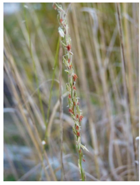
Figure 1. Side oats grama.

Other names: tall grama, avenilla, banderilla, banderita