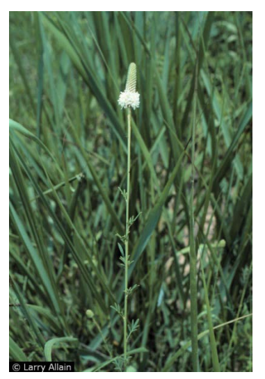
Figure 25. White prairieclover.

Other names: white tasselflower, thimbleweed, Petalostemon candidum