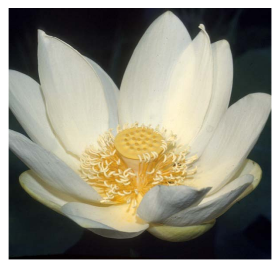
Figure 13. American lotus.

Other names: lotus, yellow lotus, water chinquapin, Nelumbo pentapetala , Nelumbium luteum