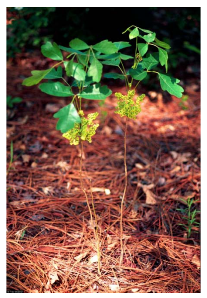
Figure 48. Atlantic poison oak.

Other names: poison oak, eastern poison oak, Rhus acutiloba, R. pubescens, R. quercifolia, R. radicans, R. toxicarium, R. toxicodendron, Toxicodendron compactum, T. monticola, T. quercifolium