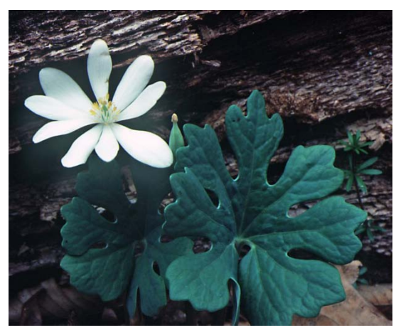
Figure 31. Bloodroot.

Other names: bloodwort, redroot, red puccoon, Indian paint, S. australis