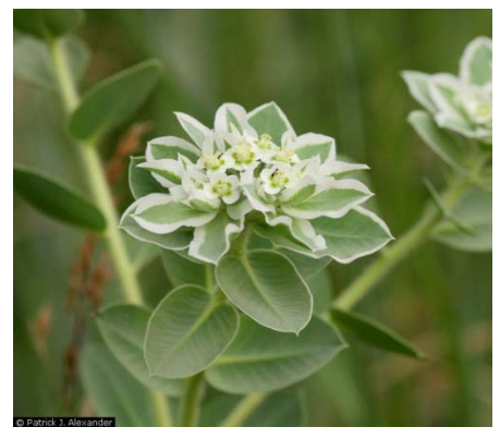
Figure 30. Snow-on-the-mountain.

Other names: ghostweed, smoke on the prairie, white-margined spurge, variegated spurge, Lepadena marginata