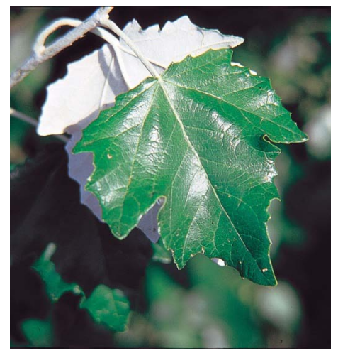
Figure 42. White poplar.

Other names: silver poplar, silverleaf poplar