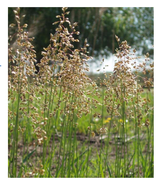
Figure 2. Vanilla grass.

Other names: sweetgrass, holy grass, Torresia odorada