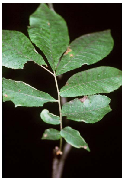
Figure 39. Bitternut hickory. Robert H. Mohlenbrock, USDA-SCS. 1991. Southern wetland flora: field office guide to plant species @ USDA-NRCS PLANTS

Other names: bitternut, swamp hickory, pignut hickory, pignut, pig hickory, white hickory, red hickory, bitter walnut, bitter pecan, bow wood, Carya amara, Hicoria cordiformis, H. minima, Juglans alba, J. amara, J. coarctata, J. cordiformis, J. sieboldiana, J. subcordiformis