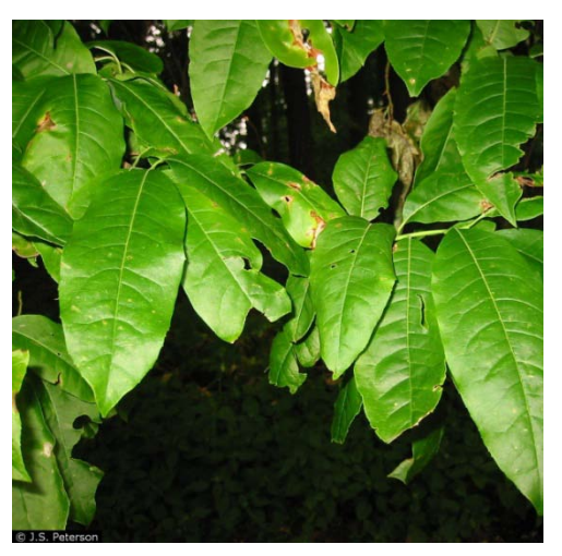
Figure 21. Sourwood.

Other names: sorrel tree, lily-of-thevalley-tree, sour gum, elk tree, Andromeda arborea, Lyonia arborea