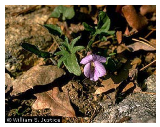
Figure 18. Early blue violet.

Other names: palmate violet, Viola affinis, V. esculenta, V. stoneana