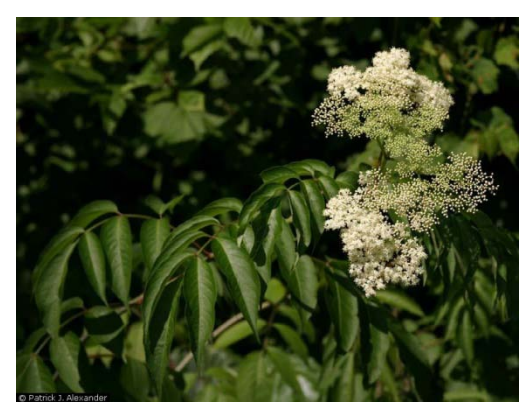
Figure 37. Elderberry. Photo by Robert H. Mohlenbrock, USDA-SCS. 1989. Midwest wetland flora: field office illustrated guide to plant species @ USDA-NRCS PLANTS Database.

Other names: blue elderberry, common elderberry, American elder, Sambucus canadensis, S. caerulea, S. mexicana, S. orbiculata, S. simpsonii