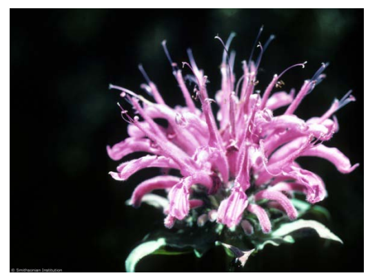
Figure 19. Wild bergamot.

Other names: bee-balm, horse mint, mintleaf beebalm, bergamot, Oswego-tea