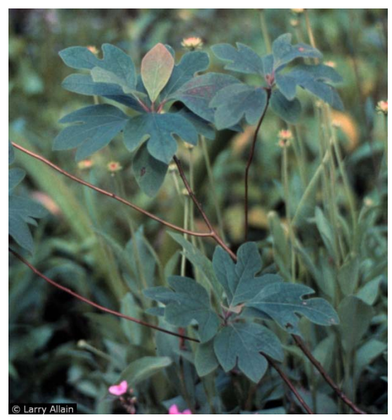
Figure 45. Sassafras.

Other names: common sassafras, white sassafras, saxifrax, Euosmus albida, Laurus albida, L. albidus, L. diversifolia, L. sassafras, L. variifolia, Persea sassafras, Sassafras laurus, S. officinale, S. varifolium, Tetranthera albida