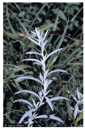
Figure 24. White sagebrush.

Other names: white sage, sagewort, Louisiana sagewort, Louisiana sage, Louisiana sagebrush, prairie sage, cudweed, cudweed sagebrush, cudweed sagewort, mugwort, western mugwort, wormwood, ghost plant, man sage