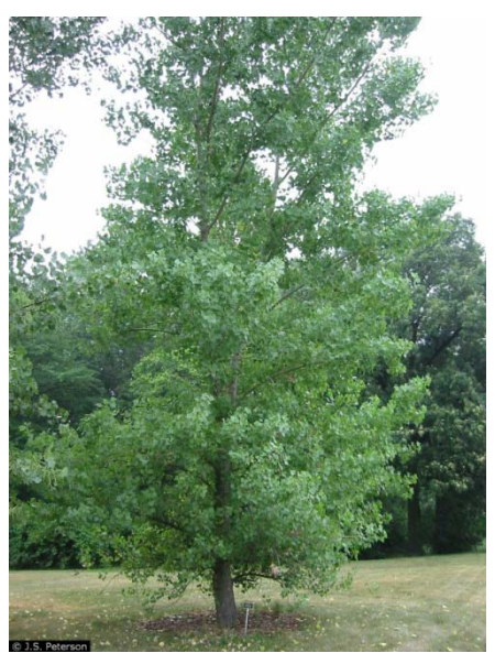
Figure 43. Eastern cottonwood.

Other names: cottonwood, common cottonwood, plains cottonwood, river cottonwood, southern cottonwood, Texas cottonwood, Carolina poplar, plains poplar, eastern poplar, necklace poplar, Populus angulata