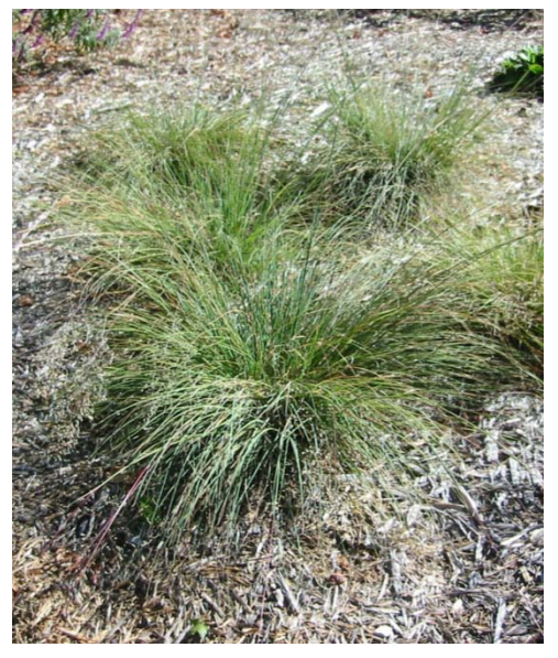
Figure 4. Prairie dropseed.