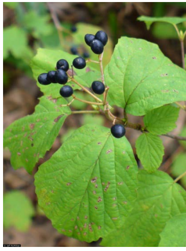
Figure 33. Mapleleaf viburnum.

Other names: maple-leaved arrow-wood, arrowwood, dockmackie, dogmackie, guilderrose, possum-haw, squash-berry, Viburnum densiflorum , V. involucratum