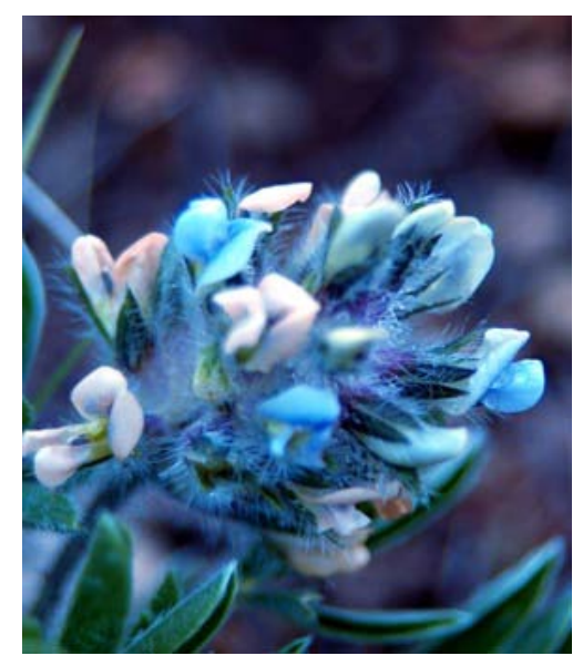
Figure 11. Large Indian breadroot.

Other names: Indian breadroot, breadroot, prairie turnip, prairie potato, prairie apple, wild turnip, pomme blanche, pomme de prairie, tipsin, tipsinna, Psoralea esculenta