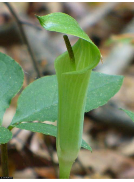
Figure 15. Jack-in-the-pulpit.

Other names: Indian turnip, Indian onion, wild turnip, marsh turnip, swamp turnip, meadow turnip, pepper turnip, wild pepper, bog onion, arum, American arum, wake robin, dragon root, aronknolle, A. artrorubens, A. stewardsonii, A. triphyllum, Arum atrorubens