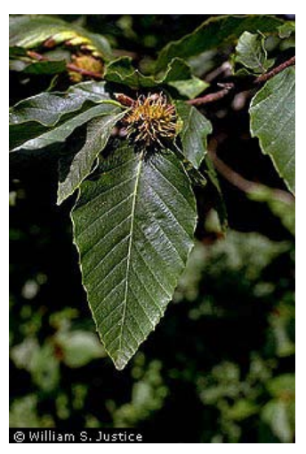
Figure 40. American beech.

Other names: beech, beech nuts, beech tree, Carolina beech, gray beech, red beech, white beech, ridge beech, Fagus americana , F. ferruginea , F. mexicana