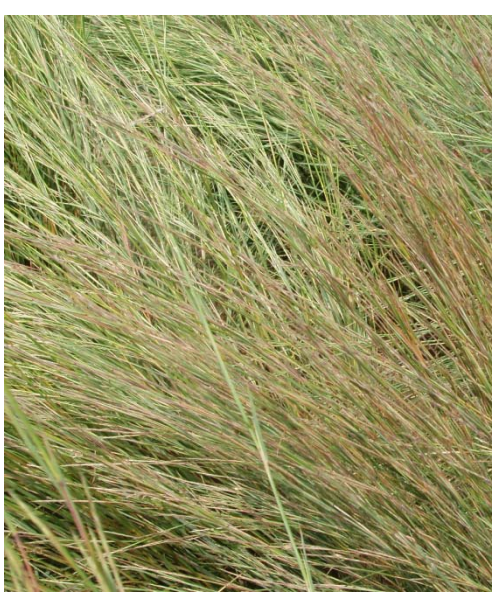
Figure 3. Little bluestem.

Other names: bearded grass, prairie beard grass, broom beardgrass, small feathergrass, pinehill bluestem, seacoast bluestem, Andropogon scoparious