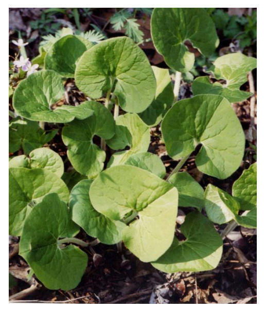
Figure 8. Canadian wildginger.

Other names: wild ginger, American wildginger, Indian ginger, Canadian snakeroot, snakeroot, coltsfoot, false snakeroot, black snakeroot, colicroot, beaver potato, A. acuminataum, A. carolinianum, A. latifolium, A. reflexum