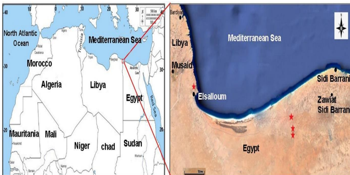
Fig. 1. Distribution of O. arenarium in Egypt

Here, O. arenarium , which is known from the Mediterranean coast, 60 km east of El-Salloum, and the El-Salloum plateau in Matrouh Governorate, Egypt, is newly documented for the flora of Egypt (Fig. 1). The species is native to North Africa, specifically Algeria, Libya, Morocco, and Tunisia (POWO, 2021). Consequently, it is more likely to occur in Egypt.