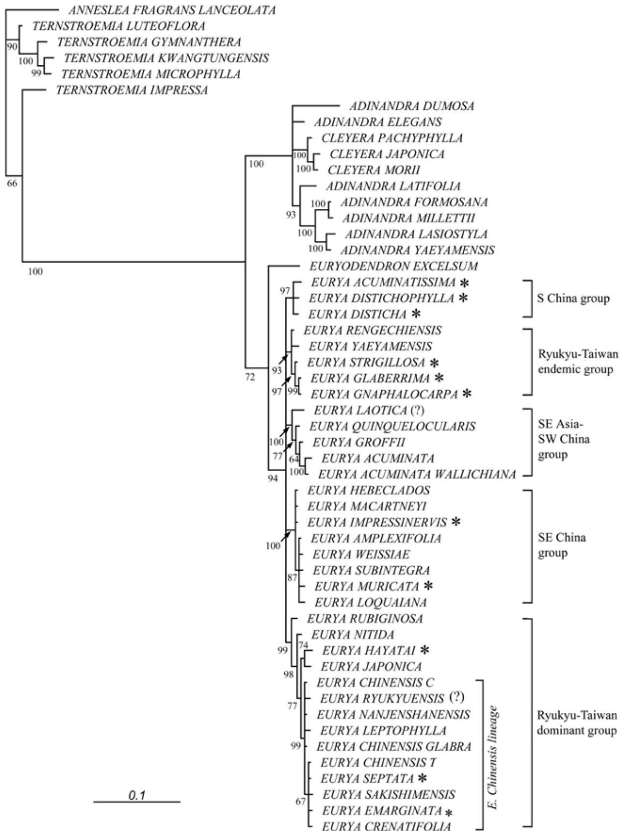
Figure 4. Species tree two with the same dataset as species tree two. This is the MajRule tree generated from the Bayesian analysis. The posterior probabilities higher than 50% are shown beneath the branches. Asterisks (*) indicate the presence of anther septation, two species are unknown in this regard and marked with a “?”, the remaining species have no anther septa.