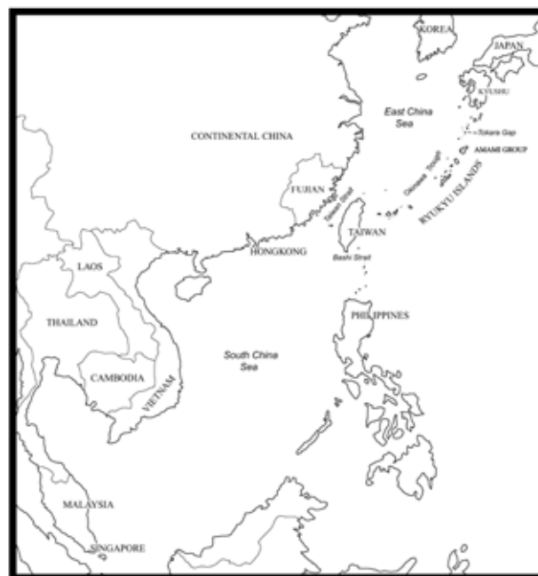
Figure 1. Map of SE Asia and E Asia.

the Ryukyus listed in the “Flora of the Ryukyus, South of Amami Island” (Hatusima and Amano, 1994) also reveals that 96% (650 out of 672) of its native genera are also native to Taiwan.