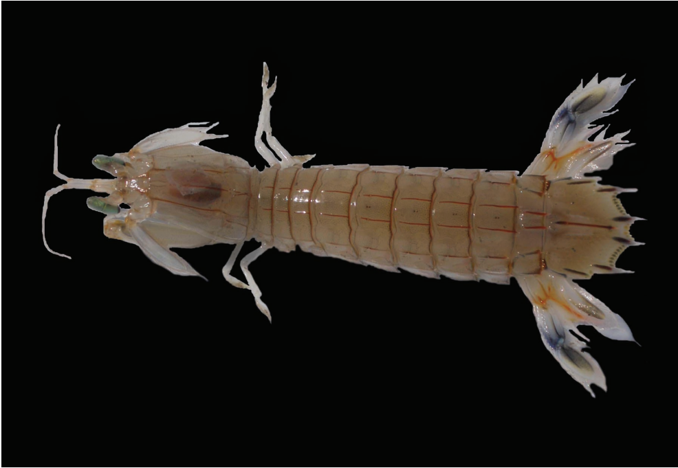
Fig. 1: Geographical location and sampling station (black bullet) of Erugosquilla massavensis .

LEWINSOHN & MANNING, 1980), Israel (LEWINSOHN & MANNING, 1980), Syria (HASSAN & NOEL, 2007), Lebanon (HOLTHUIS, 1961; LEWINSOHN & MANNING, 1980), Cyprus (INGLE, 1963; LEWINSOHN & MANNING, 1980), Greece: Crete (DOUNAS & STEUDEL, 1994), Rhodes Island (GALIL & KEVREKIDIS, 2002), Karpathos (CORSINI & KONDYLATOS, 2006) and Libya (SHAKMAN & KINZELBACH, 2007). Erugosquilla massavensis is now reported as the first record for the Aegean coast of Turkey (Fig. 2).