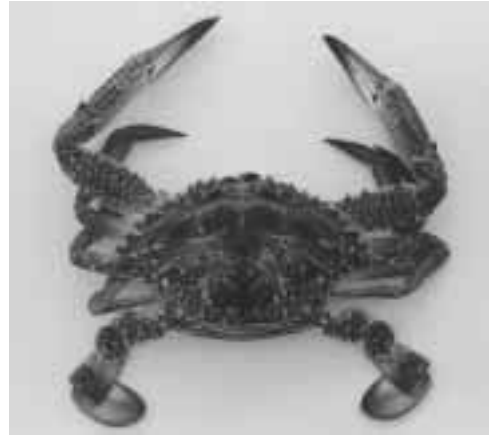
Fig. 2: A live female of Portunus pelagicus , dorsal view (Carapace width: 170.7 mm).

Four specimens as follows: 1 spm, 87.5 TL, 75mm SL, 18g, 1 spm, 80.1mm TL, 67.1 SL, 11.5g, 1 spm, 96mm TL, 80mm SL, 25g, 1 spm, 84mm TL, 76mm SL, 13g. Morphometric characters were measured on two specimens (Table 2).