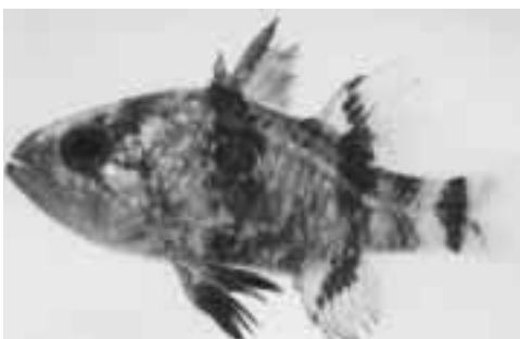
Fig. 3: A live specimen of Apogon pharaonis (80 mm SL).

Three specimens, maintained in the Aquarium of the Hydrobiological Station of Rhodes, are carnivorous (mussels, shrimps, squids) and hardy. Being a nocturnal species (TORTONESE, 1986), it prefers to retreat and hide in small caves, under the rocks and in empty shells.